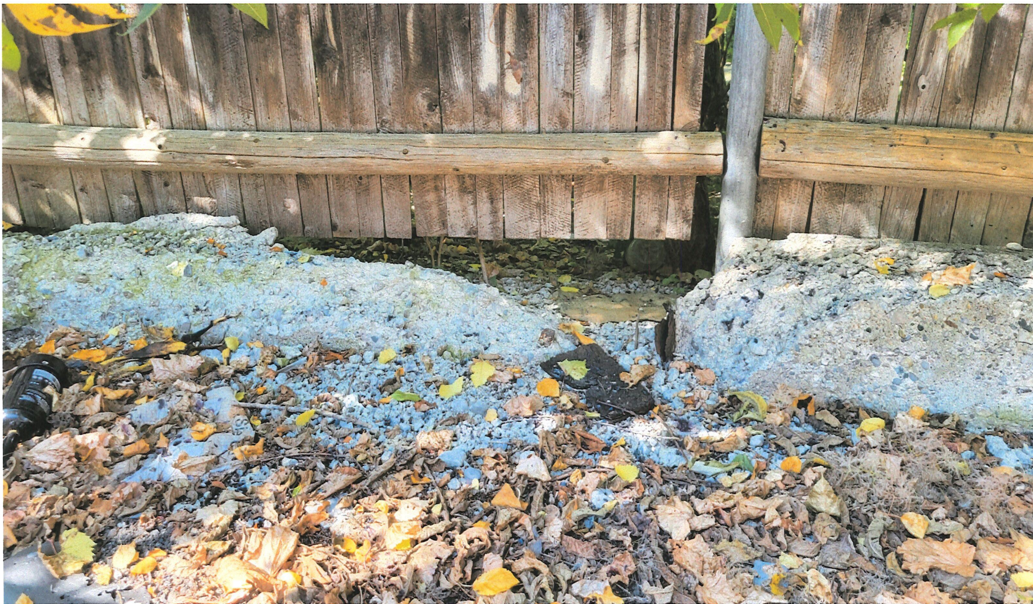
Holes in concrete footer