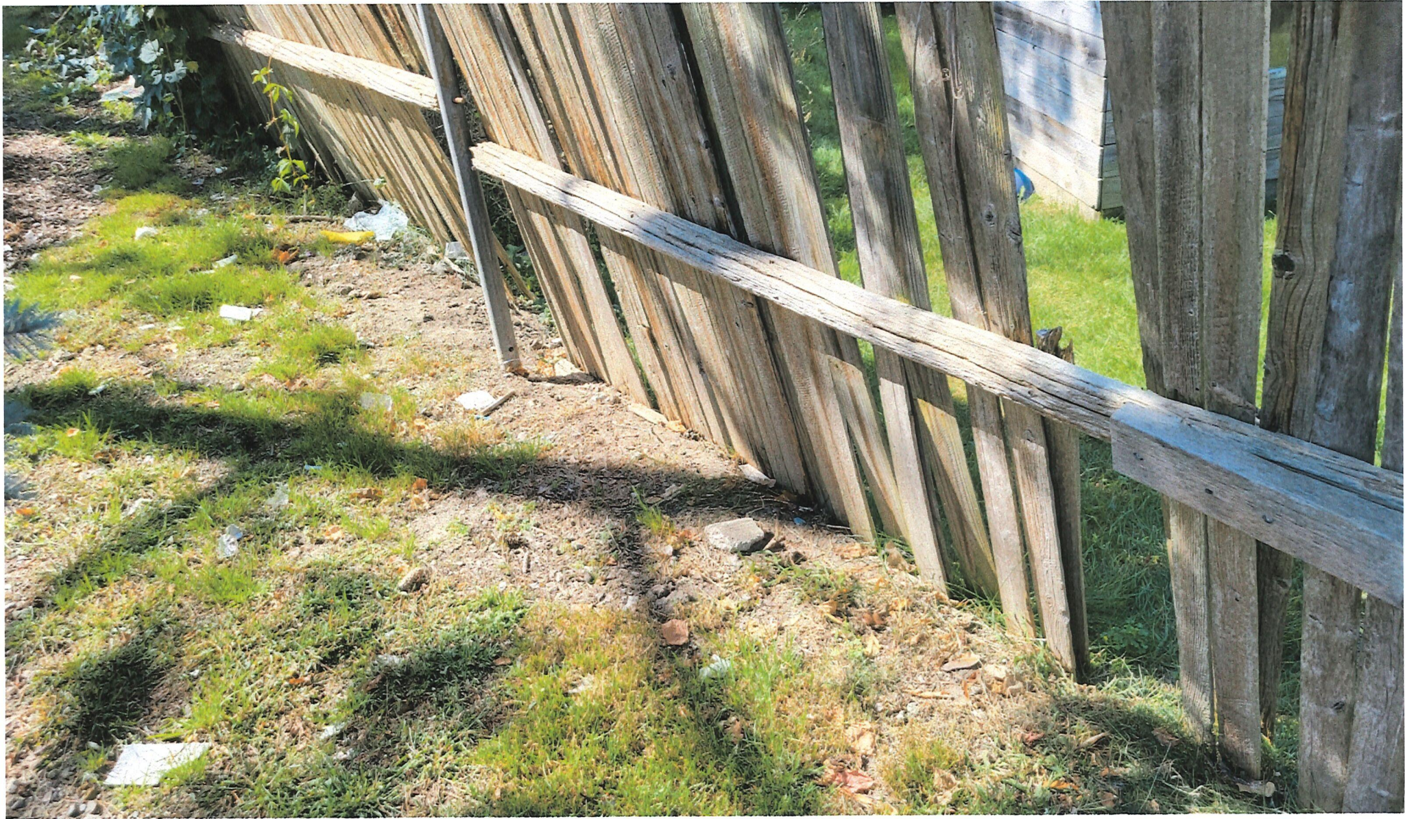
LAND built up, fence now below grade