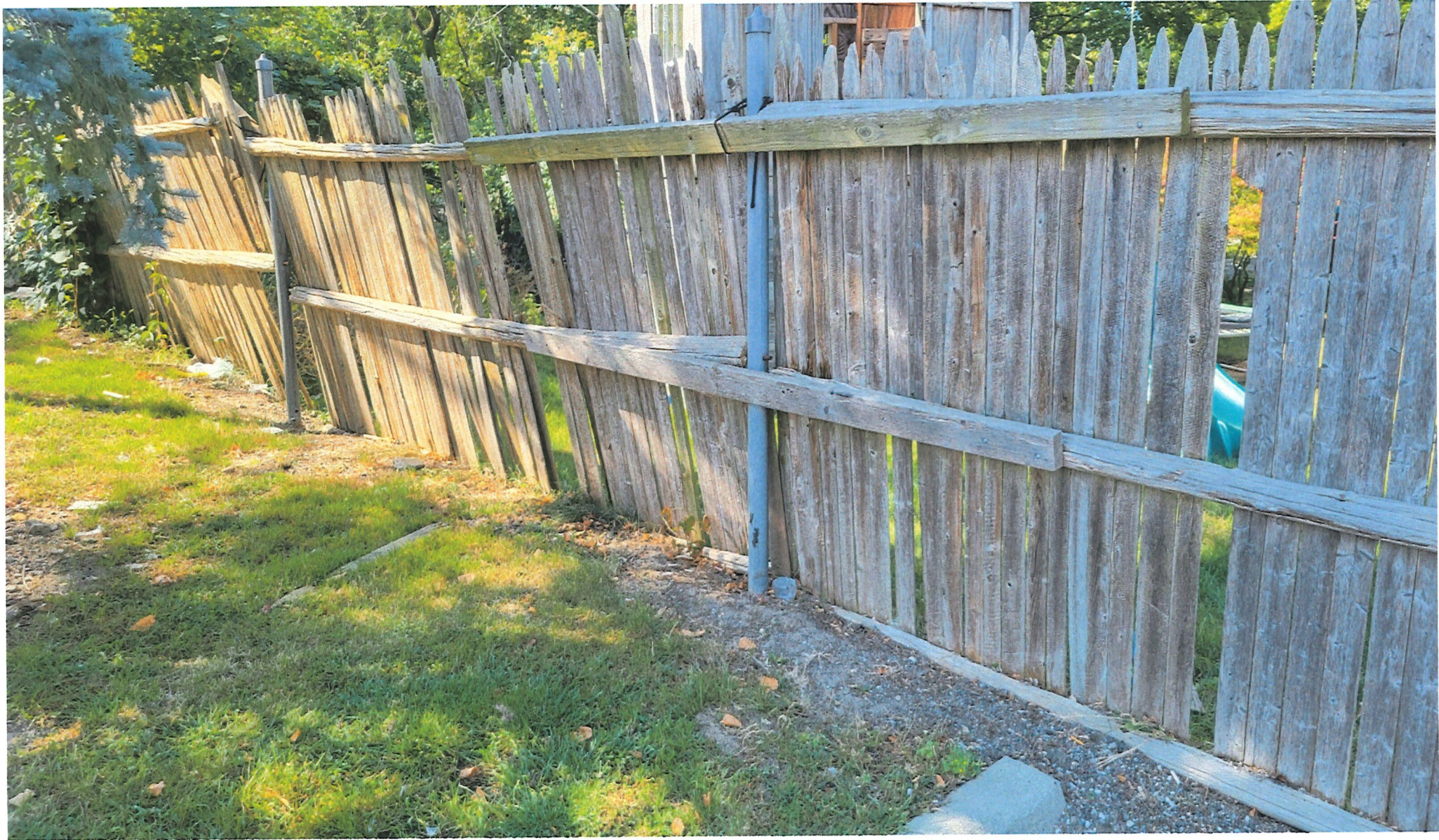
Bottom of fence pushed into neighbor's property