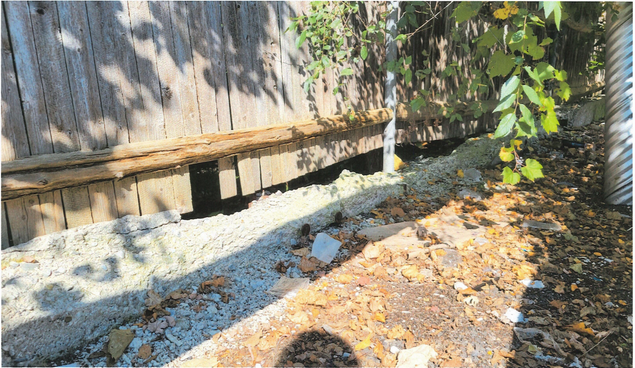
Holes below fence, animal traffic