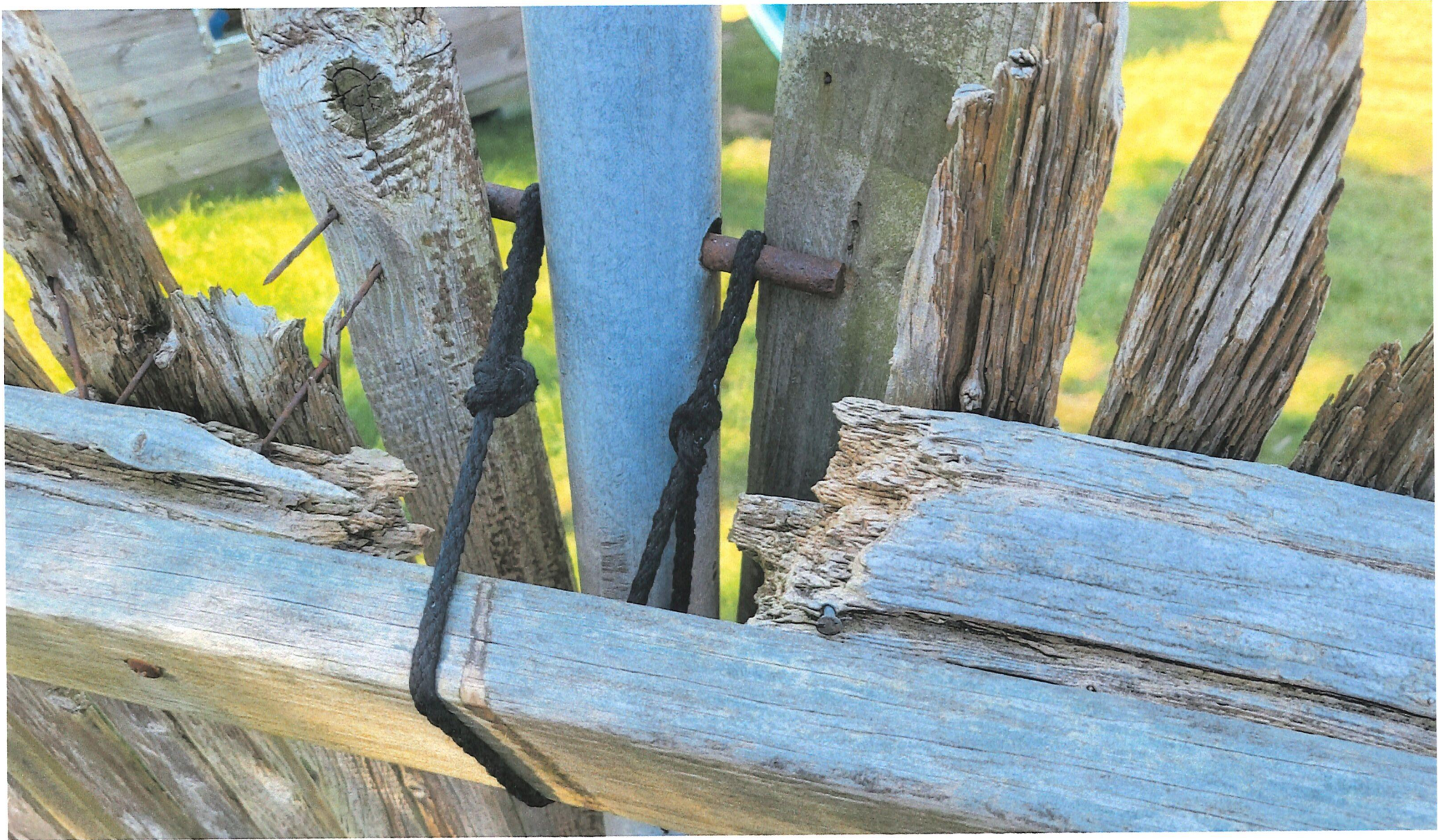
Fence held together w/ rope