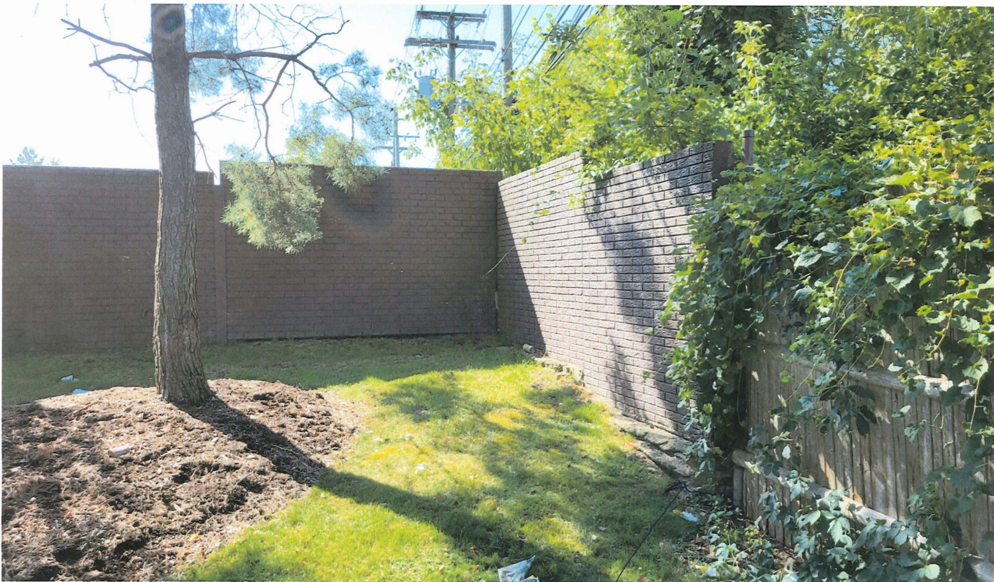
Exposed footer, water erosion