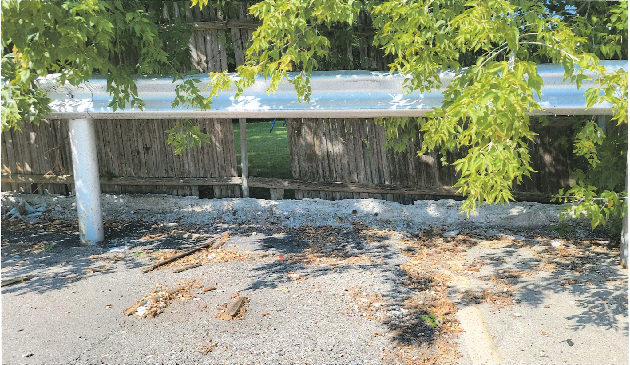
Holes in fence