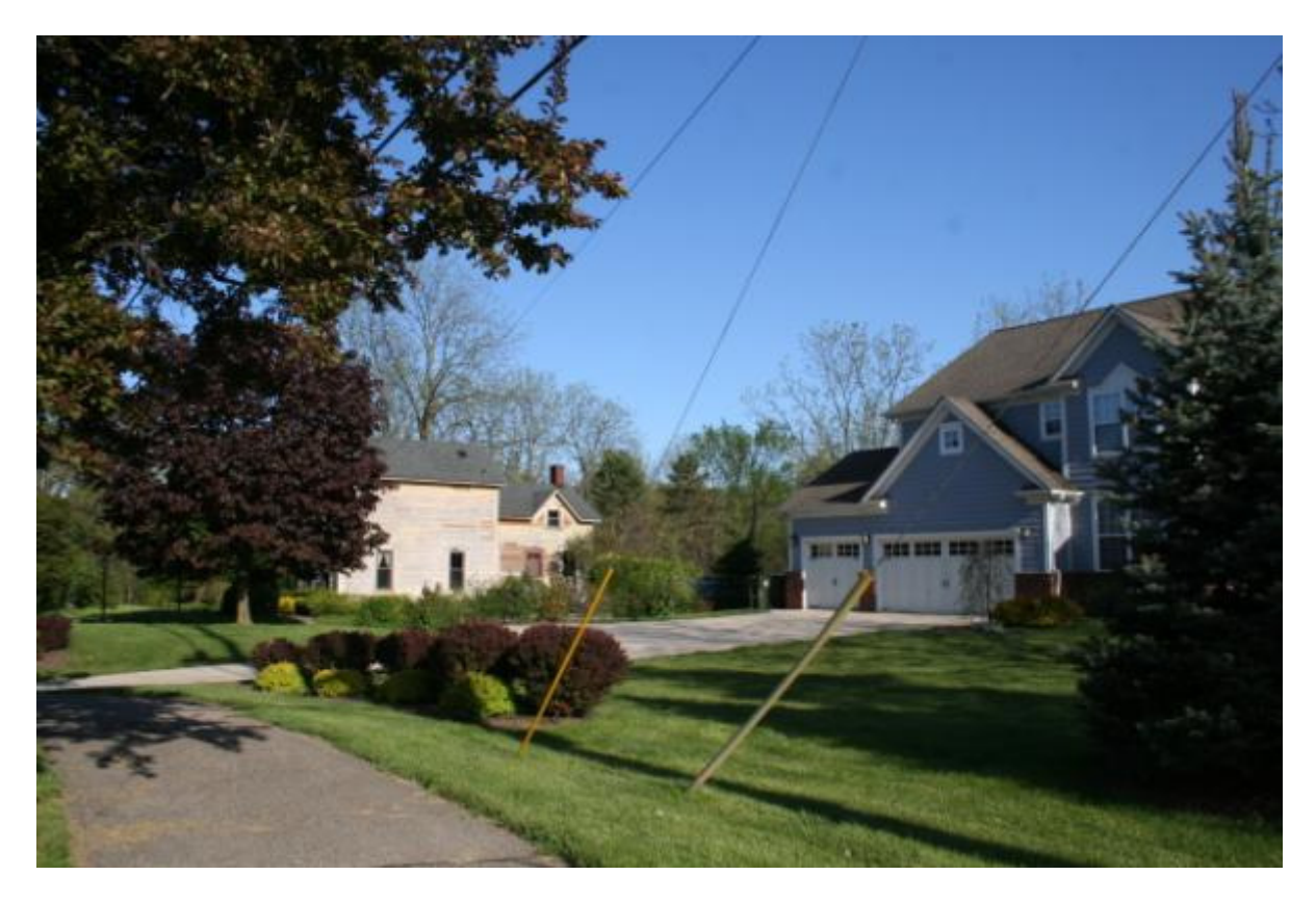
Looking east at 1651 and 1631 W. Avon Road, May 2012