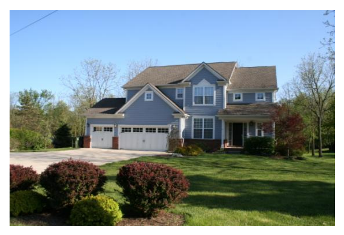
Looking south at 1651 W. Avon Road, constructed 2004, May 2012