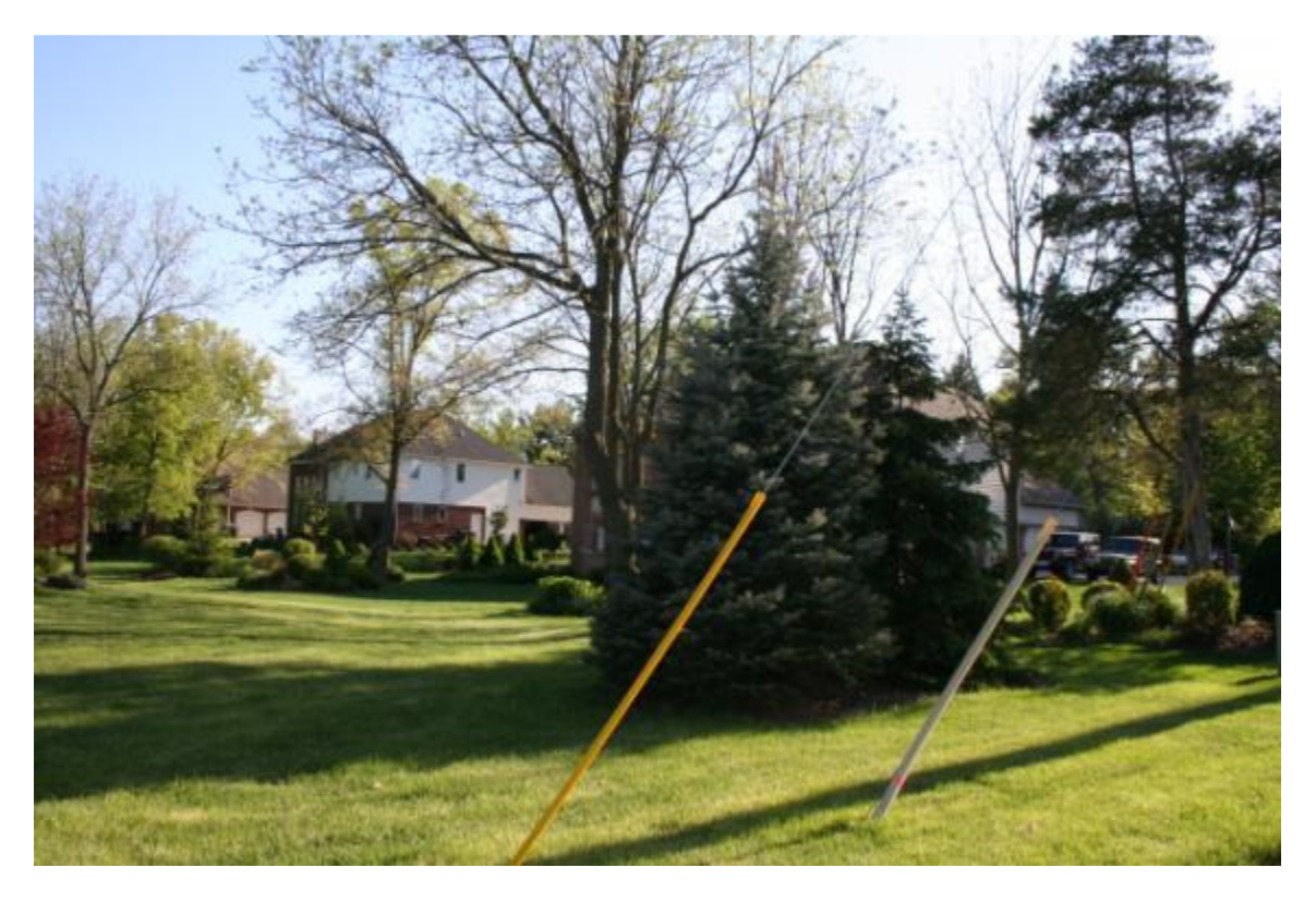
Houses to the southwest of 1631 W. Avon Road, May 2012