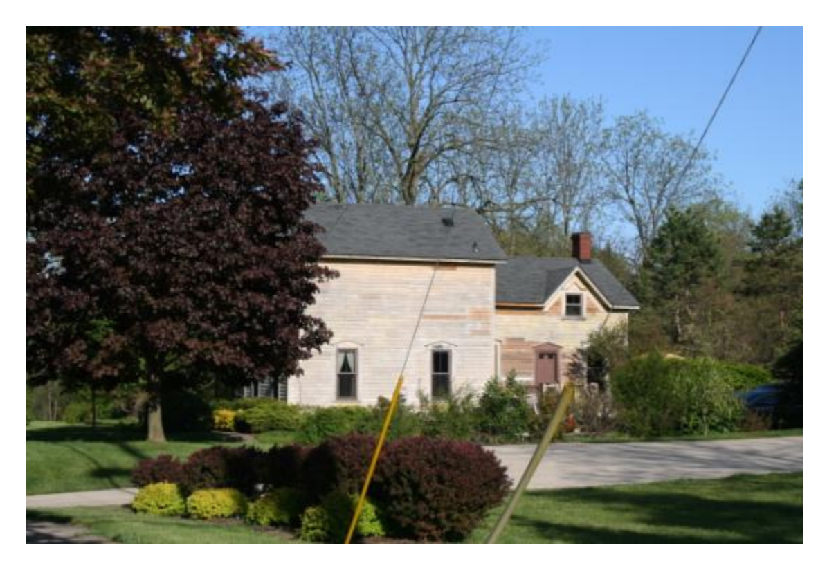
Looking east at 1631 W. Avon Road, May 2012