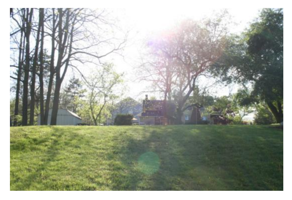
Looking west at 1631 W. Avon Road, non-historic shed to left, May 2012