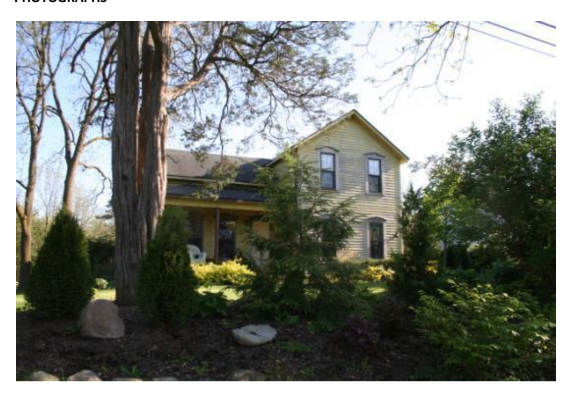
Looking southwest at 1631 W. Avon Road, May 2012