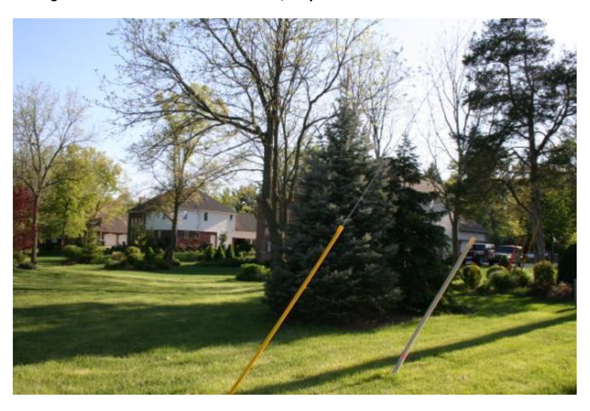
Houses to the southwest of 1631 W. Avon Road, May 2012