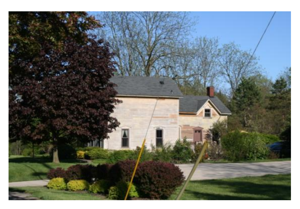
Looking east at 1631 W. Avon Road, May 2012