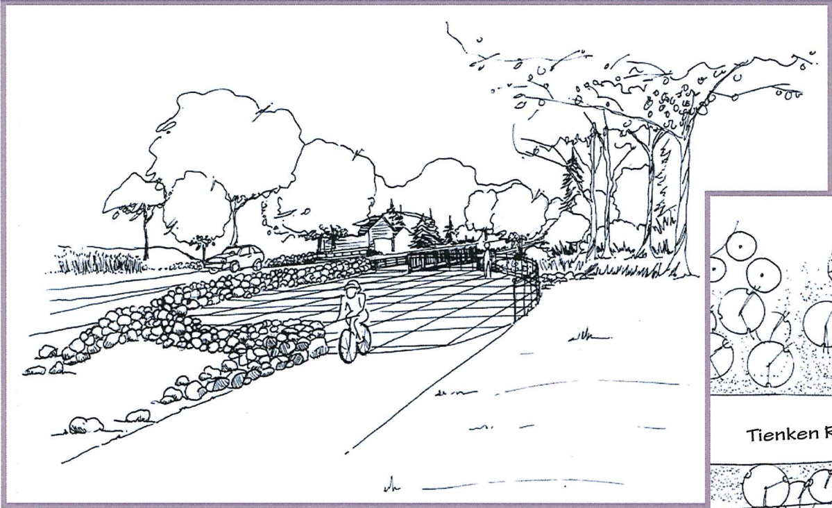
◀ Concept of the non-motorized path, on the west side of the Stoney Creek Bridge, looking to the east.

3. Providing a pedestrian crossing of Stoney Creek is essential and can be accomplished with design sensitivity with its integral incorporation into the bridge deck itself.