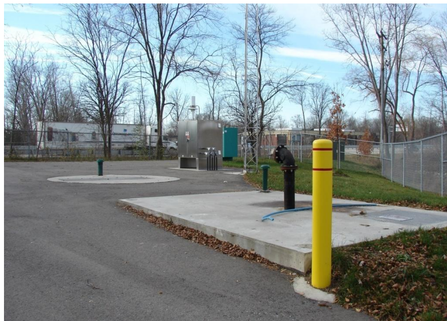
Michelson Pump Station