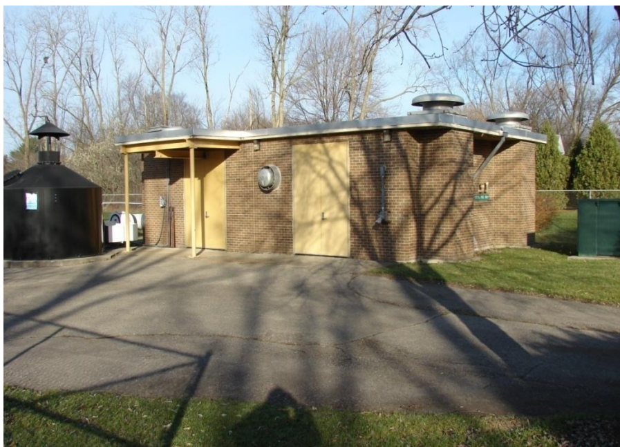
Existing Grant Pump Station

The proposed Grant Pump Station will look similar to the Michelson Pump Station