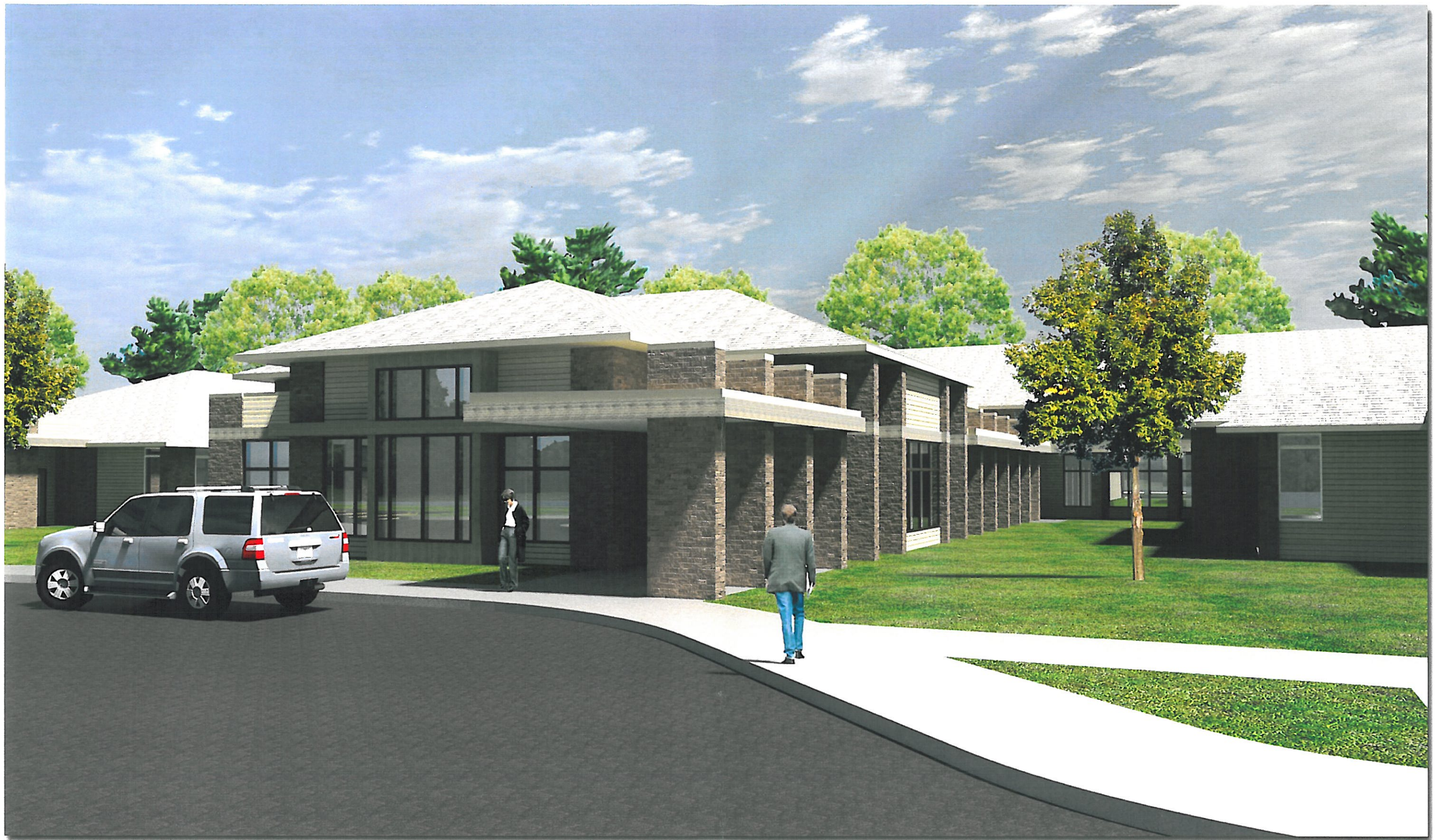
FRONT ENTRY VIEW