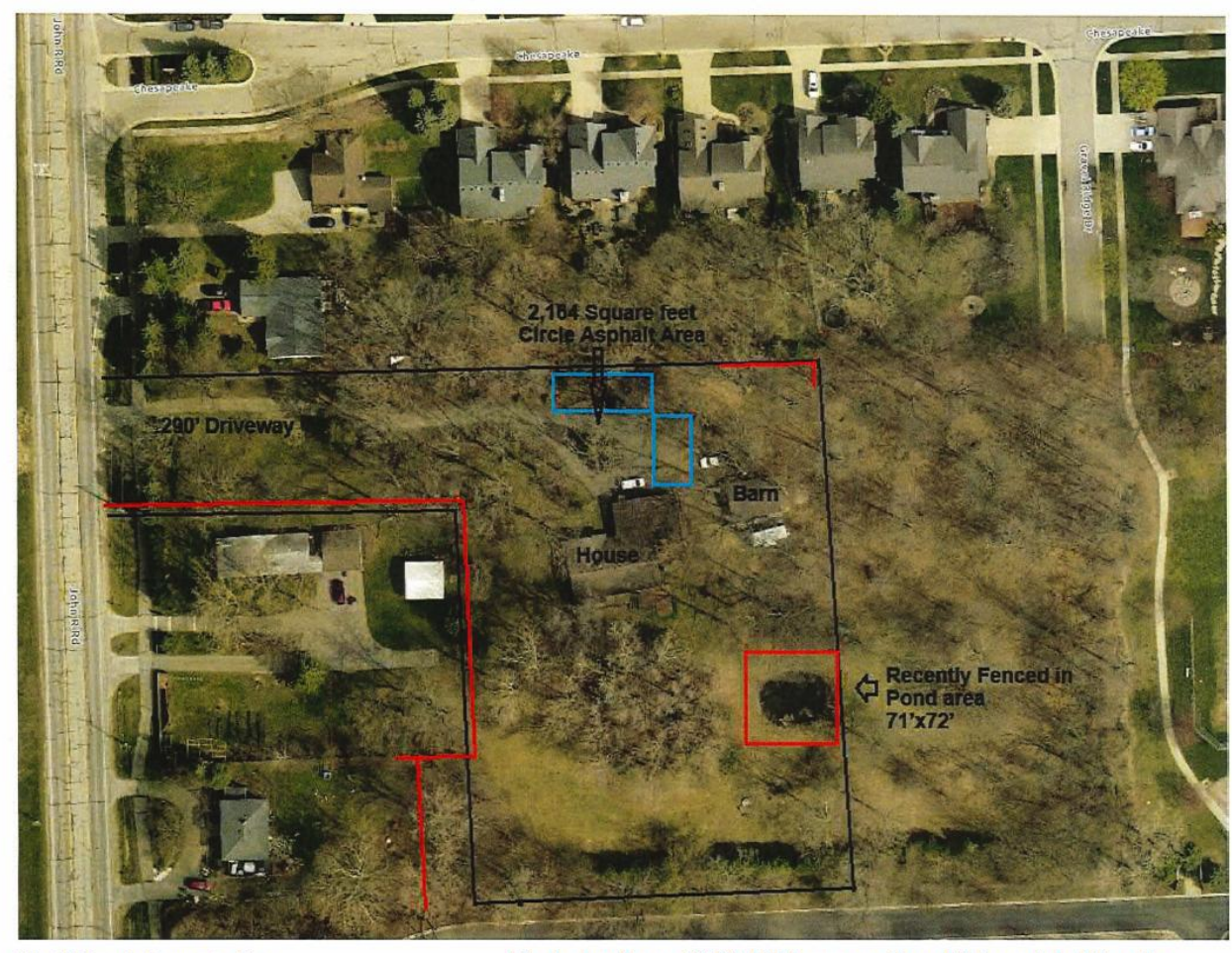
Black Line is Property Line Red Line = Existing Fence Blue Line= Gravel Parking for 9 Cars