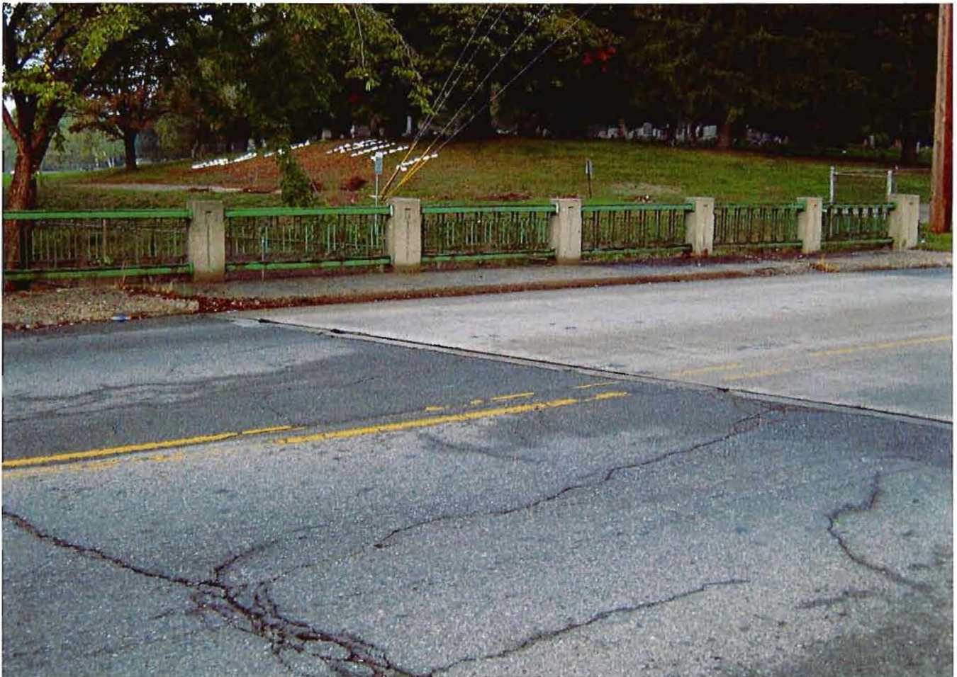
PHOTO #3 EXAMPLE OF VINTAGE PANELS IN PLACE - PAIDDOCK ST. OVER CLINTON RIVER - PONTIAC