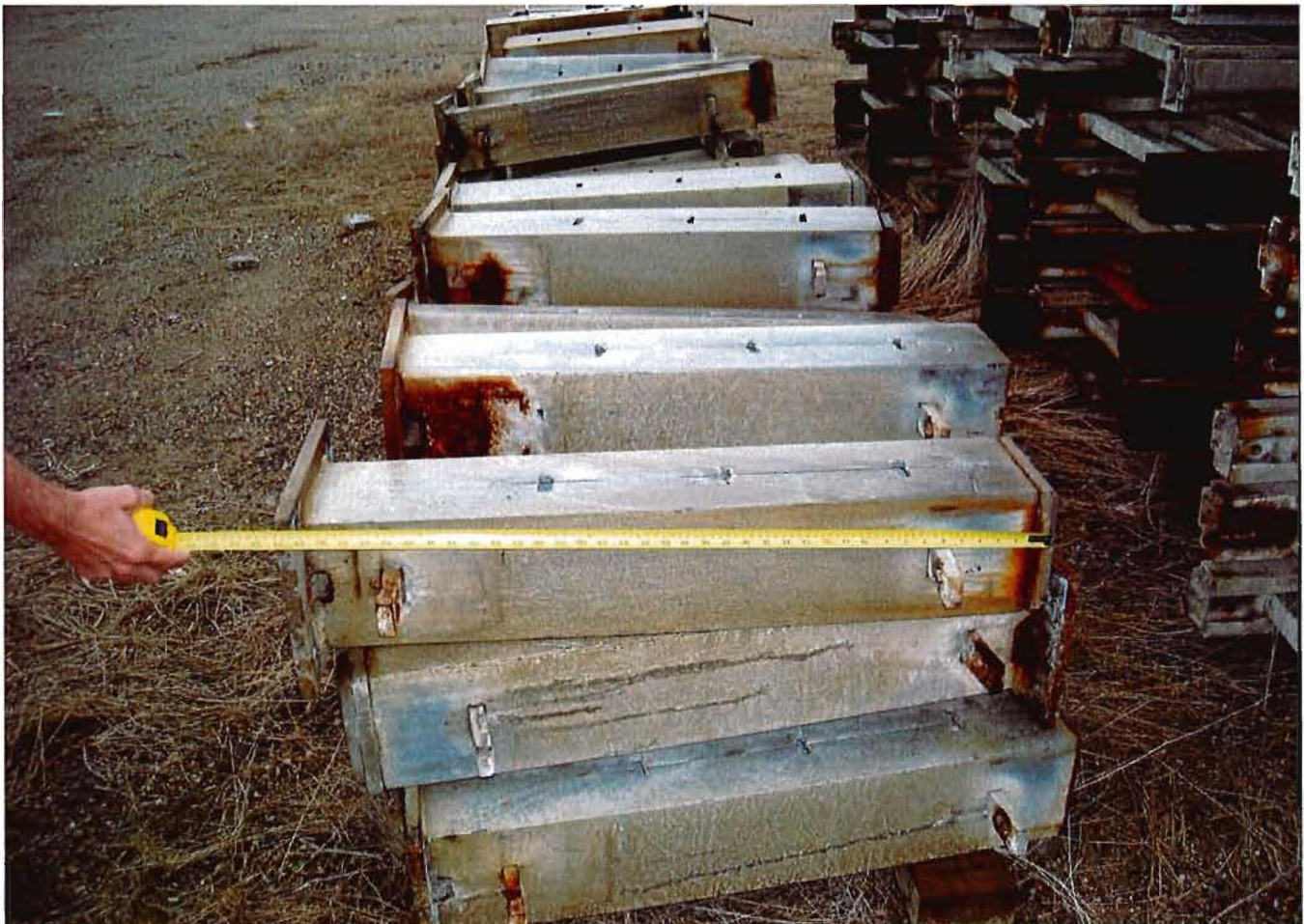
PHOTO 4 MDOT SALVAGED STEEL POSTS FOR VINTAGE RAILING