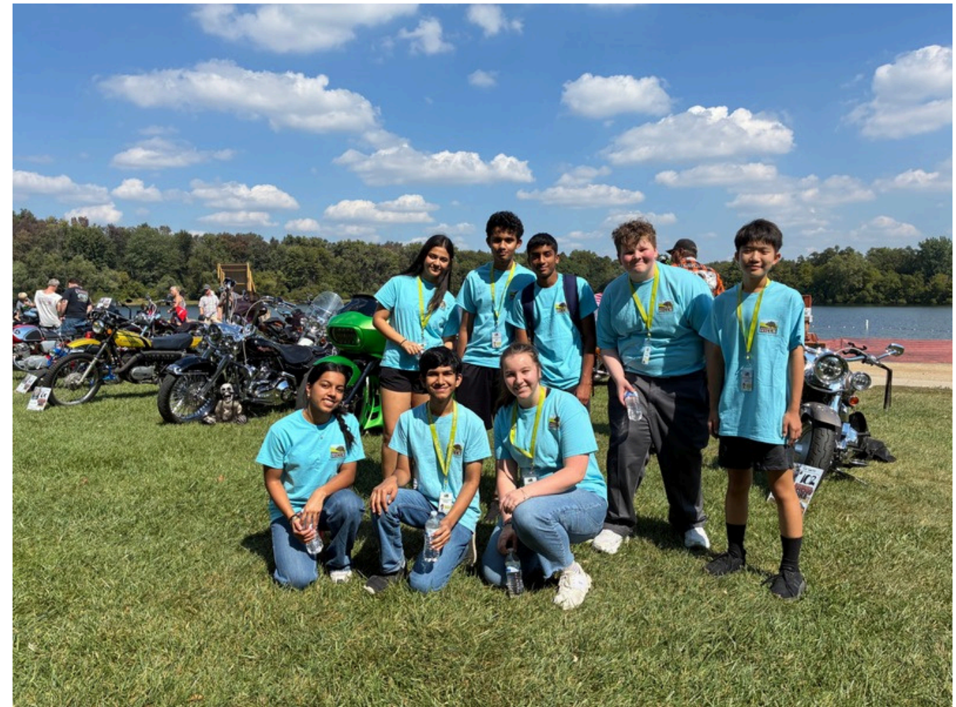
ROCHESTER HILLS BIKE SHOW