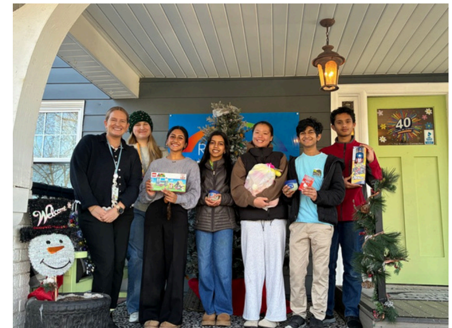
RHGYC CHARITABLE SHOPPING, HOLIDAY MEETING AND GIFT DROP OFF