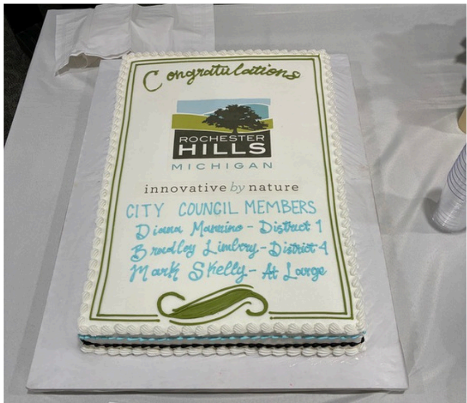
CITY COUNCIL SWEARING-IN CEREMONY