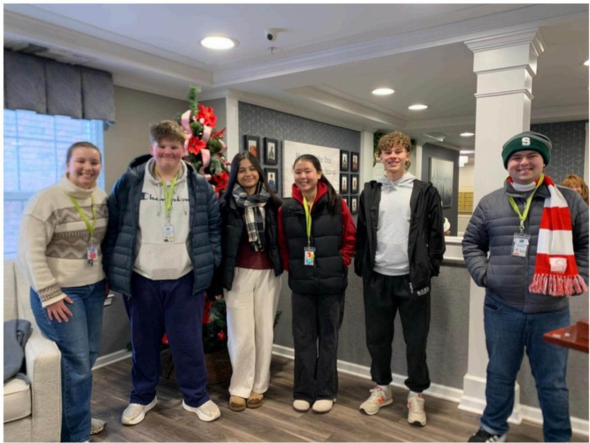
ROCHESTER AREA CHRISTMAS PARADE