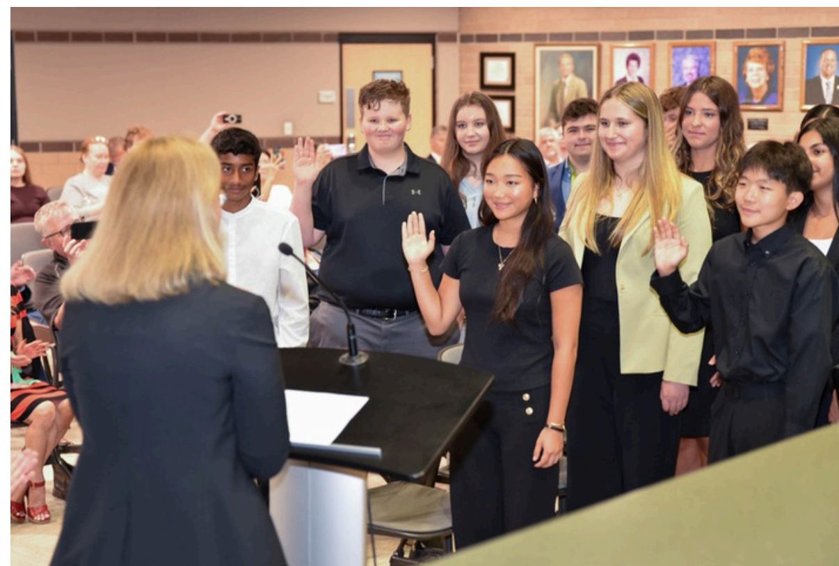
RHGYC SWEARING-IN CEREMONY