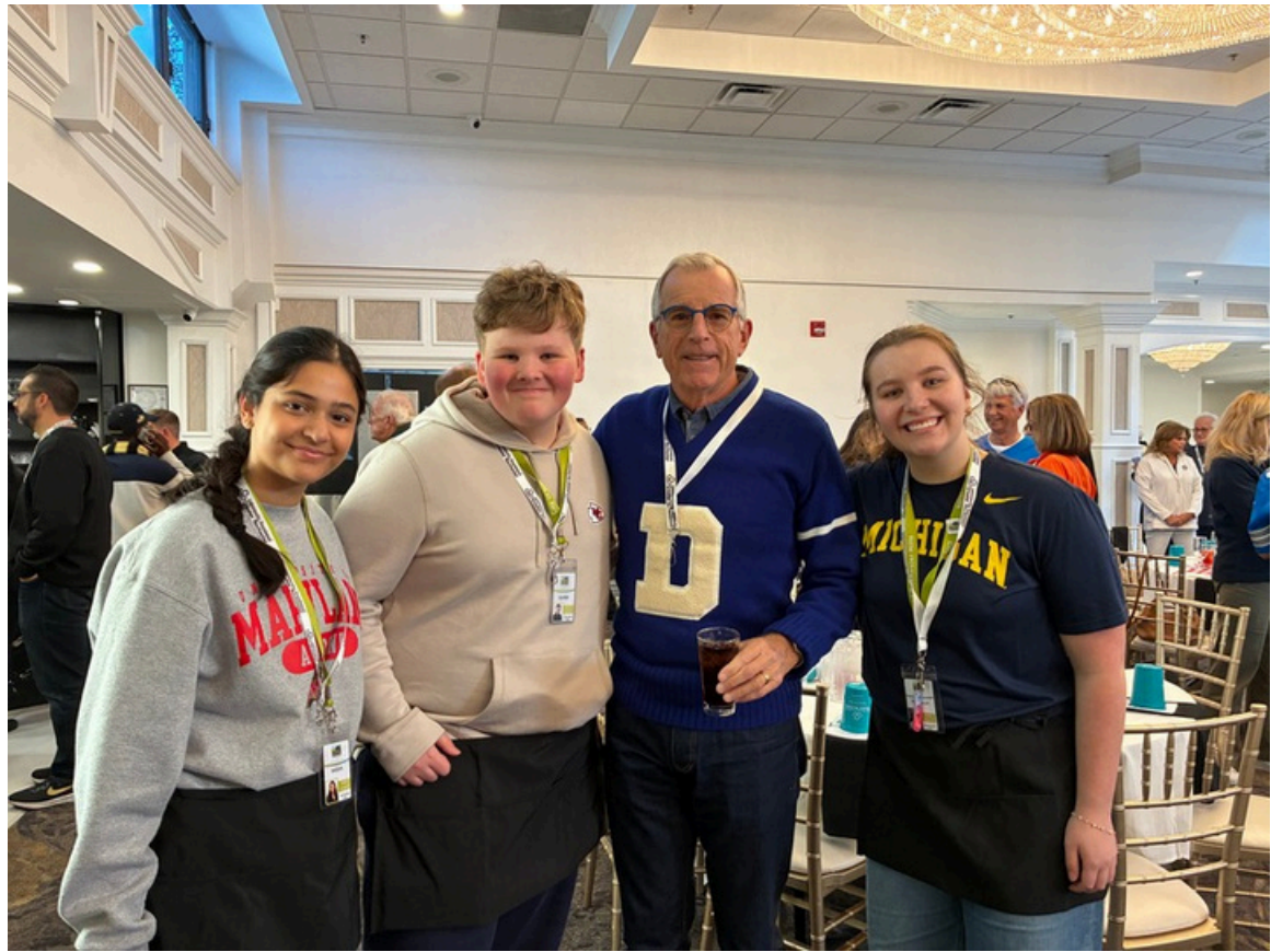
COMMUNITY FOUNDATION TAILGATE