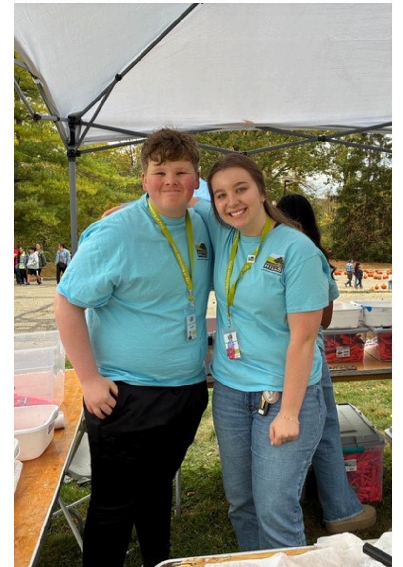
STONEWALL PUMPKIN FEST