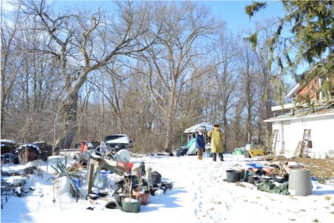
14-Looking west across property between house and barn at pumphouse, January 2021