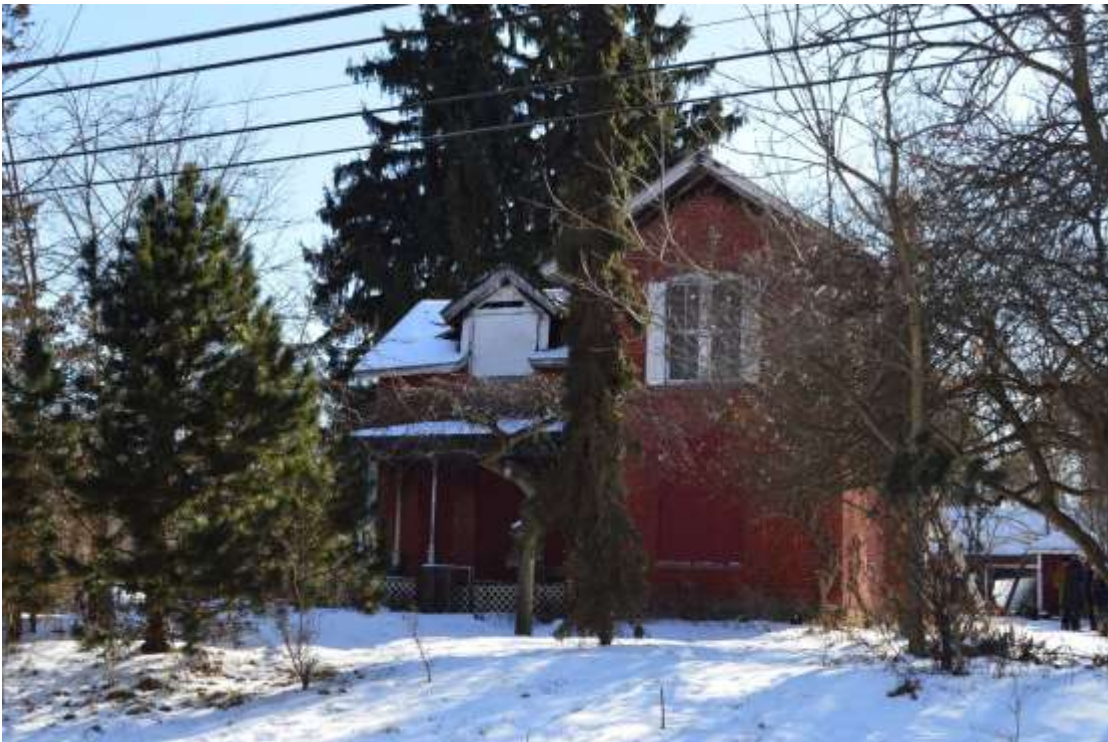
Photo 3 Photo of 1021 Harding, January 2021.

Other than windows and portions of the roof all damaged by fire the district has not lost its original physical characteristics from when it was designated.