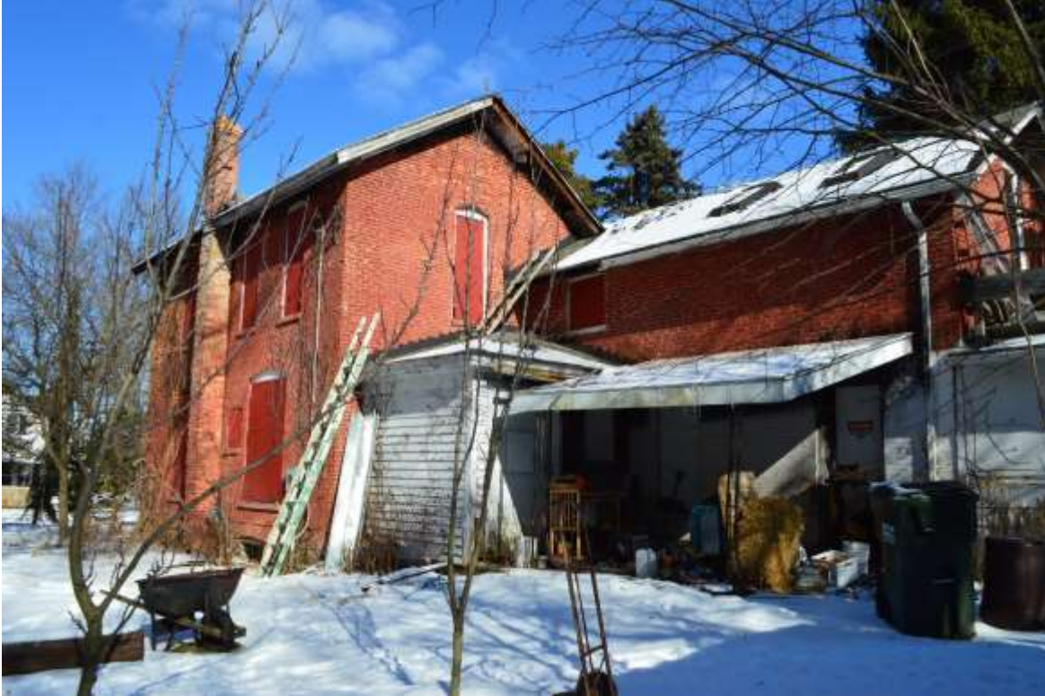
5-Looking northeast at west side and rear of house, January 2021