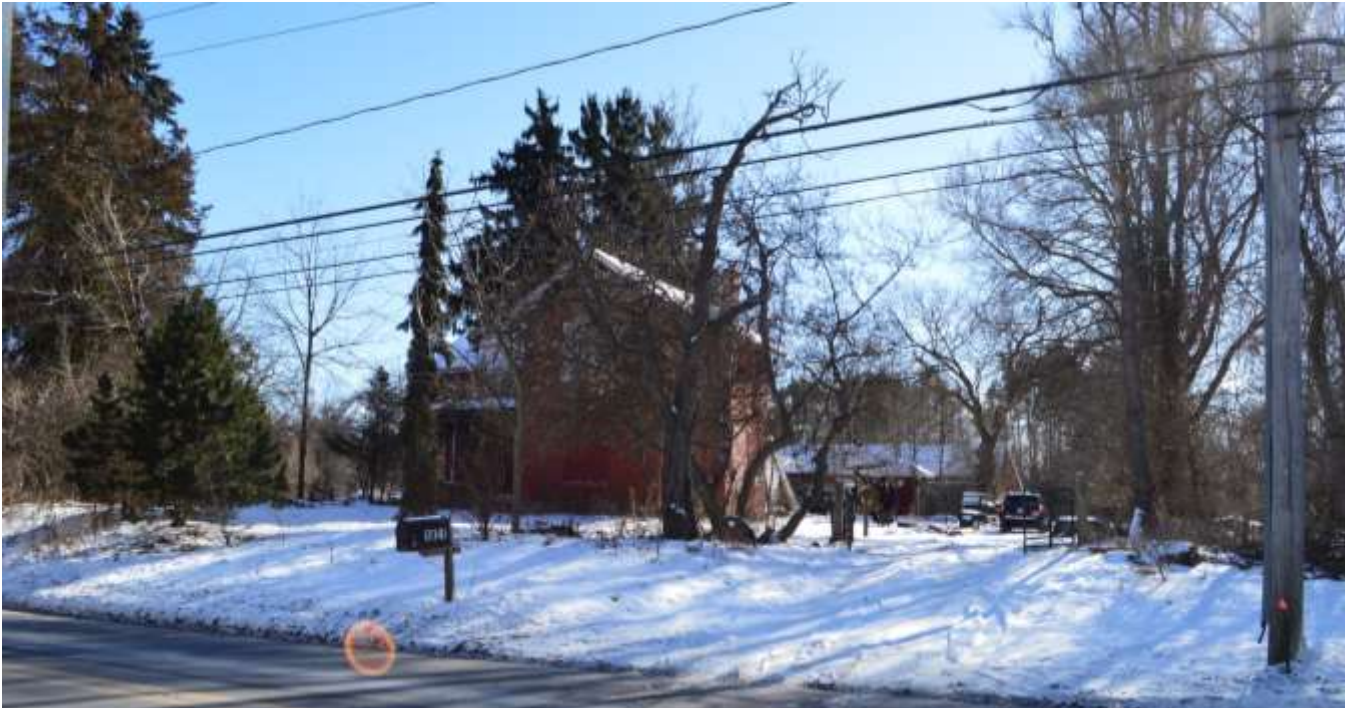
1-Looking south at 1021 Harding Road, January 2021