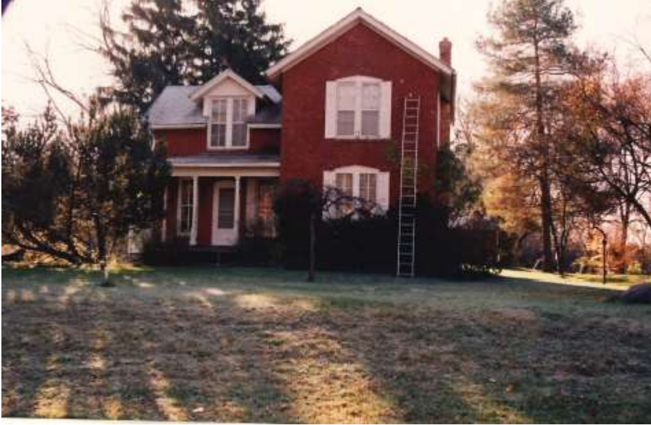
Photo 2 Photo of 1021 Harding from the 1978 Avon Township "Inventory of Historic Properties," Rochester Hills Museum