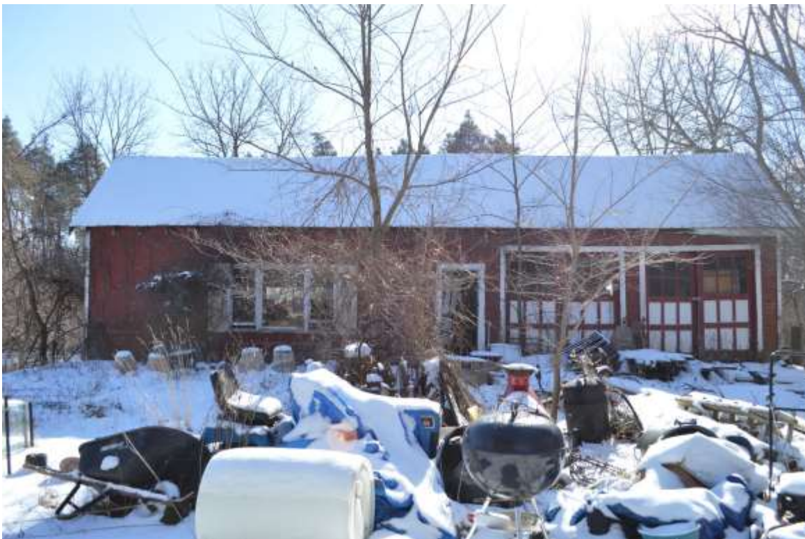
8-Looking south at north elevation of barn, January 2021