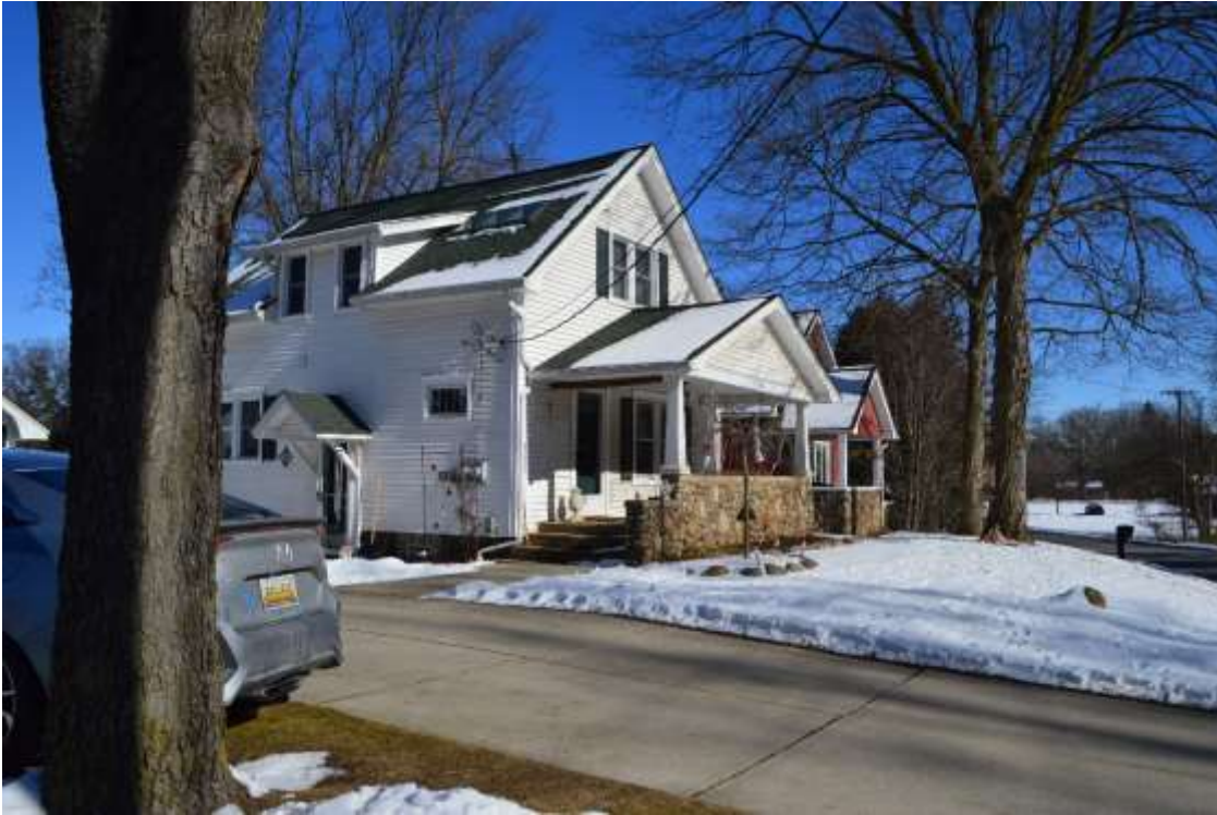
15 – Looking west at houses on north side of Harding Road, January 2021