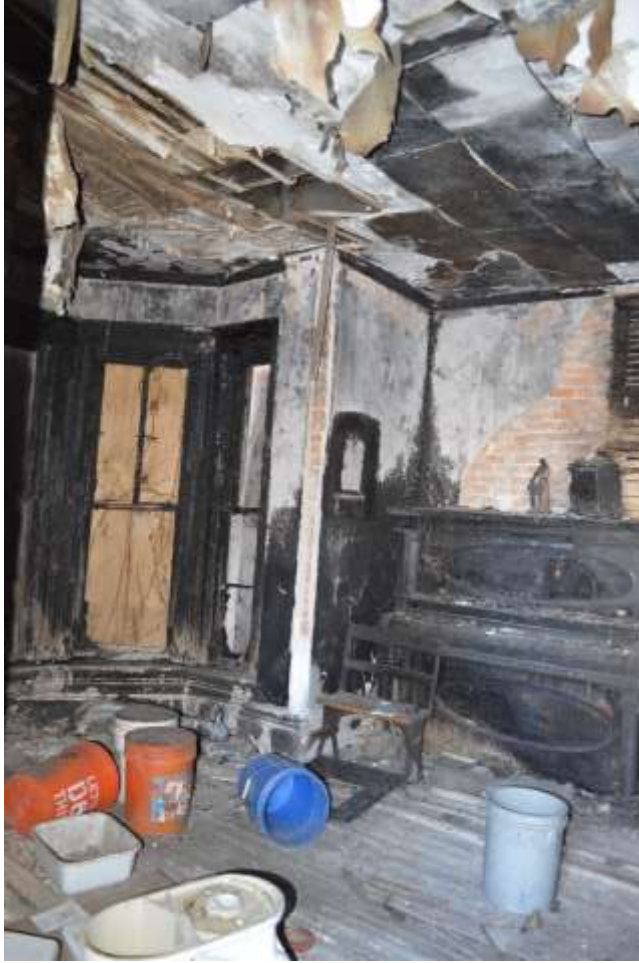
17 – Looking at fire damaged interior, damaged east bay window to left, January 2021