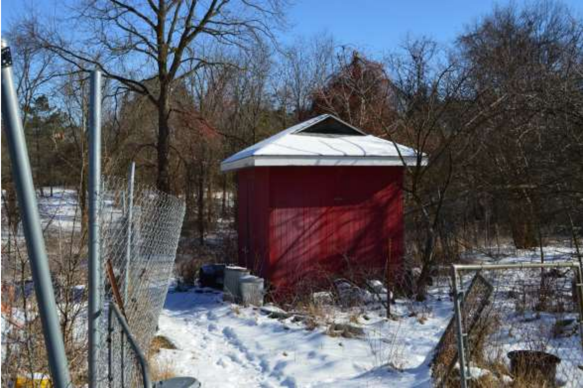
12-Looking east at storage shed, January 2021