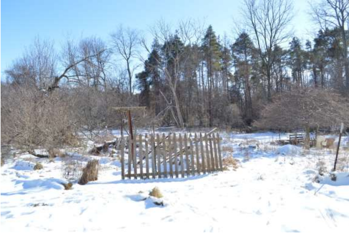
13-Looking southeast at south portion of property and orchard remnants, January 2021