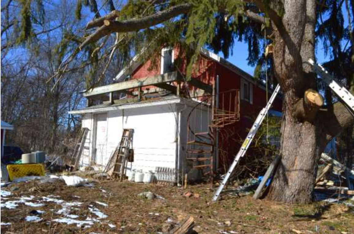
4-Looking northwest at rear of house, January 2021