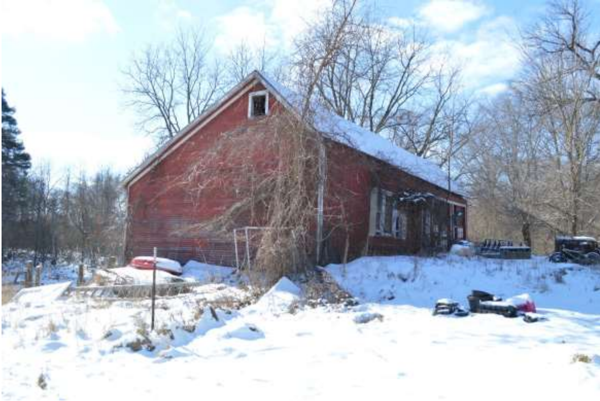
7-Looking southwest at barn north and east elevations, January 2021