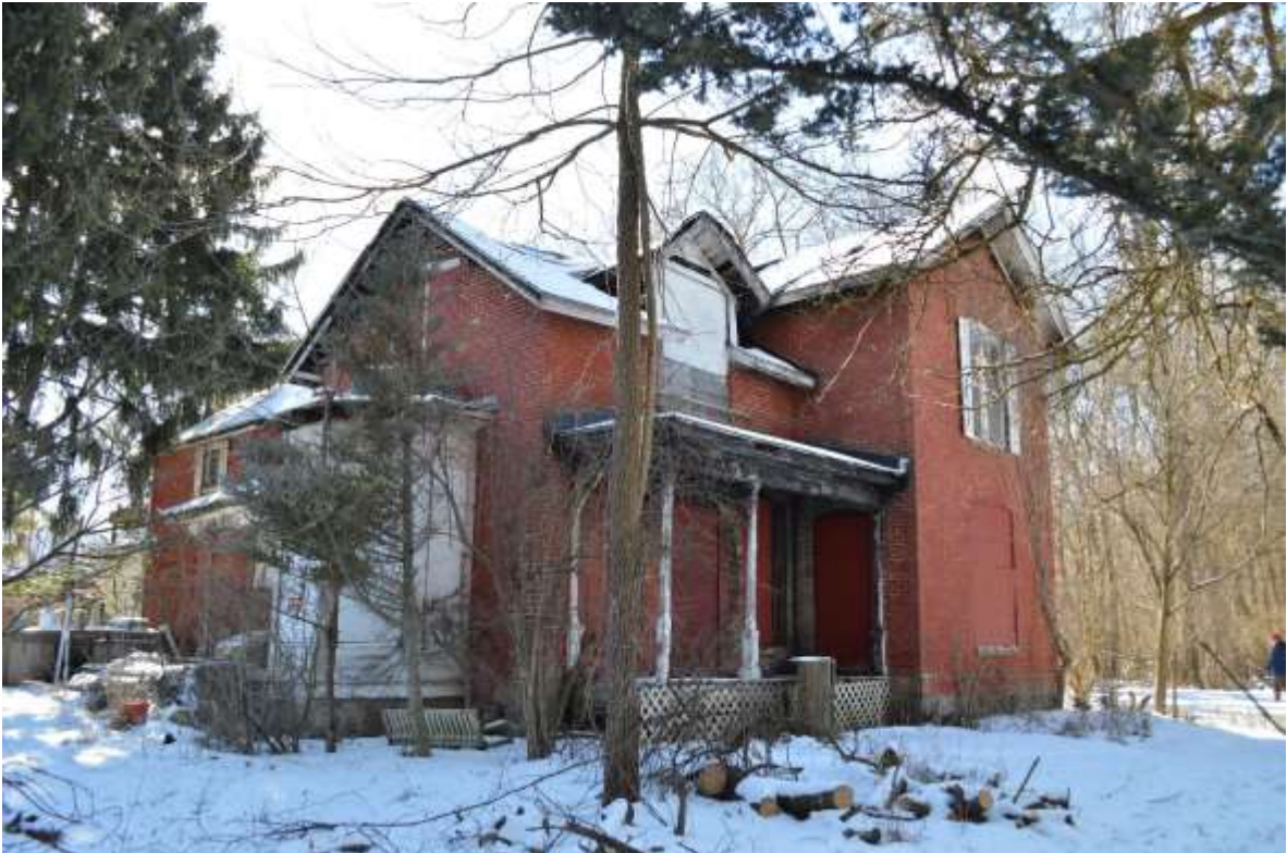
2-Looking southwest at front and east side of house, January 2021