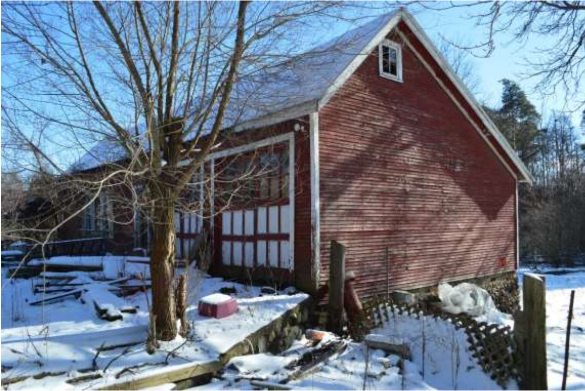
10-Looking southeast at north and west elevations of barn, January 2021