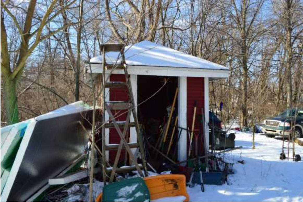
11-Looking west at pumphouse, January 2021