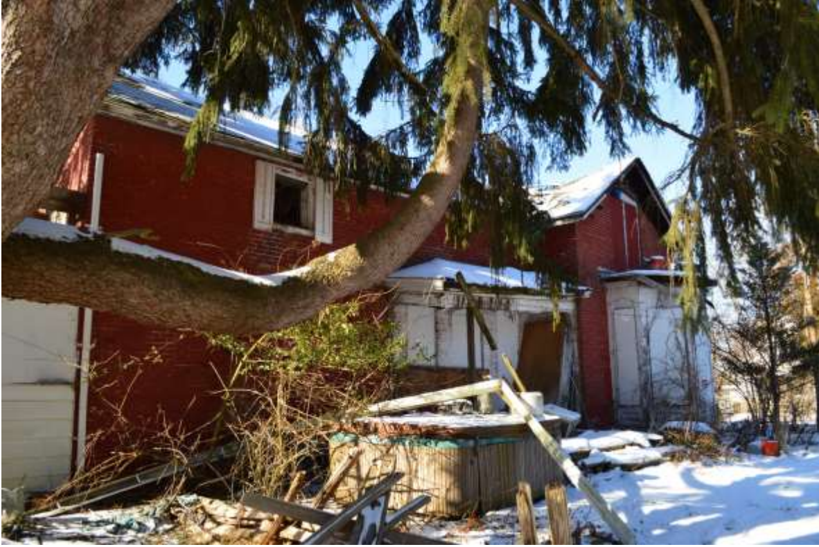
3-Looking northwest at east side of house, January 2021