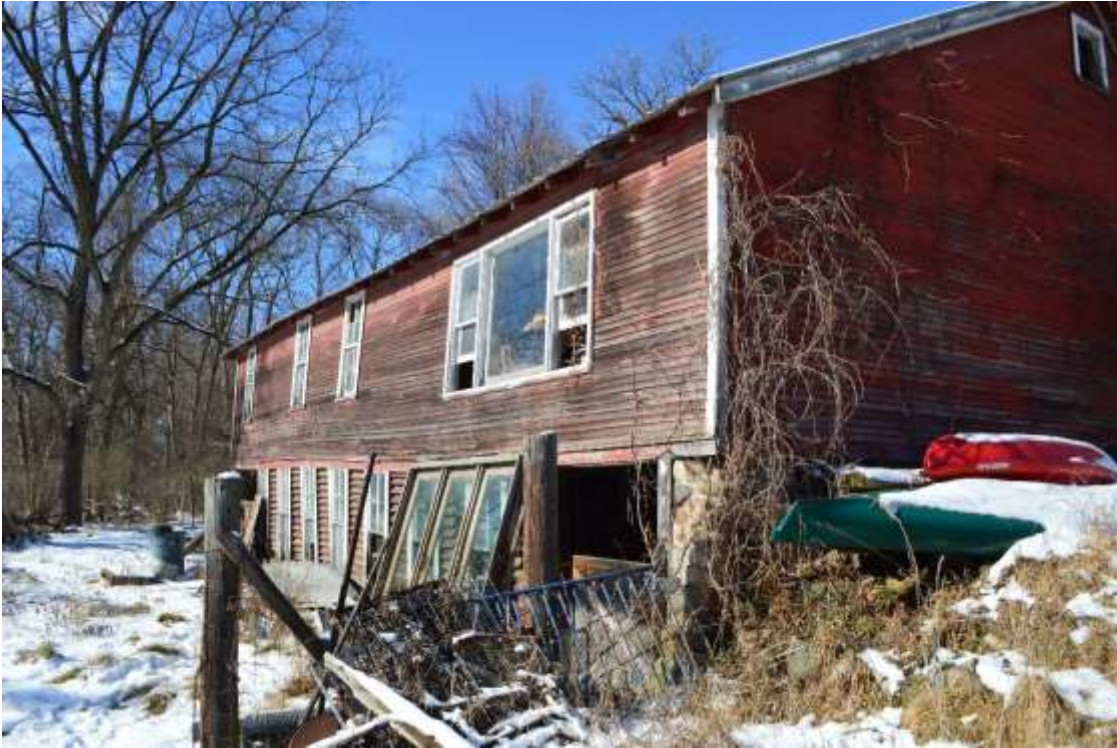
9-Looking northwest at south elevation of barn, January 2021