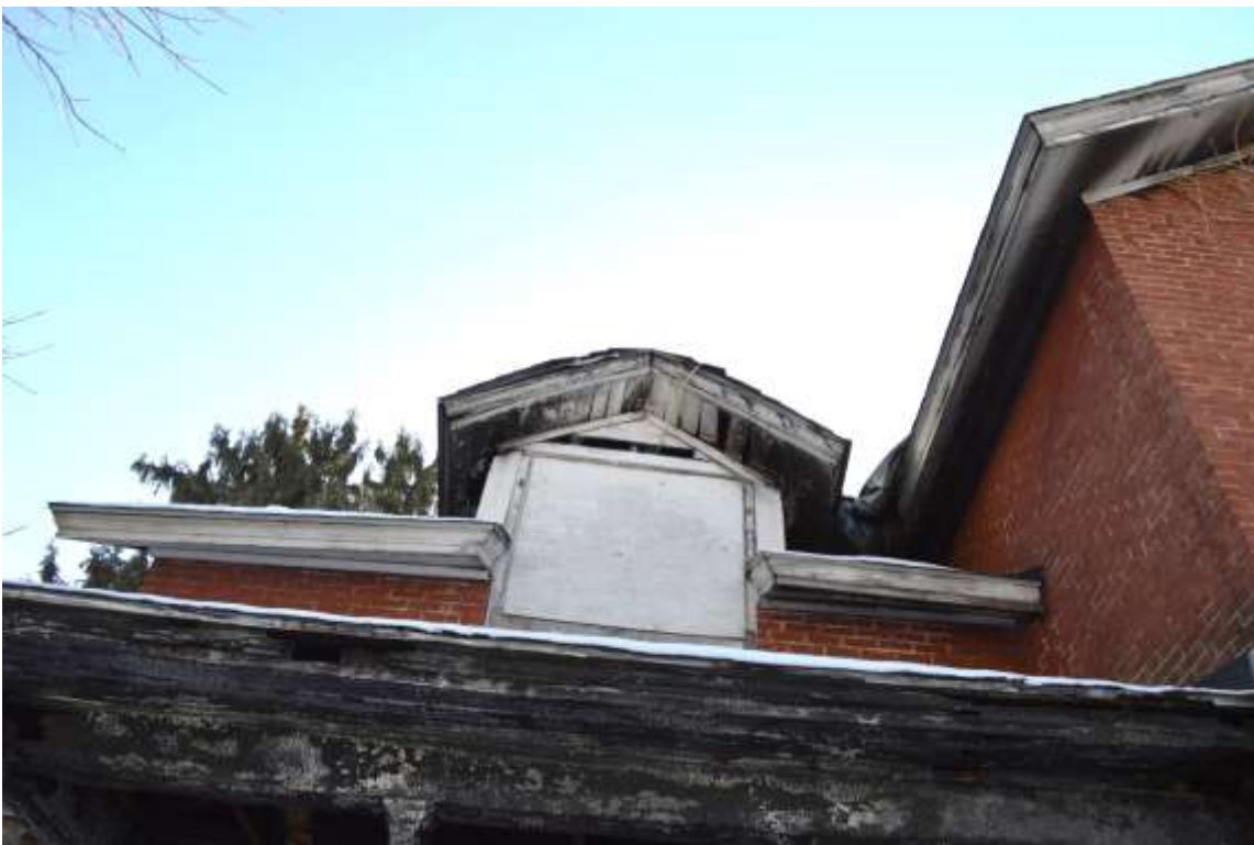
16 – North dormer showing fire damage, January 2021