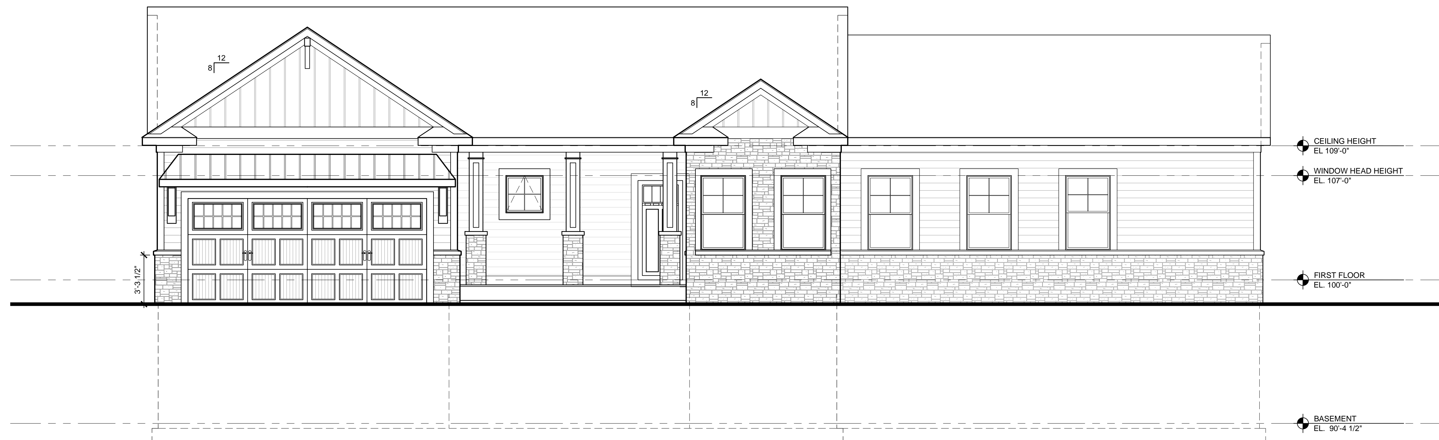
CHELSEA FRONT ELEVATION BASE ELEVATION

Provide color 3D rendering similar to other housing style prior to planning commission meeting.