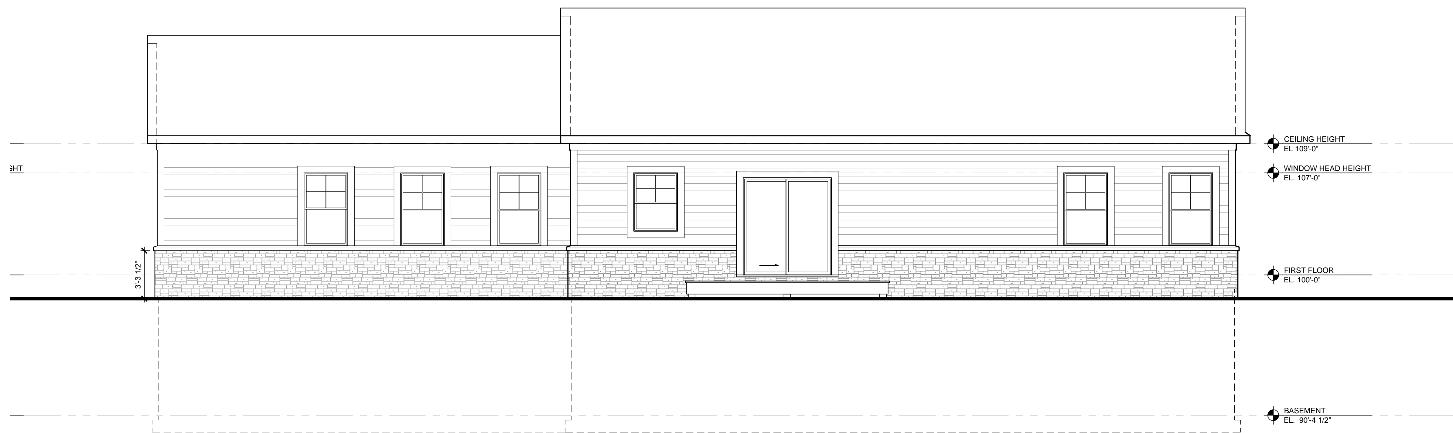
CHELSEA REAR ELEVATION BASE ELEVATION SCALE: 1/4" = 1'-0"