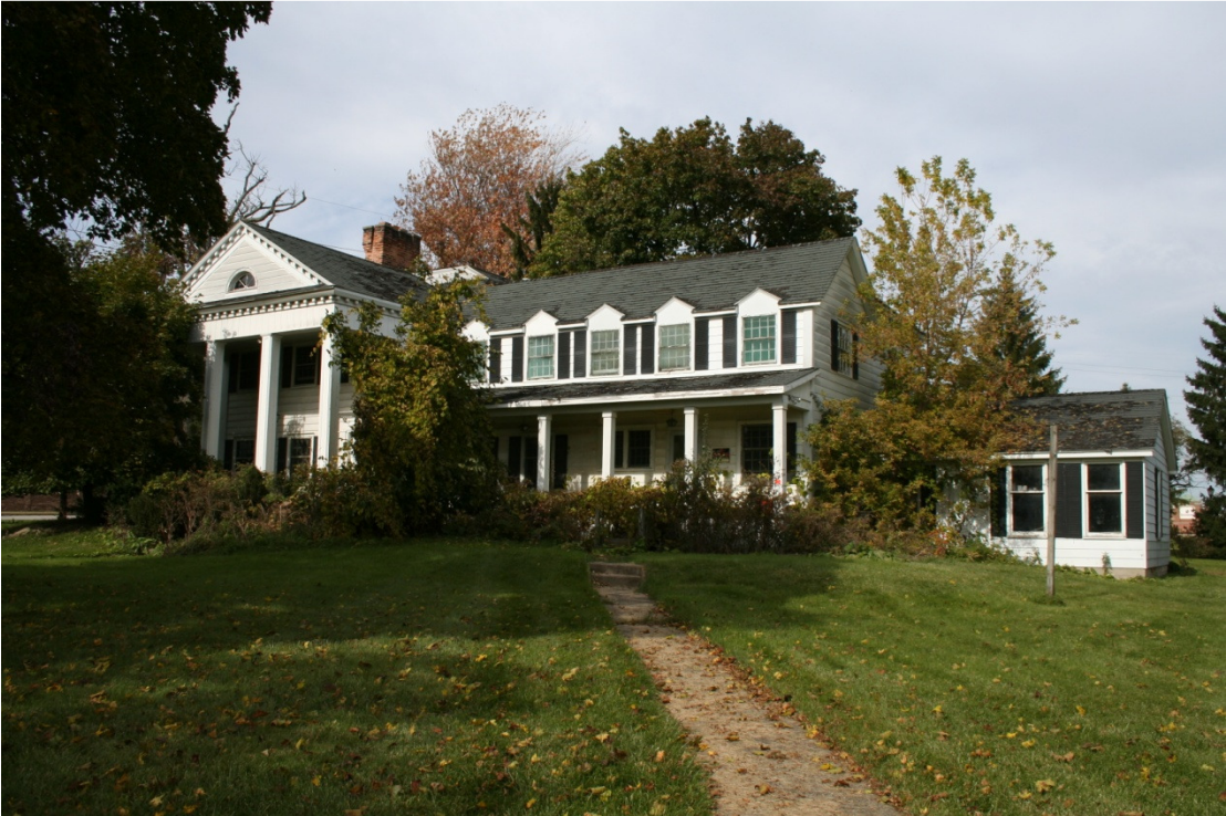
South elevation looking northwest, October, 2009