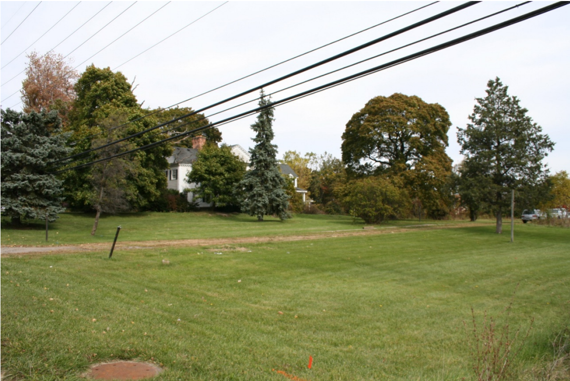
View of 1585 S. Rochester Road from the southwest, looking north, October, 2009