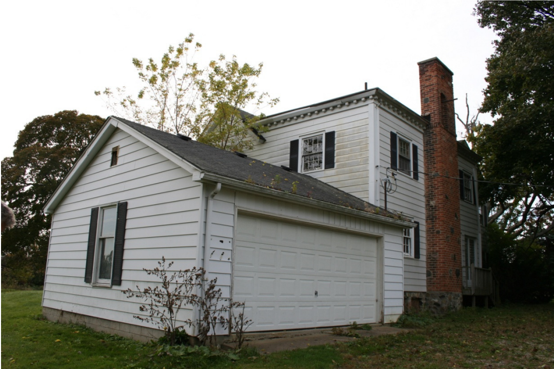
East elevation looking southwest, October, 2009