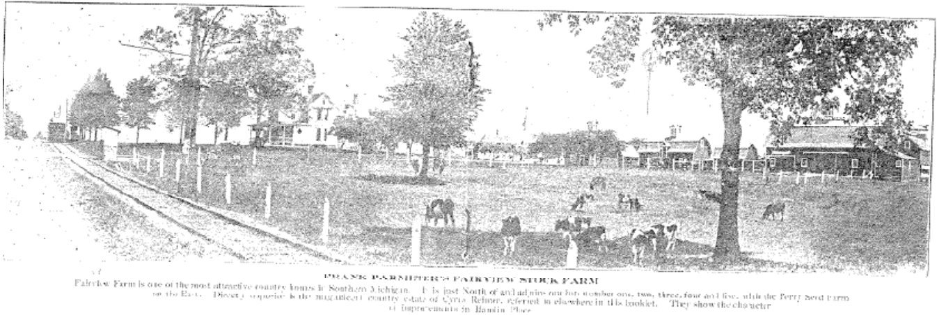
Photo 1 Illustration from Hamlin Place Subdivision Advertisement, courtesy of Rochester Hills Museum.

Crout continued to purchase adjacent acreage and in 1914 his estate sold 103.56 acres to Frank Parmenter. An advertisement for the Hamlin Place Subdivision identifies “Frank Parmeter’s (sic) Fairview Farm.” The photograph shows the house in the Queen Anne form, with a porch and entrance facing Rochester Road. The south elevation contains a side gable and two-story bay window in about the same location as the current front porch which has a brick foundation. The photograph shows numerous outbuildings, including barns and a shelter along the interurban railroad that ran in front of the property on Rochester Road.