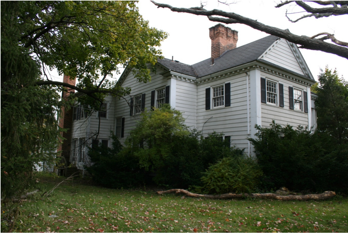
North and west elevations looking southeast, October, 2009