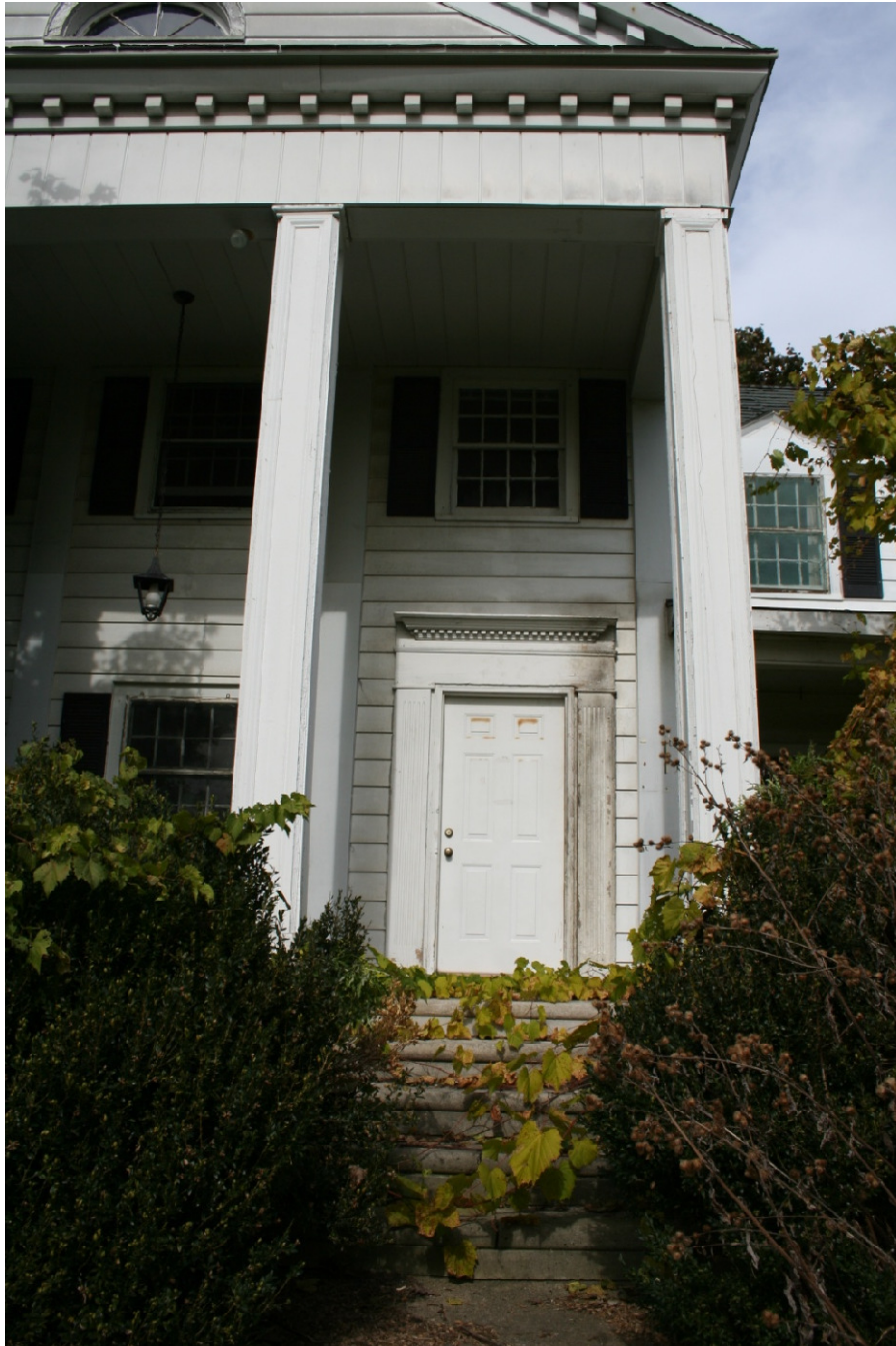
Detail of main entrance looking north, note non-proportional columns and door surround, October, 2009