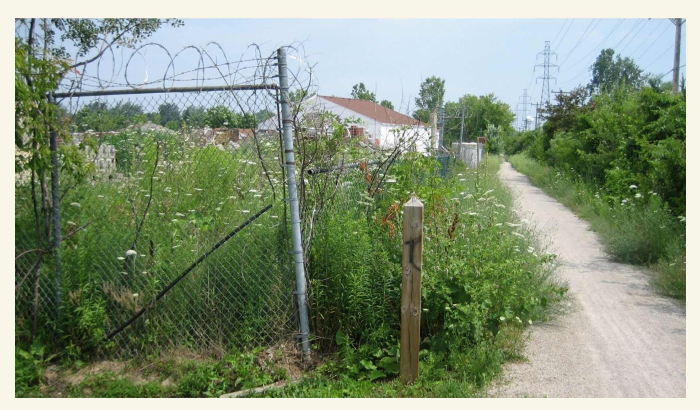
The current "gateway" to the trail in Sylvan Lake