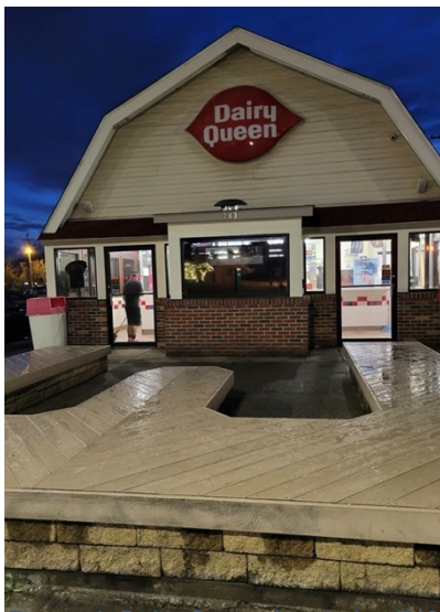
Figure 4: Dairy Queen located at 743 N Main St. Approximately 5.5 miles from proposed Biggy Coffee. While this location is in the city of Rochester, not Rochester Hills the proximity speaks to the compatibility with the general vicinity and community.