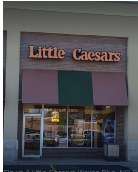
Figure 8 Little Caesars Walton Blvd. NO Dine-in