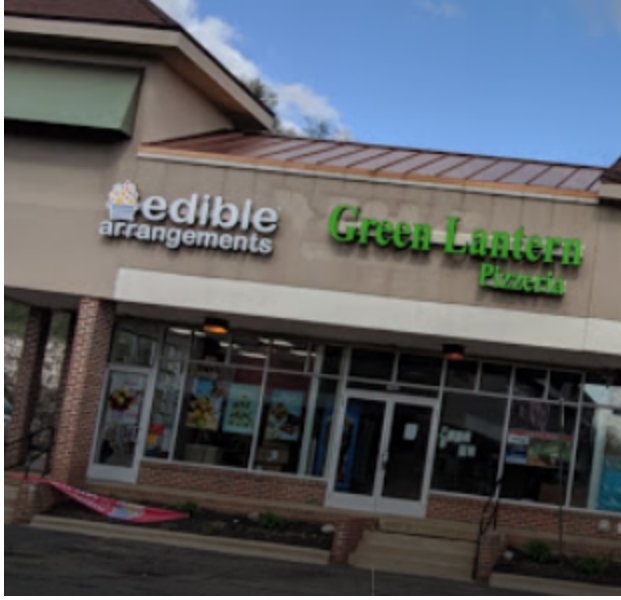
Figure 5 Green Lantern Pizza, Walton Blvd. NO dine-in