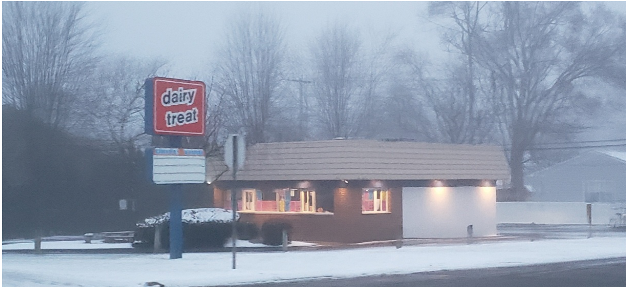
Figure 1: Dairy Treat located at 1380 W Auburn Rd. Approximately 1.5 miles from proposed Biggby Coffee.

See following example photos for reference.