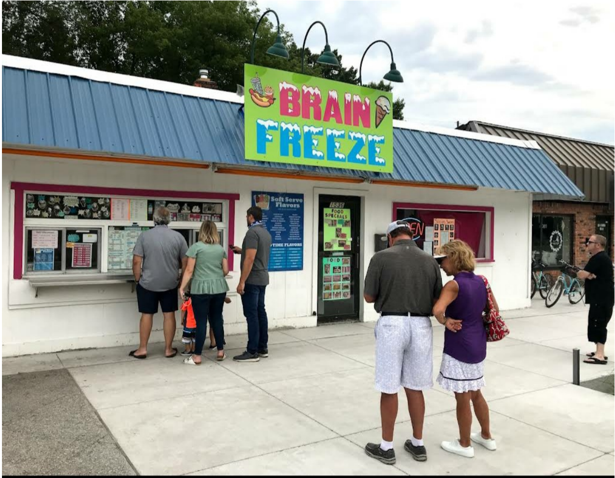
Figure 3: Brain Freeze located at 15336 E Auburn Rd. One mile from proposed Biggy Coffee.