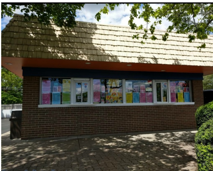
Figure 2. Dairy Treat