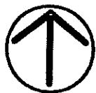
EXHIBIT 'A' PERMANENT EASEMENT FOR STORM SEWER