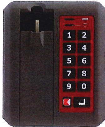
KeyDefender Mechanical Key