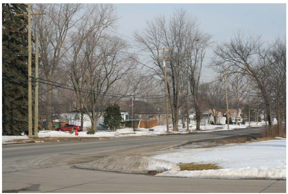
Figure 8 - North side of South Blvd. to east of 920, K. Kidorf, February, 2007.