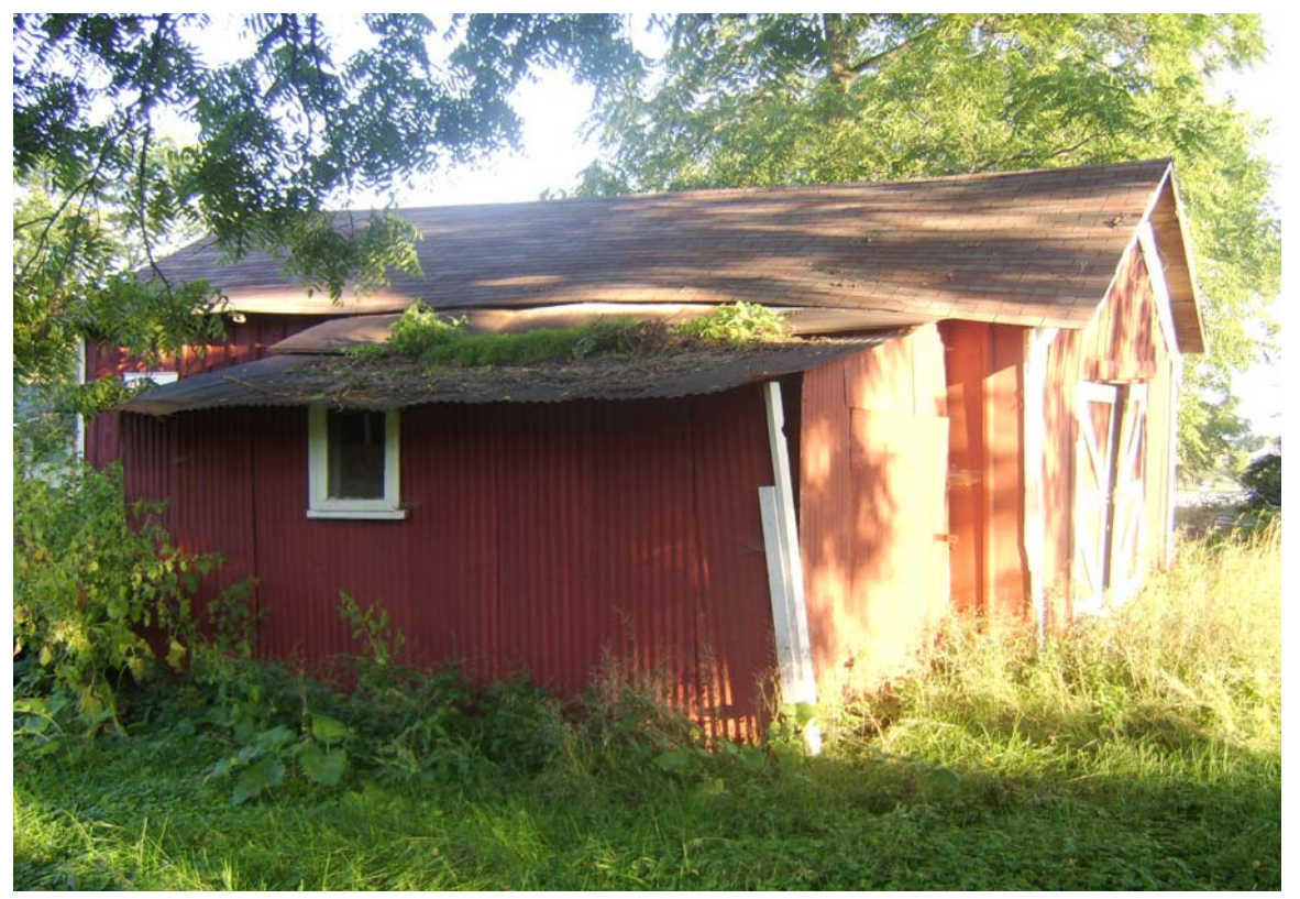
Figure 5 - View of shed from north, J. Dzuirman, 2006.