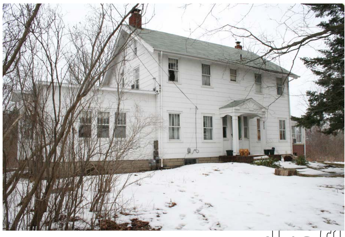
Figure 2 - View from southwest. K. Kidorf, February, 2007