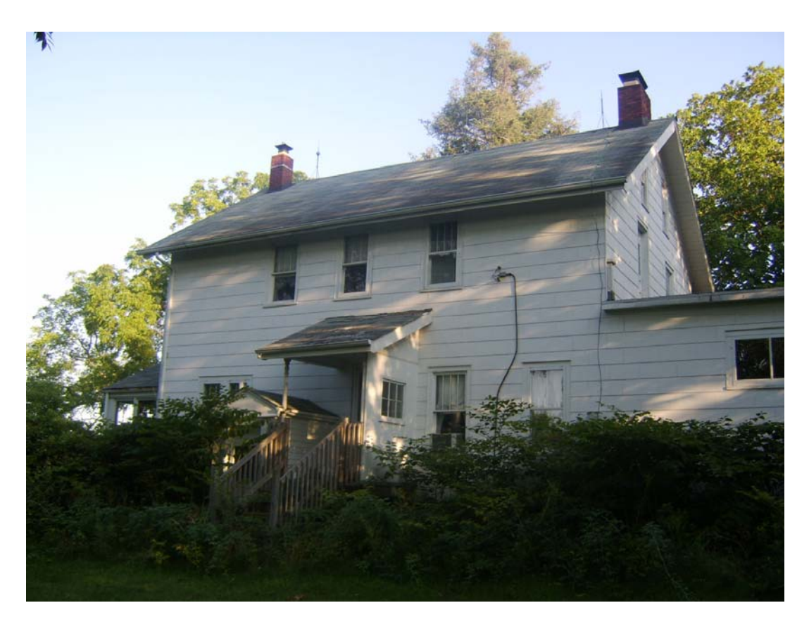
Figure 3 - View of rear from northwest. J. Dzuirman, 2006.