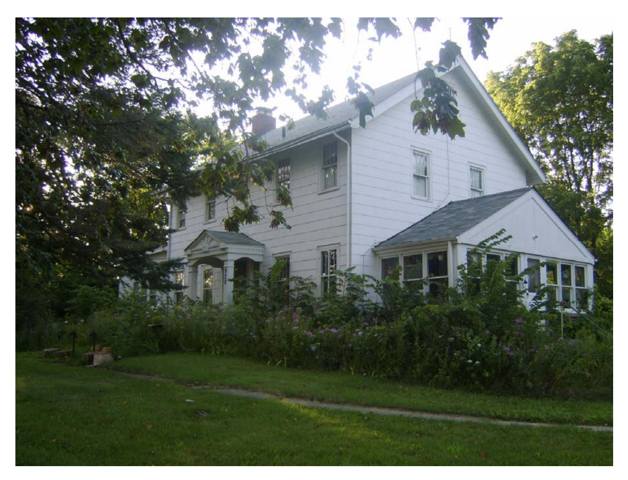
Figure 1 - View of front from southeast. J. Dzuirman, 2006.