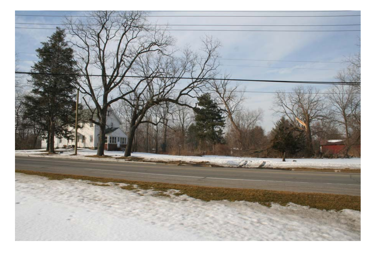
Figure 7 - View of entire property from southeast, K. Kidorf, February, 2007.