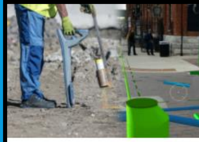
Utility Viewer by CoRH_dps