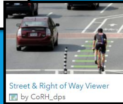
Street & Right of Way Viewer by CoRH_dps