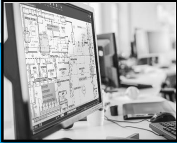
Electronic Plan Review