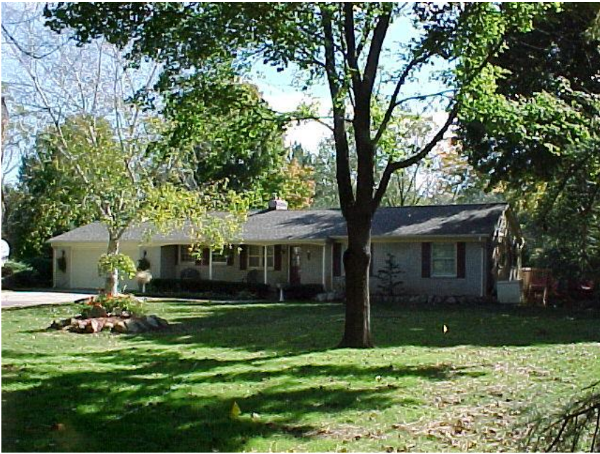
City Assessor photo, unknown date