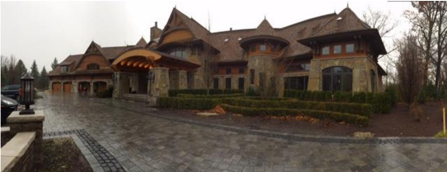
City Assessor photo, unknown date