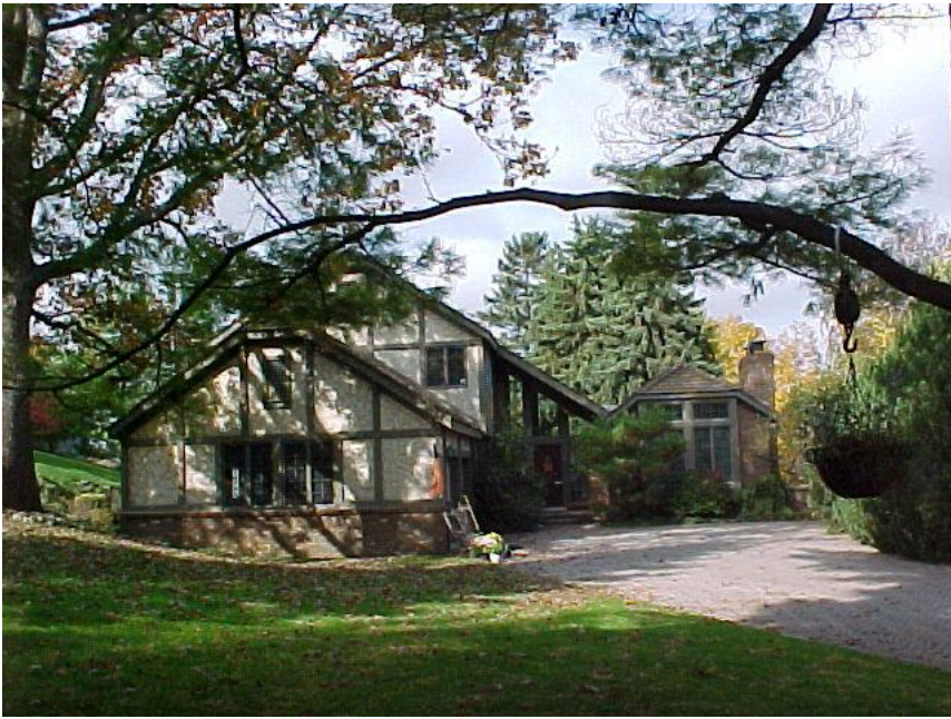
City Assessor photo, unknown date