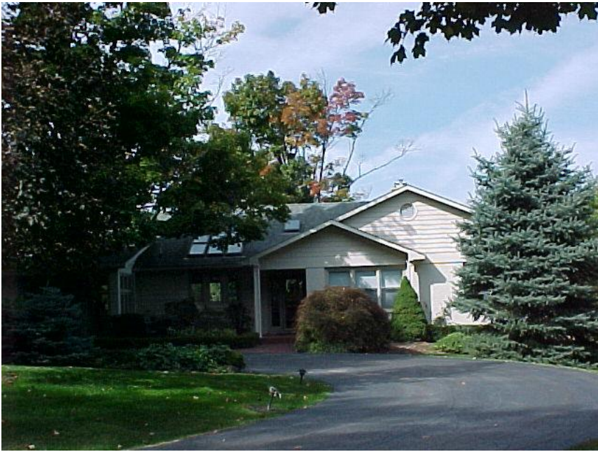
unknown date