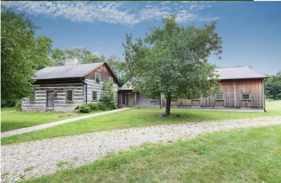
Assessor photos, unknown dates