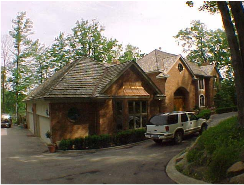
City Assessor photo, unknown date