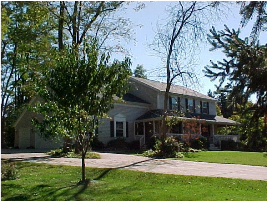
City Assessor photo, unknown date