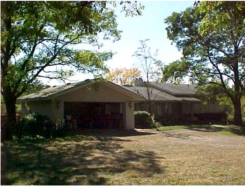
unknown date