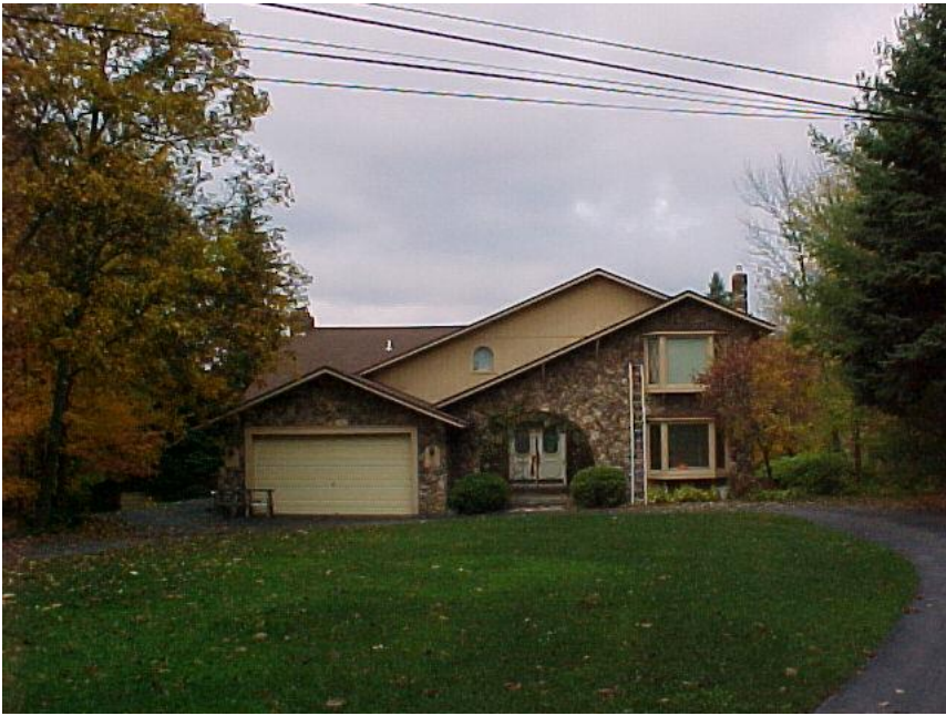
unknown date