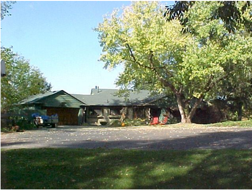
unknown date