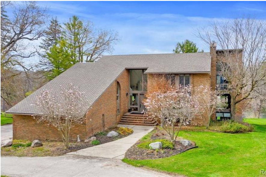
unknown date