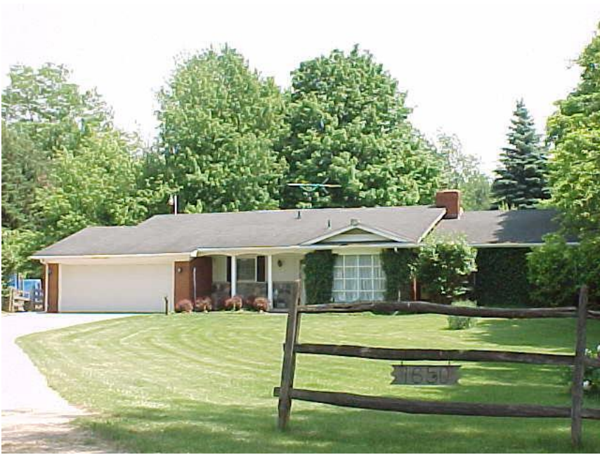
City Assessor photo, unknown date