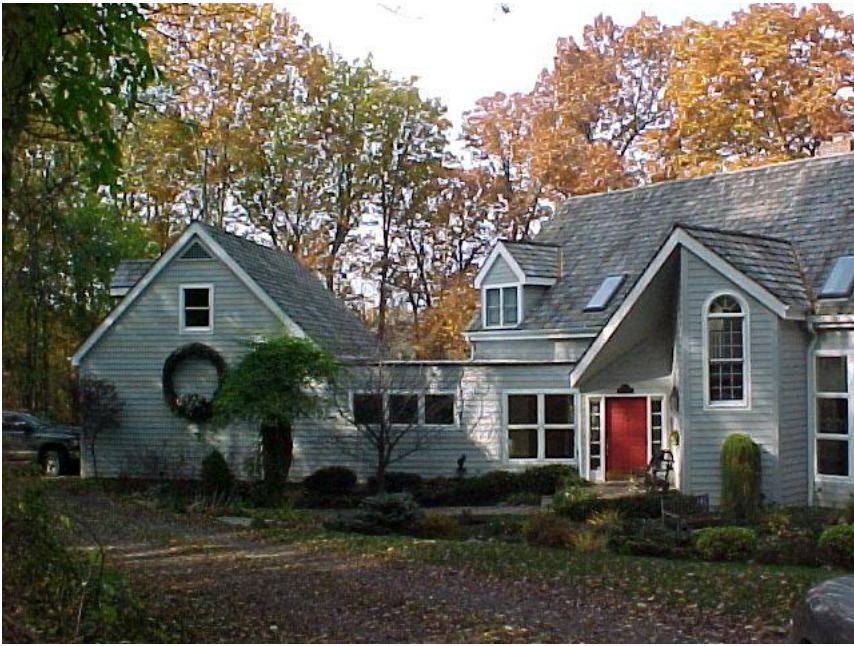
City Assessor photo, unknown date