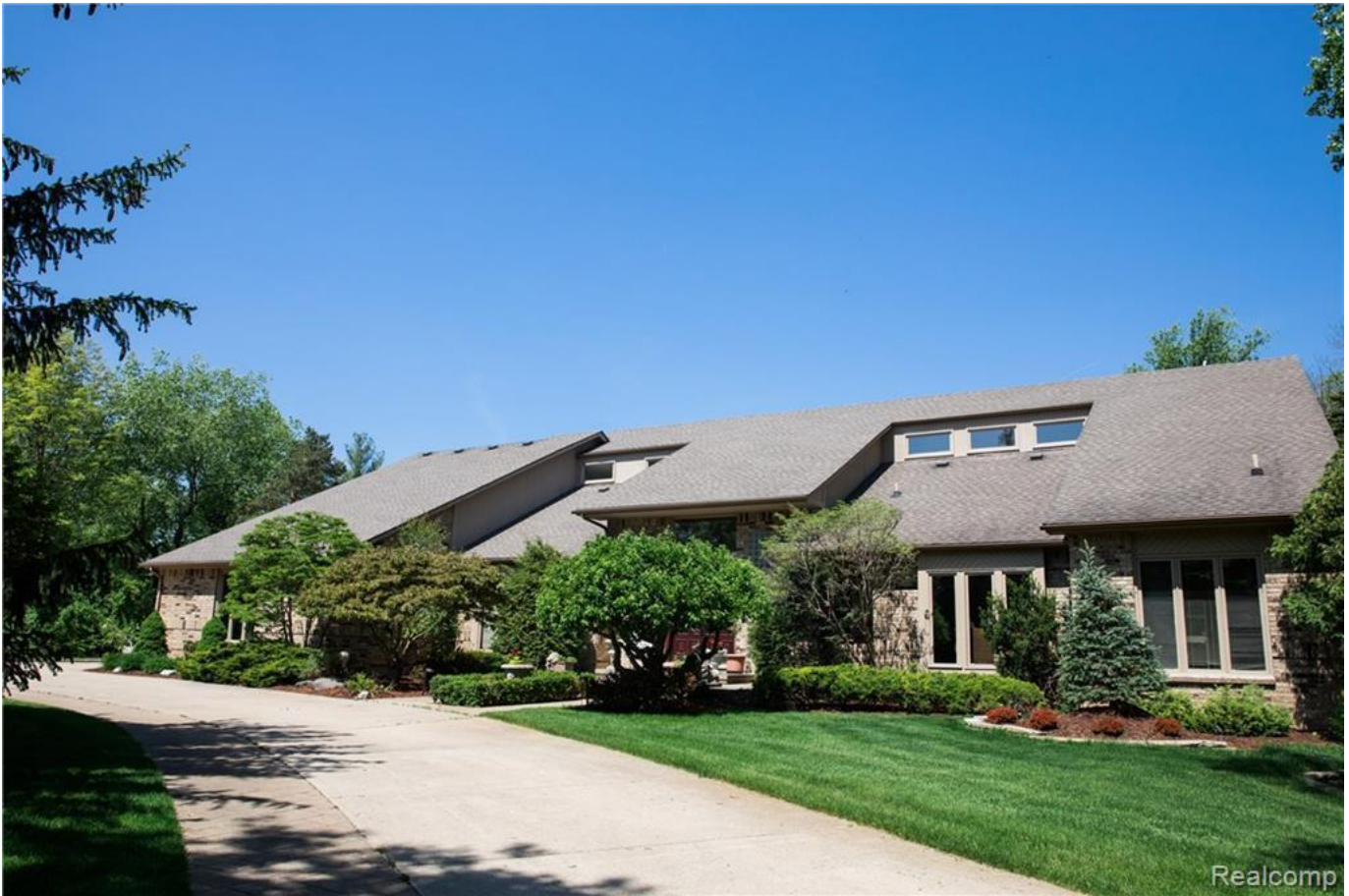
unknown date