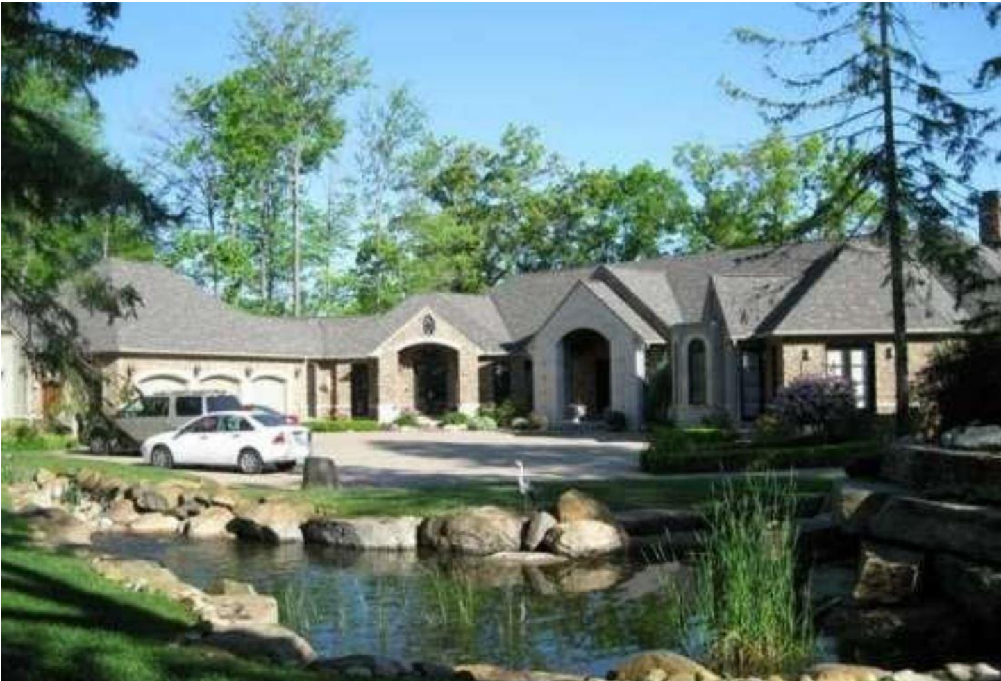
unknown date