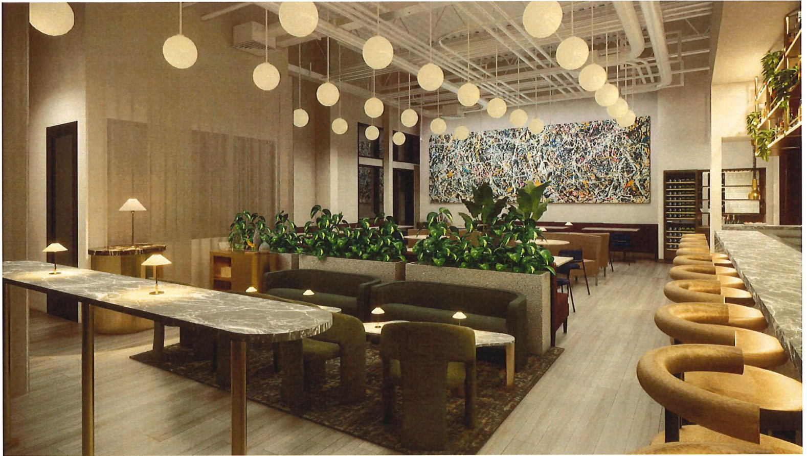
LOUNGE VIEW 2 - EVENING