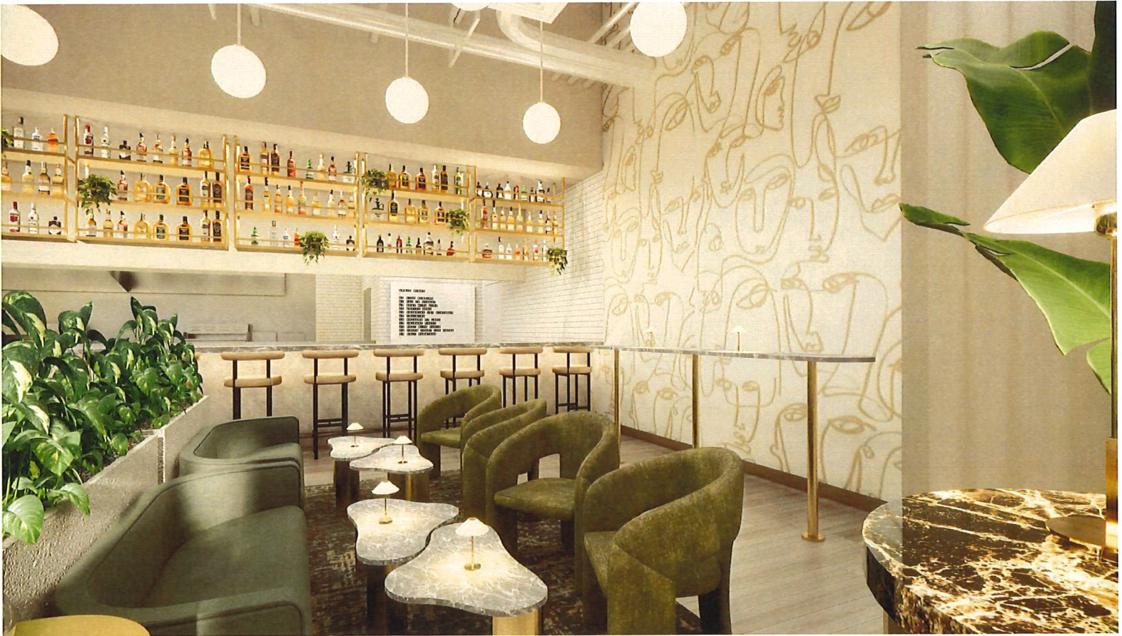
LOUNGE VIEW 1 - DAYLIGHT