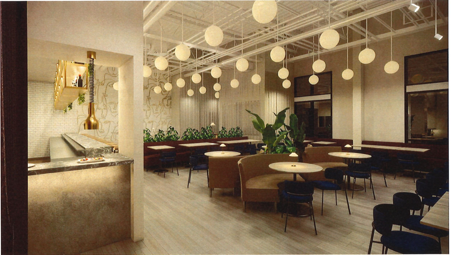
DINING VIEW 2 - EVENING