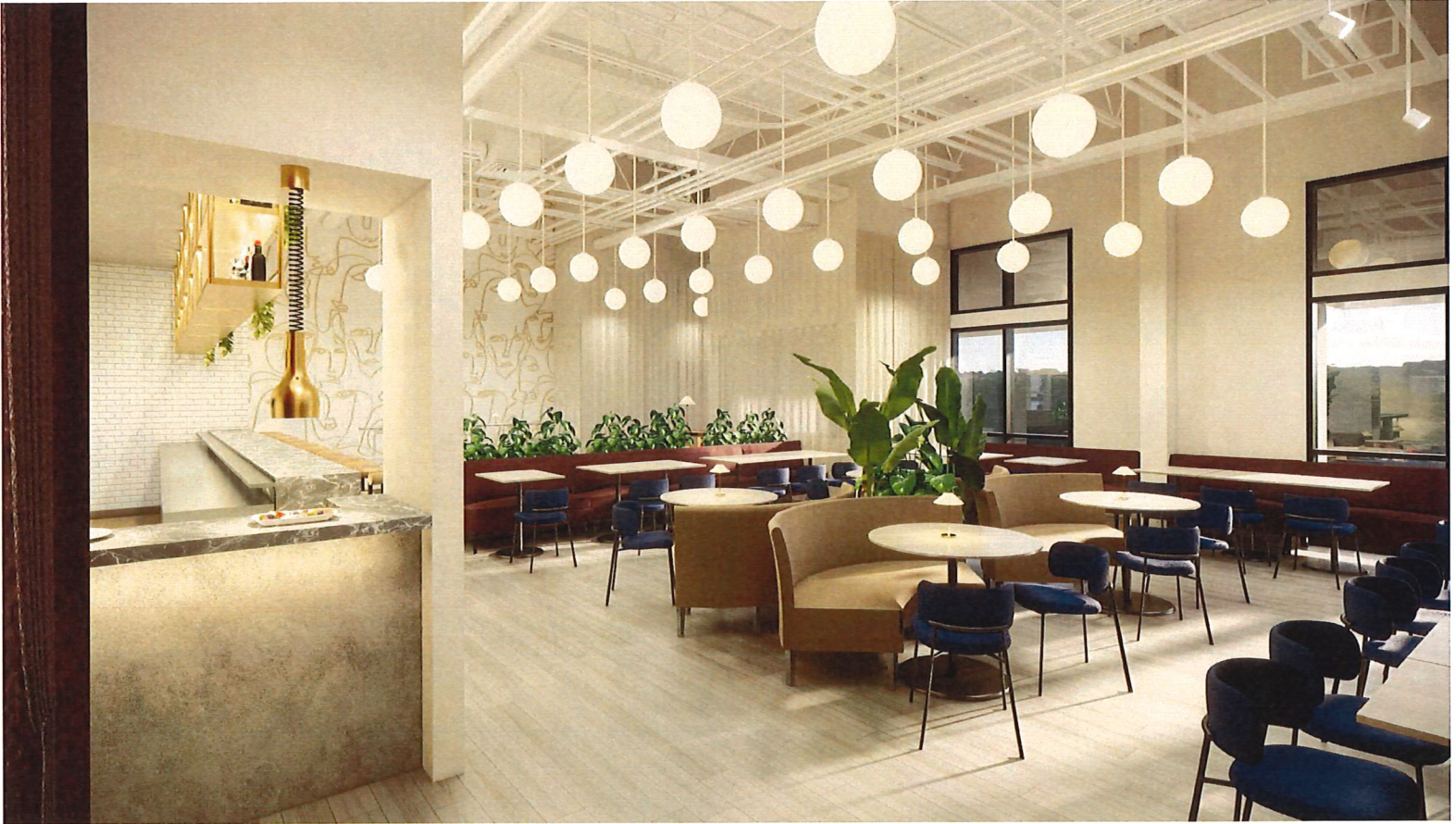
DINING VIEW 2 - DAYLIGHT