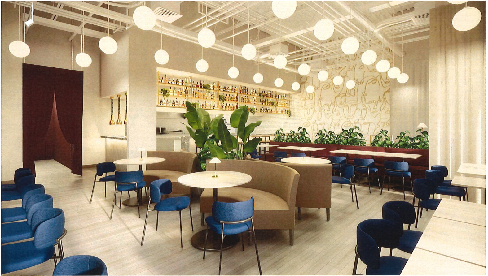
DINING VIEW 1 - DAYLIGHT