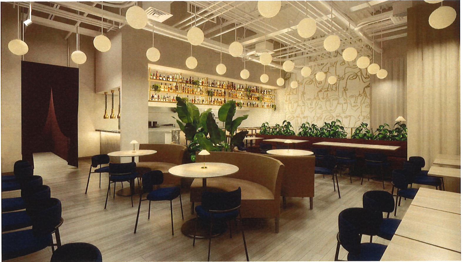
DINING VIEW 1 - EVENING