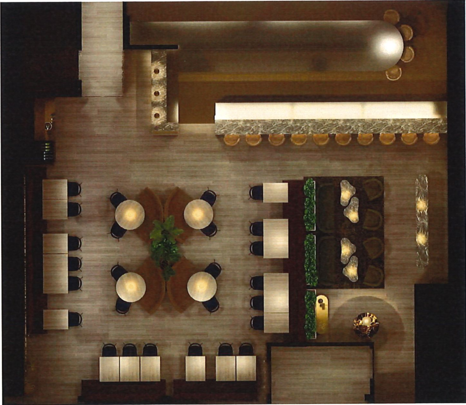
PLAN VIEW- 8 LOUNGE (SEATING) ~10 LOUNGE (STANDING), 14 BAR, 52 DINING