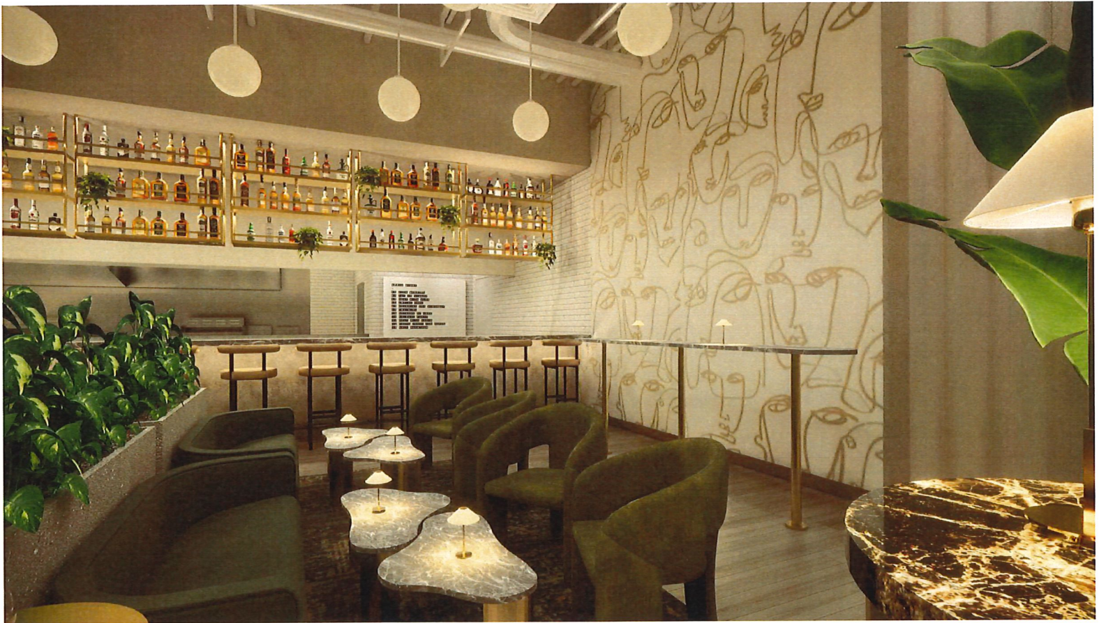
LOUNGE VIEW 1 - EVENING