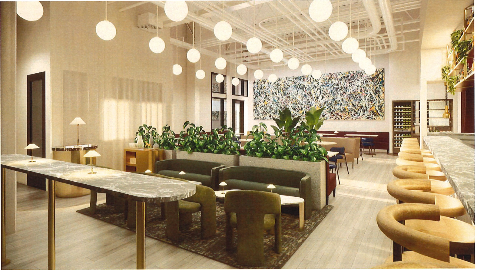
LOUNGE VIEW 2 - DAYLIGHT