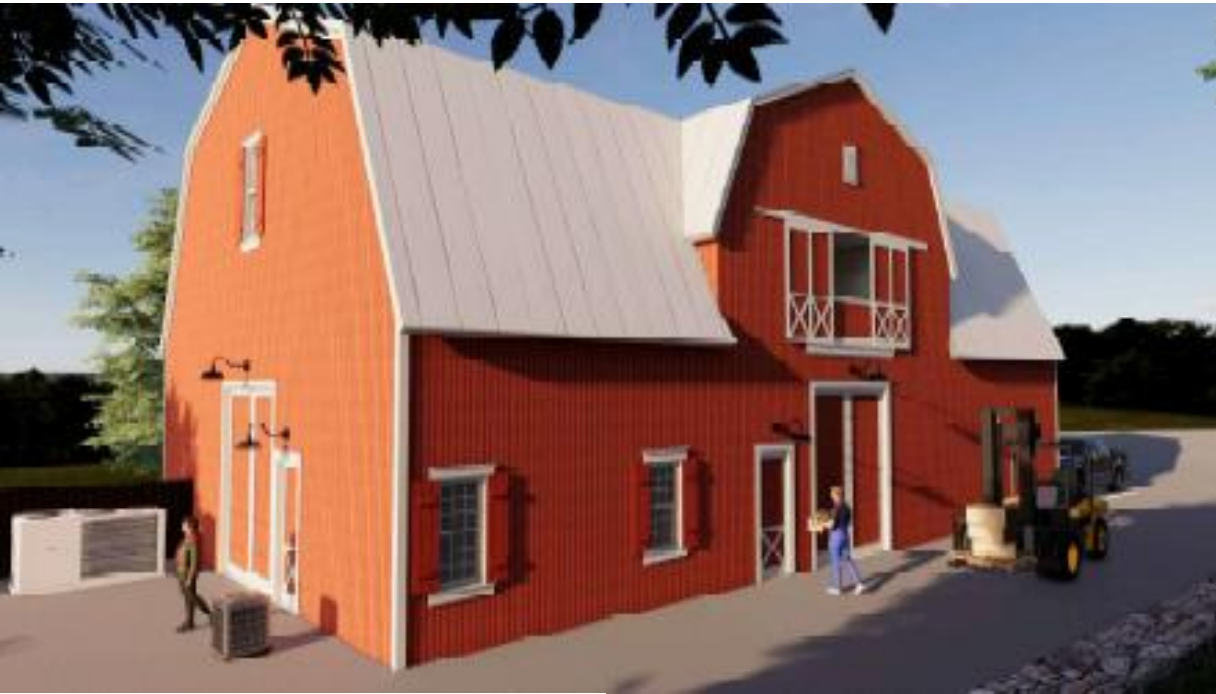
Elevation looking northwest