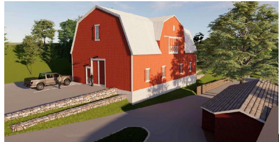
Elevation looking southeast