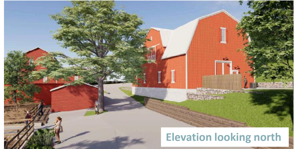
Elevation looking north