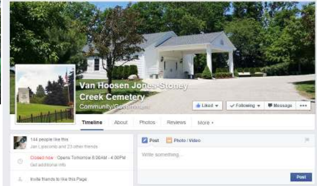
Created a Facebook Account