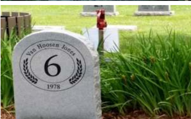
Granite Section Markers Installed