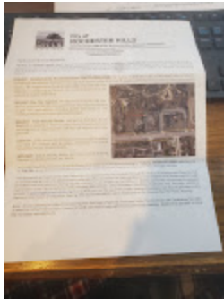
Letter about 1590 Walton Rd.jpg 495K