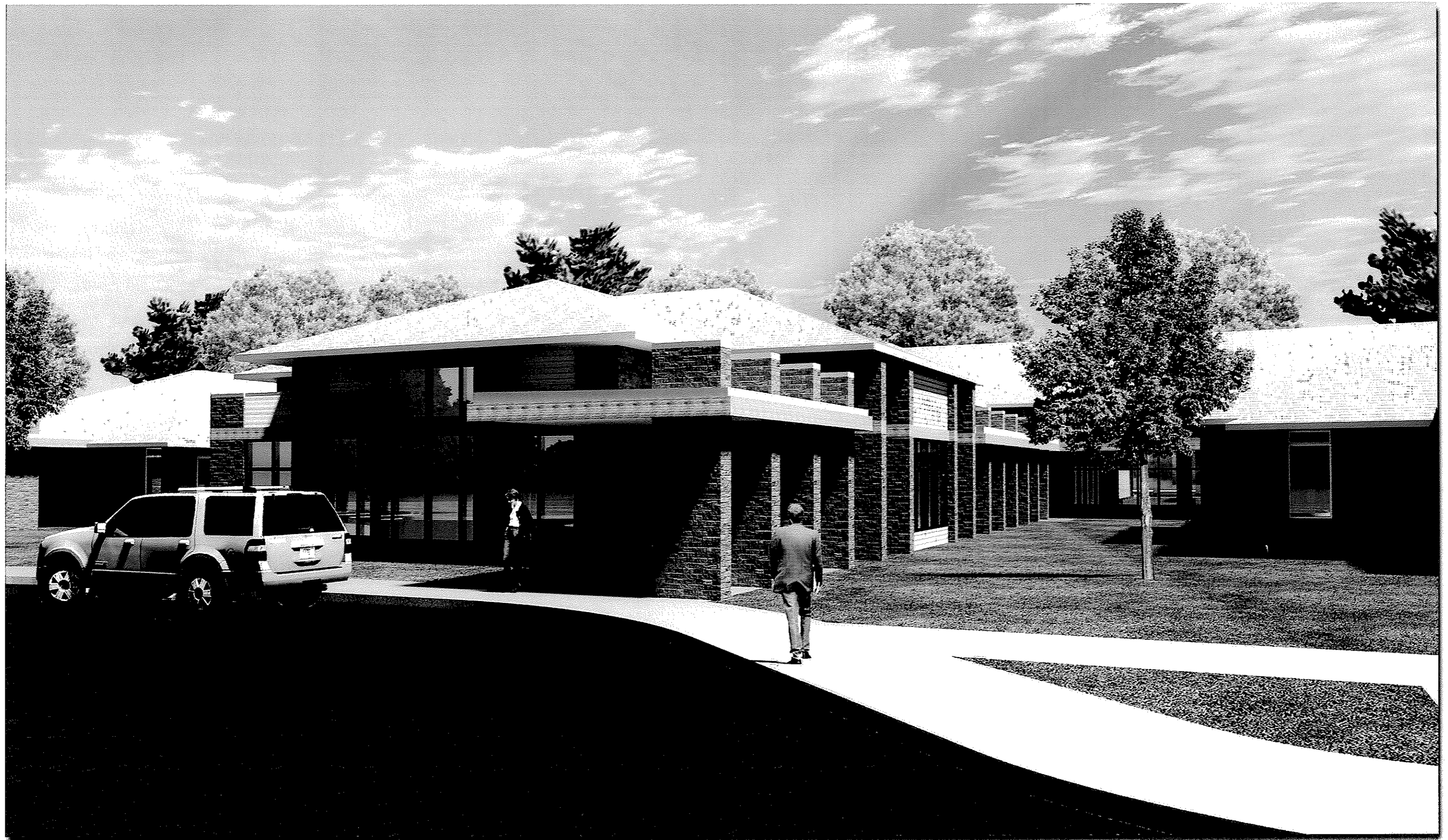
FRONT ENTRY VIEW