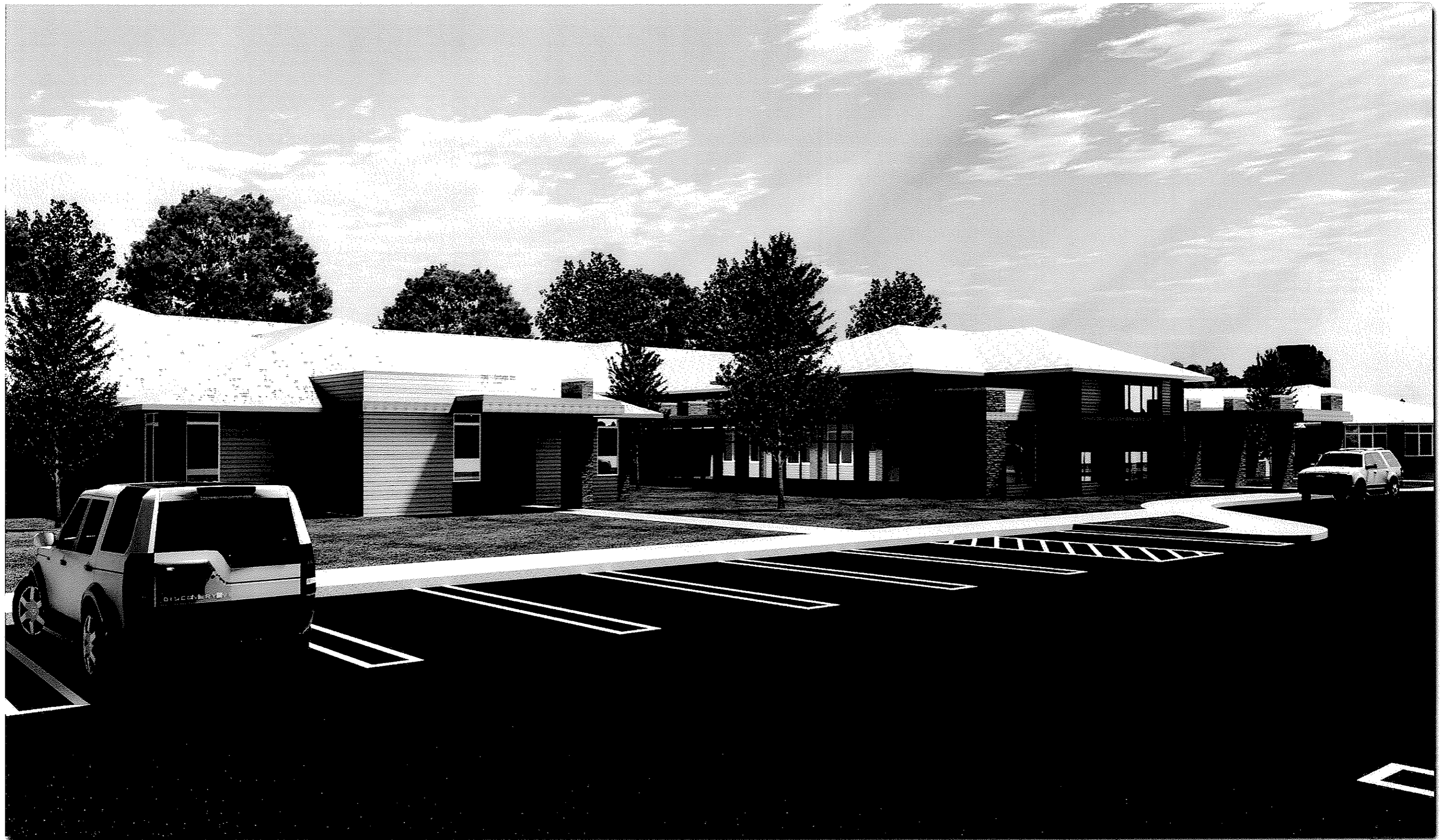
TYPICAL WING ENTRY VIEW