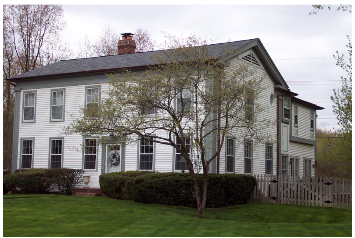
Figure 1 Charles Parker House, note rear addition.

The Charles Parker House was constructed in 1826. It is reportedly the first frame house constructed in Oakland County, according to the 1993 survey. It retains some classical details, but the original wood siding has been covered in vinyl, the front door and windows have been replaced, and the massing of the house has been compromised by the addition of the rear ell (Figure 1). Without the key character-defining features of wood siding and original wood windows with divided lights, the house cannot be considered significant for its architecture.