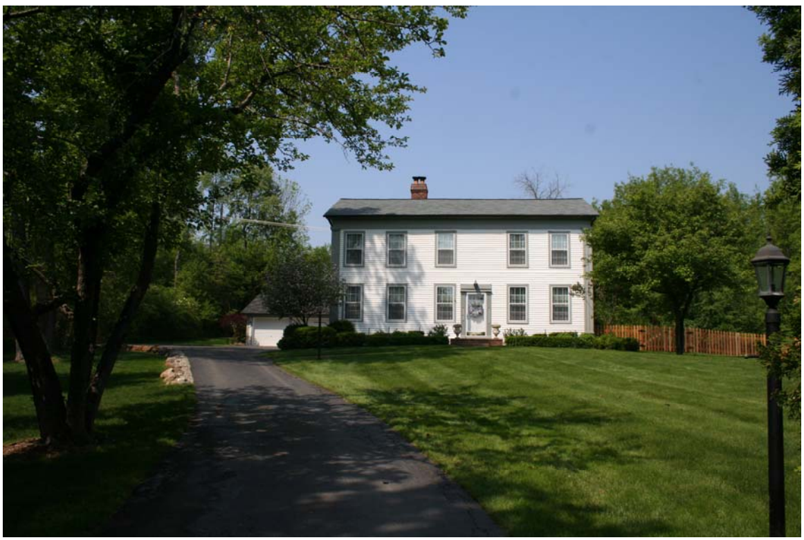
Figure 2 - 1207 N. Livernois, view from the east, May, 2007