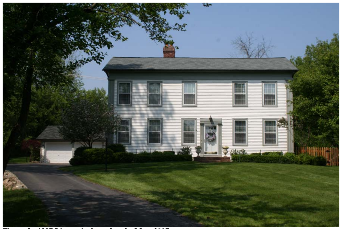
Figure 3 - 1207 Livernois, front facade, May, 2007