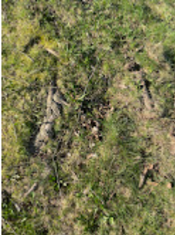
Roots In relation to manhole.jpg 7539K