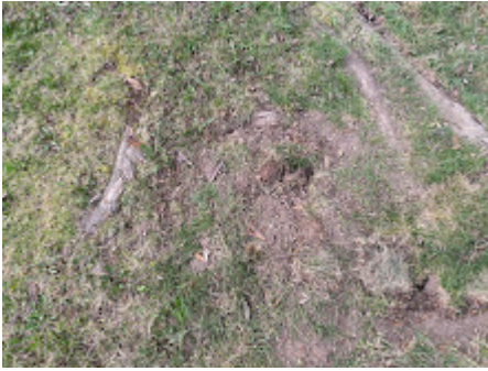
Root System.jpg 7630K