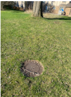
Sanitary Sewer.jpg 7241K

Planning Dept Email <planning@rochesterhills.org>