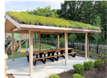
Green Pavilion Picnic Shelter