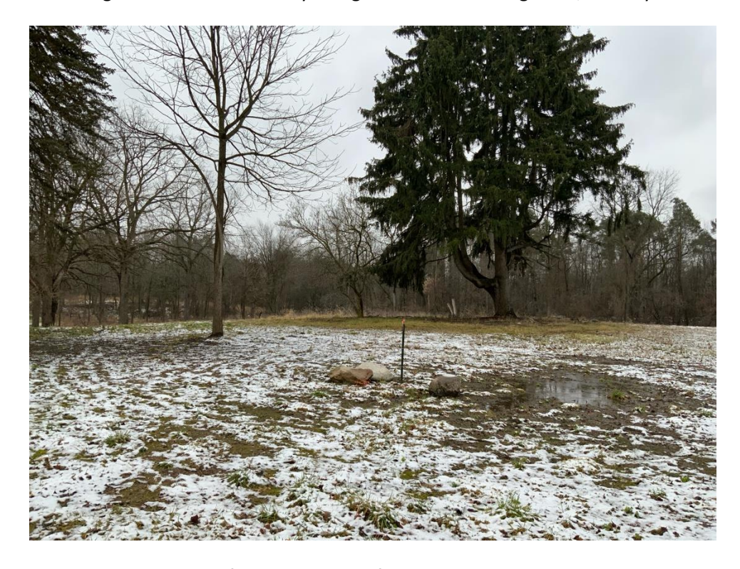
2-Looking southeast at former location of house, January 2024