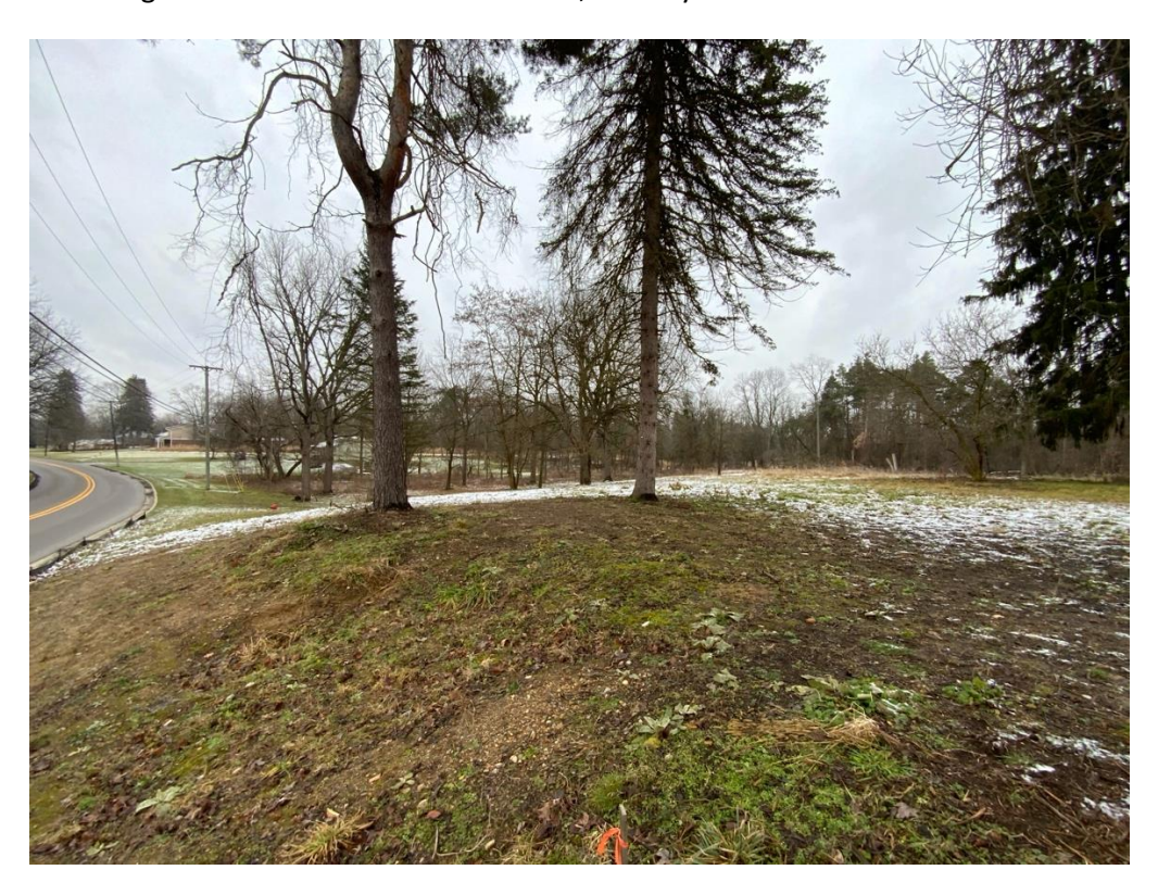
4-Looking east at property, January 2024