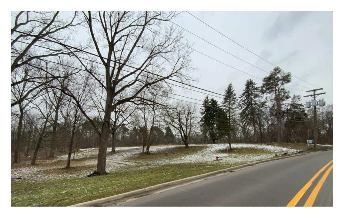
5-Looking southeast at overview of property, January 2024