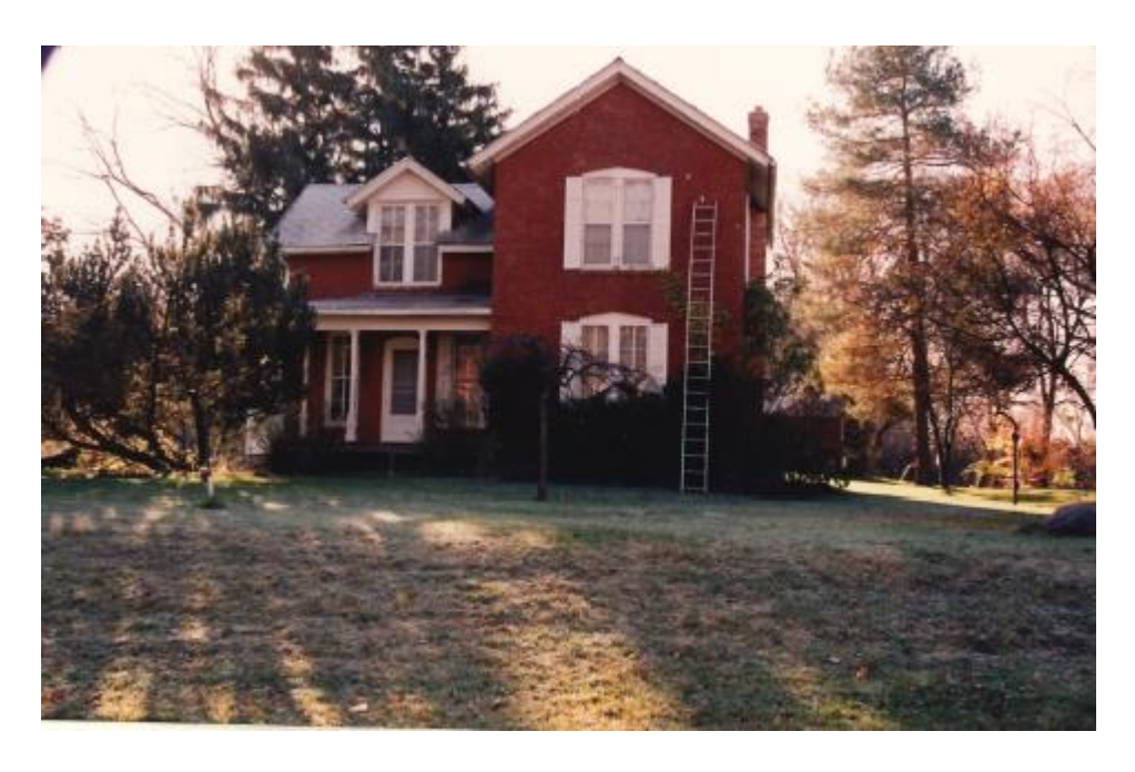
Photo 2 1021 Harding