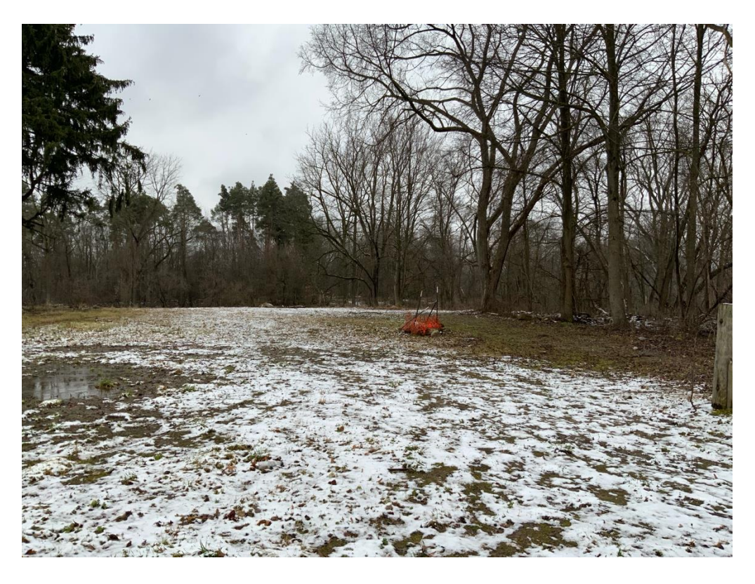
3\mbox{-}\textsc{Looking} south at former location of barn, January 2024