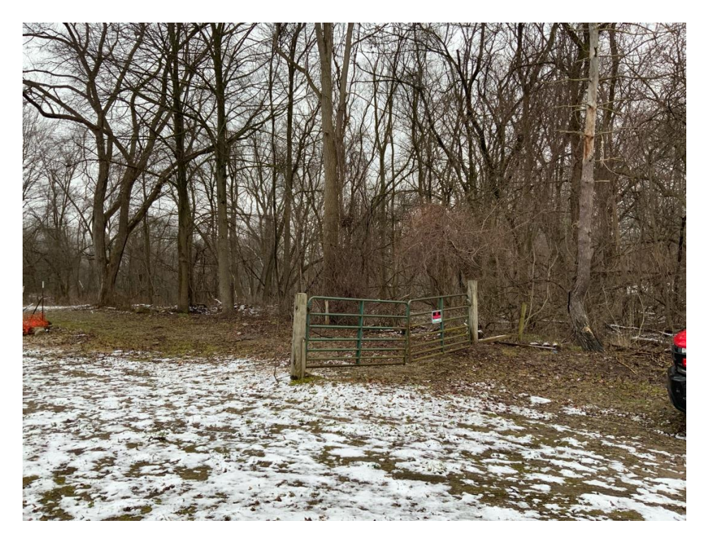
1-Looking southwest at driveway and gate at 1021 Harding Road, January 2024