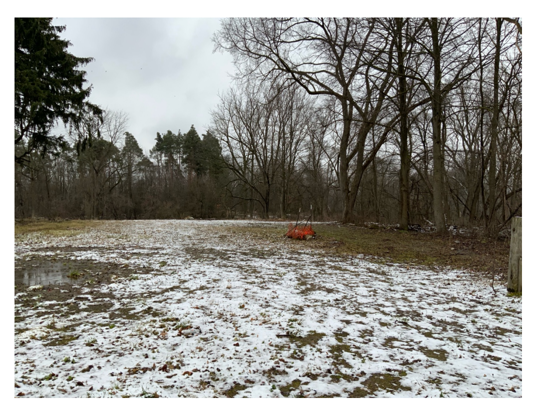
3-Looking south at former location of barn, January 2024