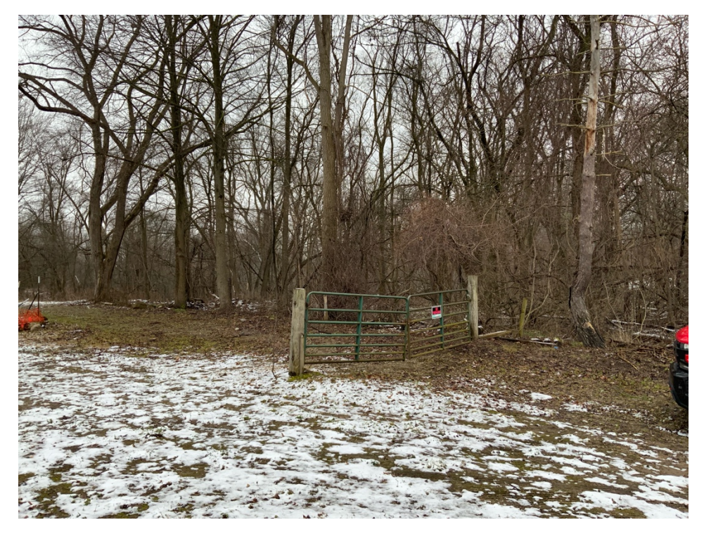
1-Looking southwest at driveway and gate at 1021 Harding Road, January 2024