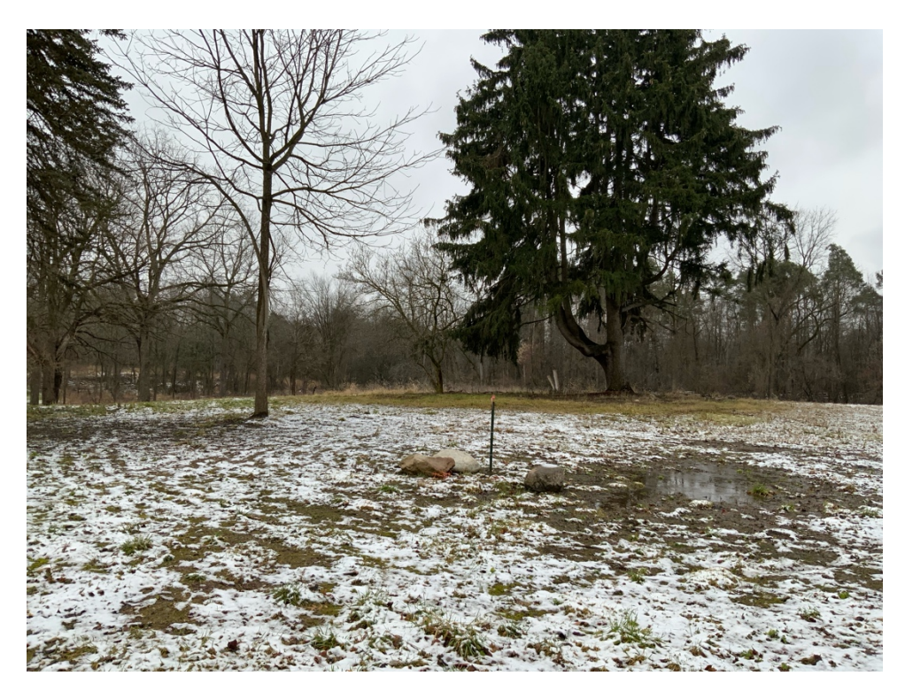
2-Looking southeast at former location of house, January 2024