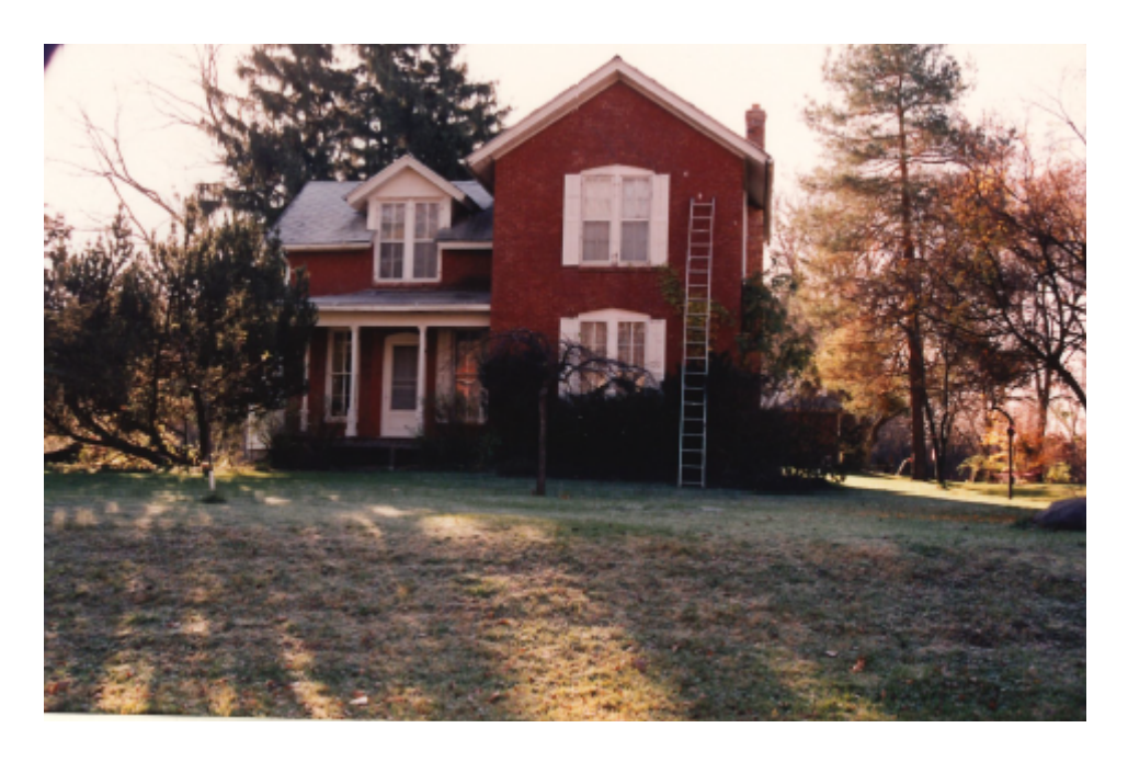
Photo 2 1021 Harding