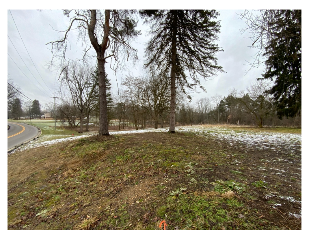
4-Looking east at property, January 2024