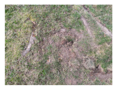
Root System.jpg 7630K