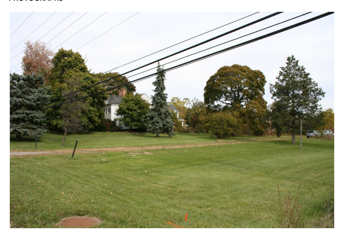
View of 1585 S. Rochester Road from the southwest, looking north, October, 2009