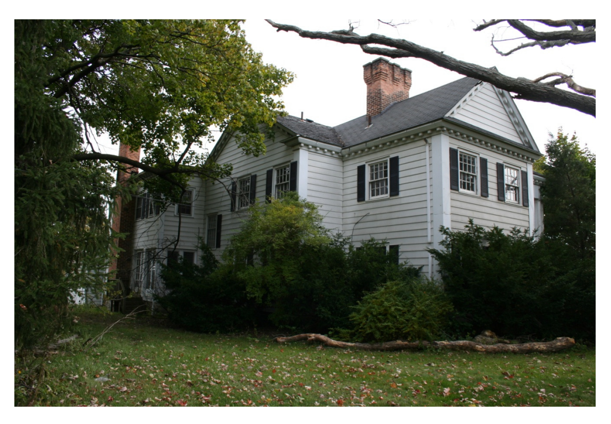
North and west elevations looking southeast, October, 2009