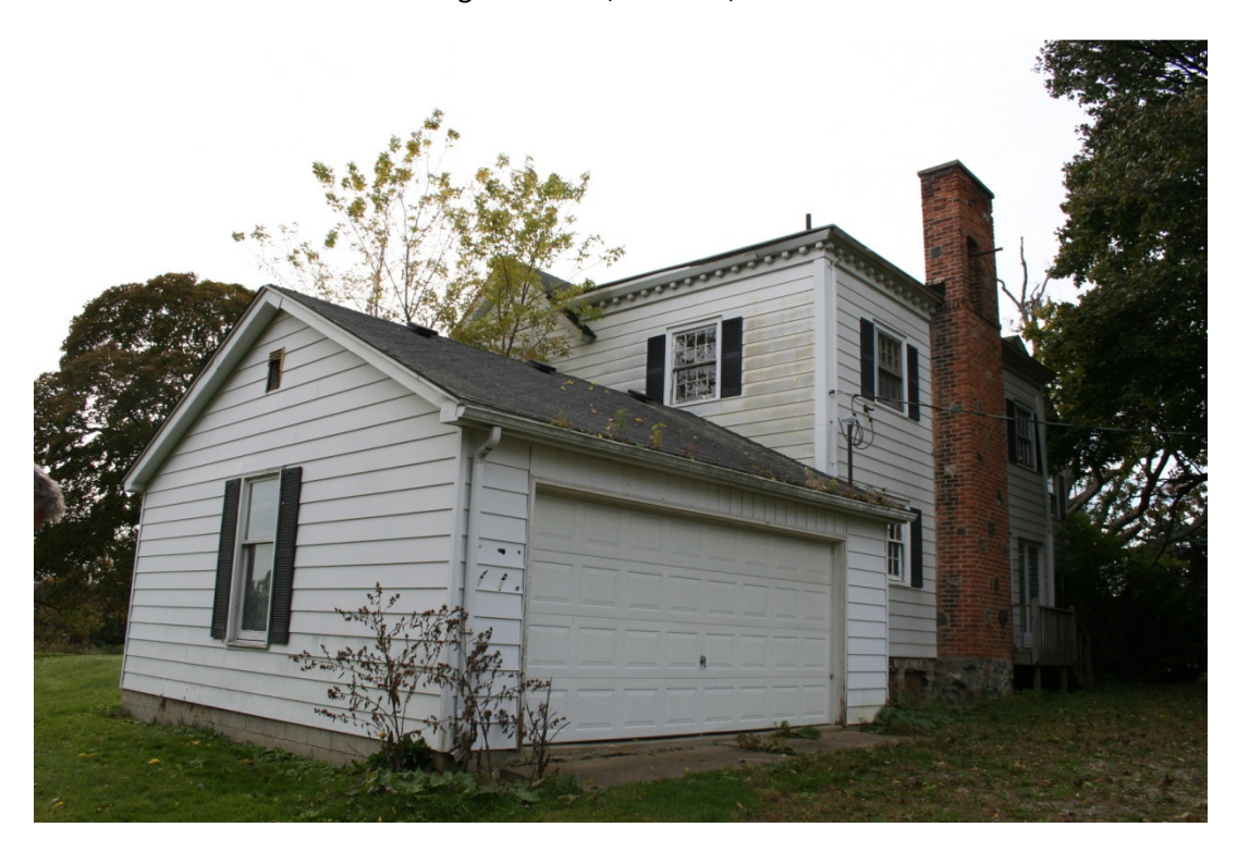
East elevation looking southwest, October, 2009