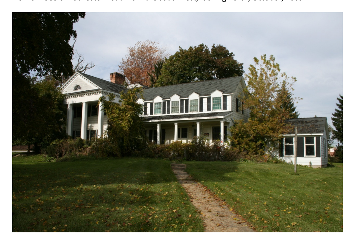
South elevation looking northwest, October, 2009