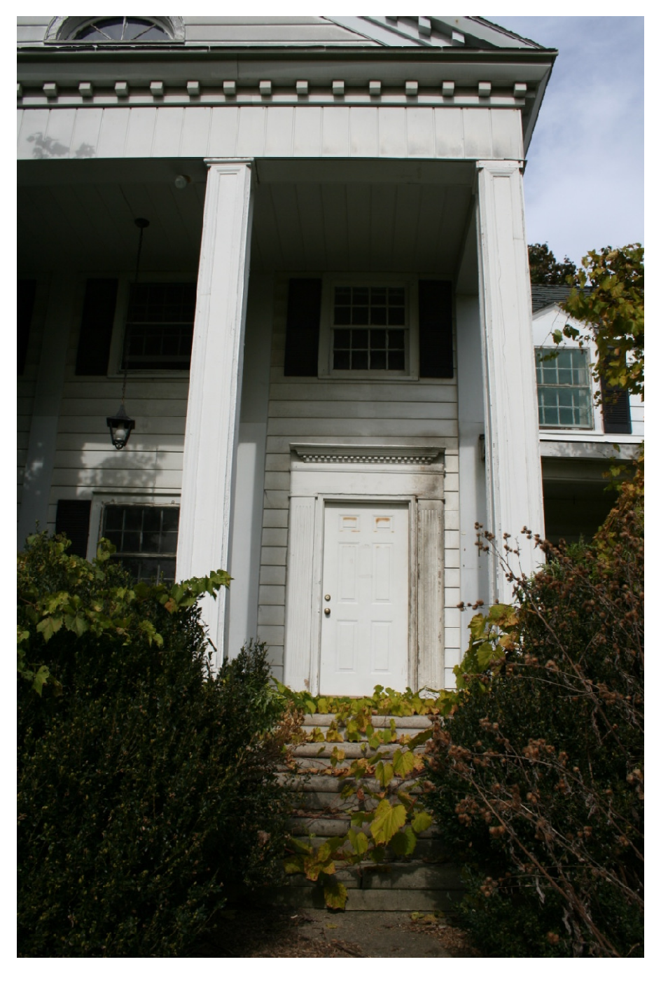
Detail of main entrance looking north, note non-proportional columns and door surround, October, 2009