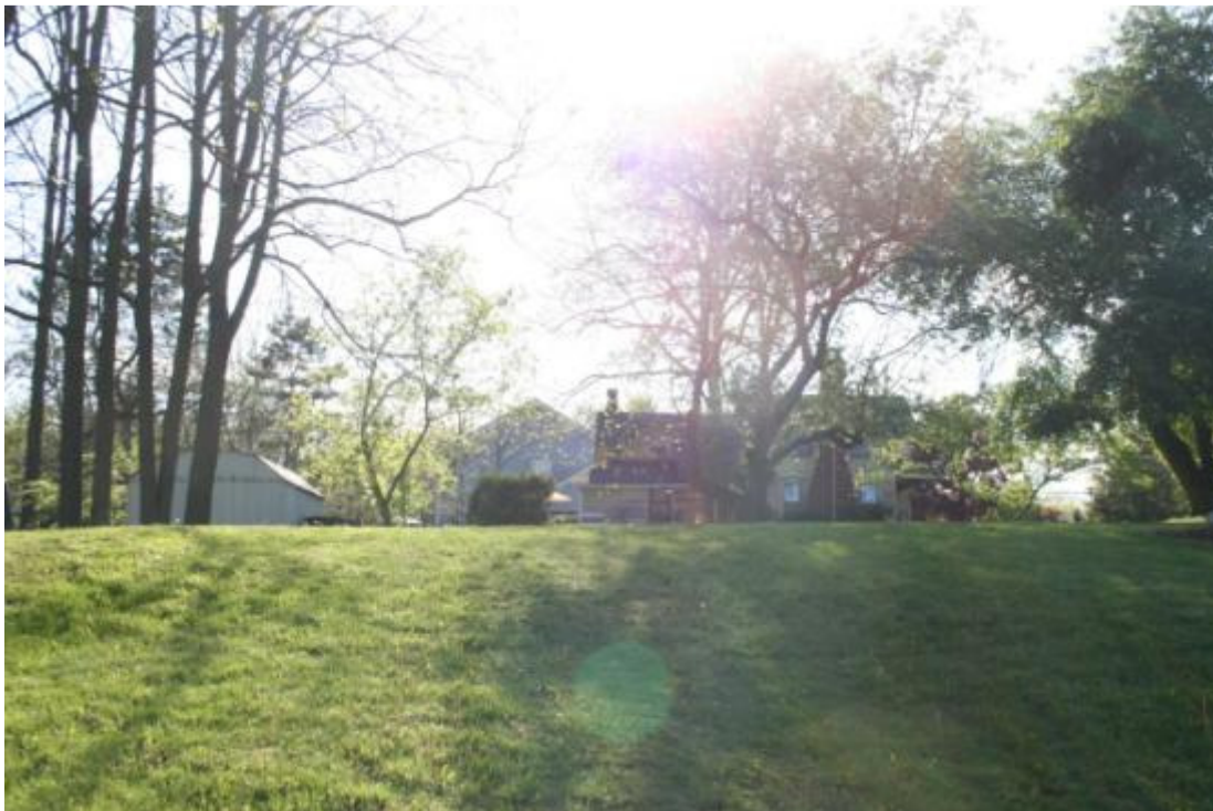
Looking west at 1631 W. Avon Road, non-historic shed to left, May 2012