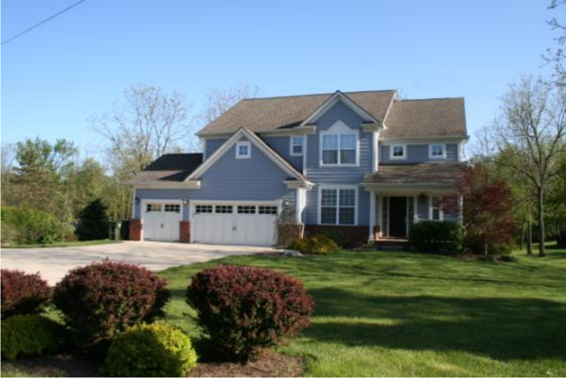
Looking south at 1651 W. Avon Road, constructed 2004, May 2012