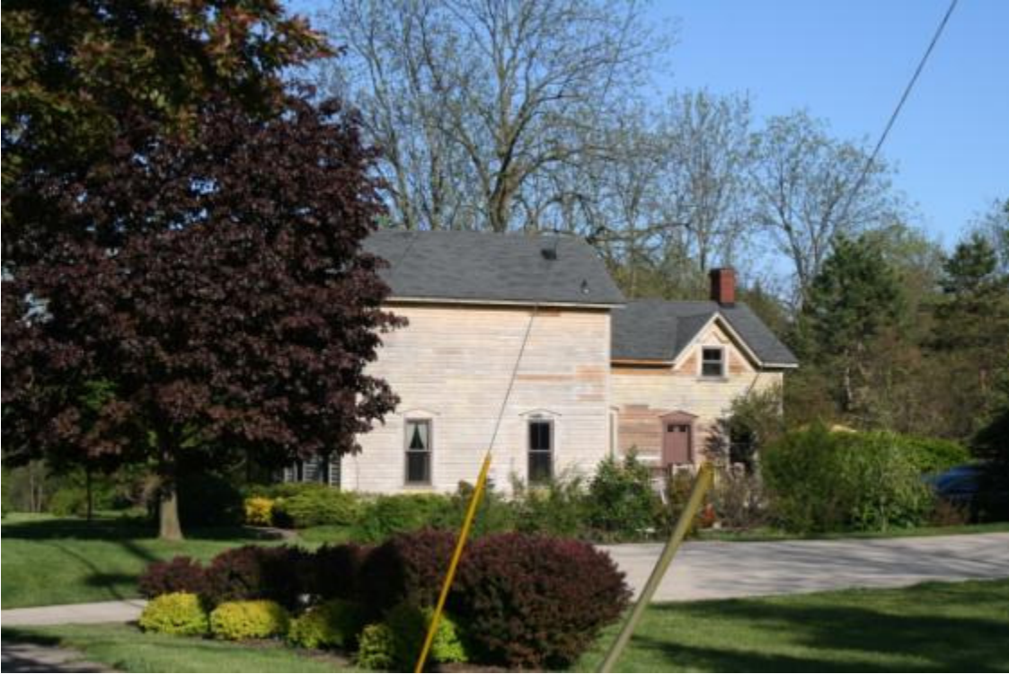
Looking east at 1631 W. Avon Road, May 2012