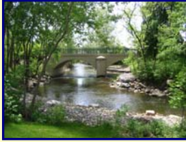
Paint Creek in Downtown Rochester