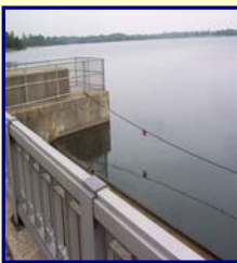
Stony Creek Lake