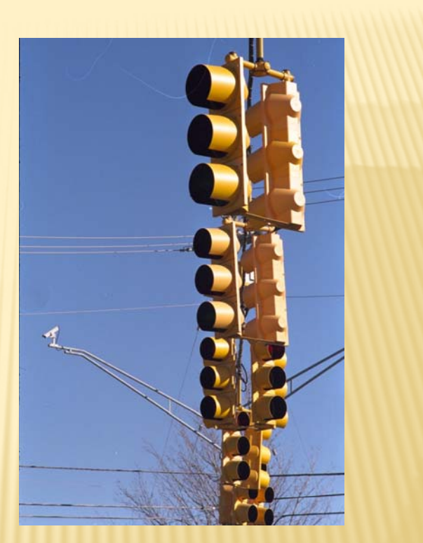
CITY OF ROCHESTER HILLS