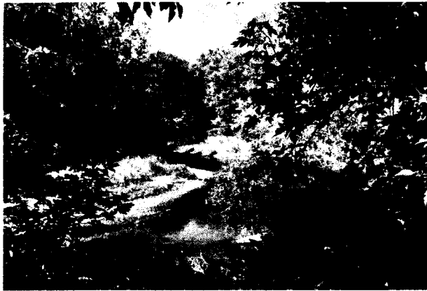
River vista along the Clinton River Trail in Rochester Hills.

Our quality of life will be preserved and enhanced when green space is preserved. Open spaces are visually attractive and enhance community values. Our air, water and wildlife all benefit from such natural habitats. We will be establishing a legacy of natural beauty for ourselves and for future generations.