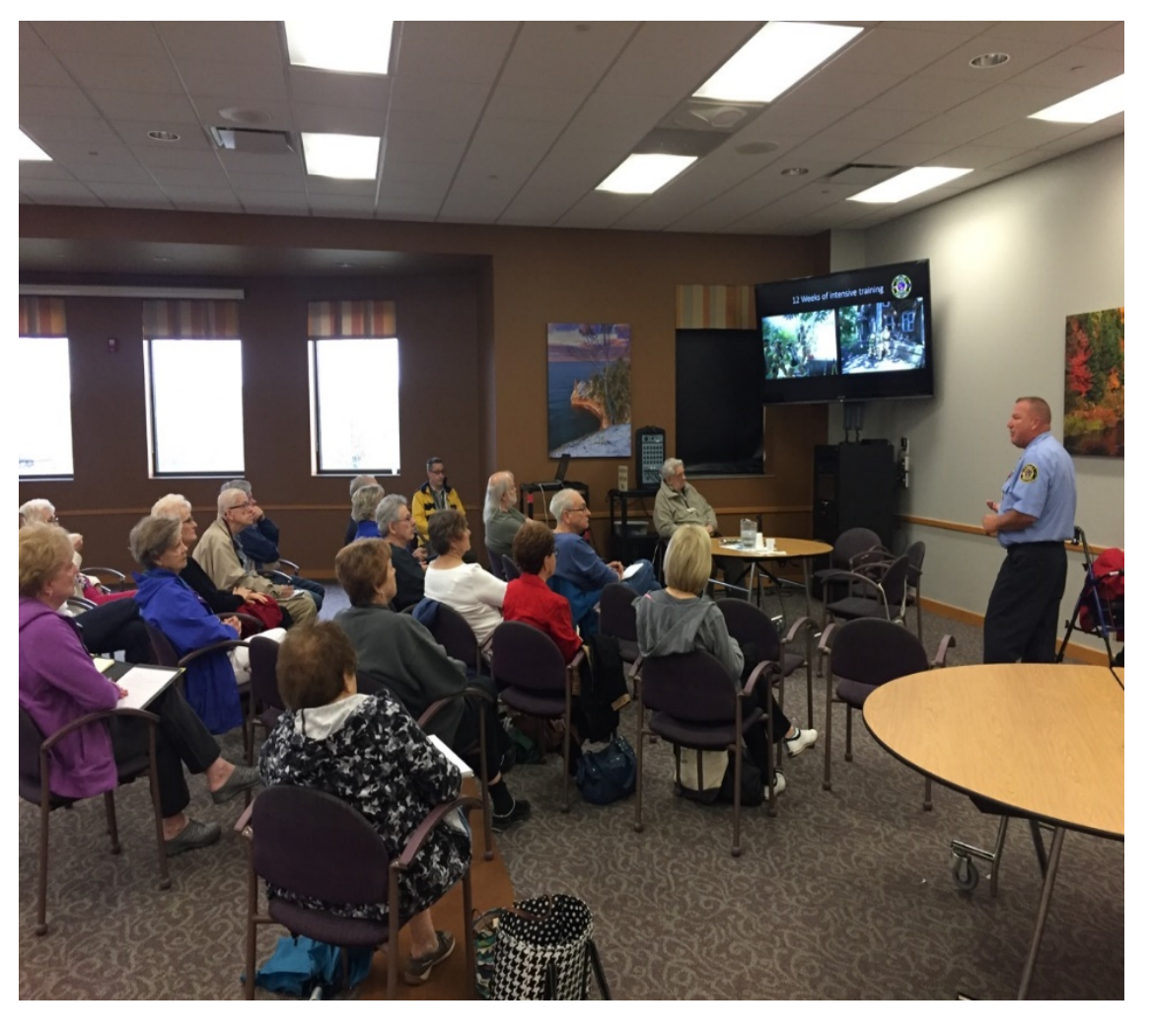
To improve our resident's Quality of Life!