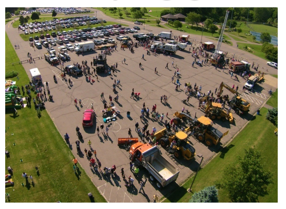
Tons of Trucks at Borden Park

APWA 2015 Project of the Year Award for the Clinton River Trailway Resurfacing Project (Quality of Life less than $1 Million)