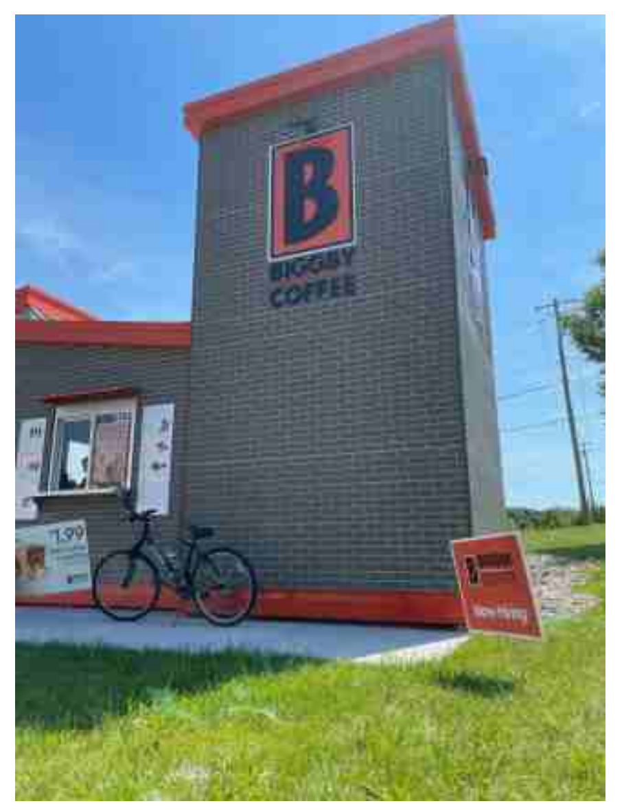
BCubed for Biggby Coffee Operating Locations: Independence KY