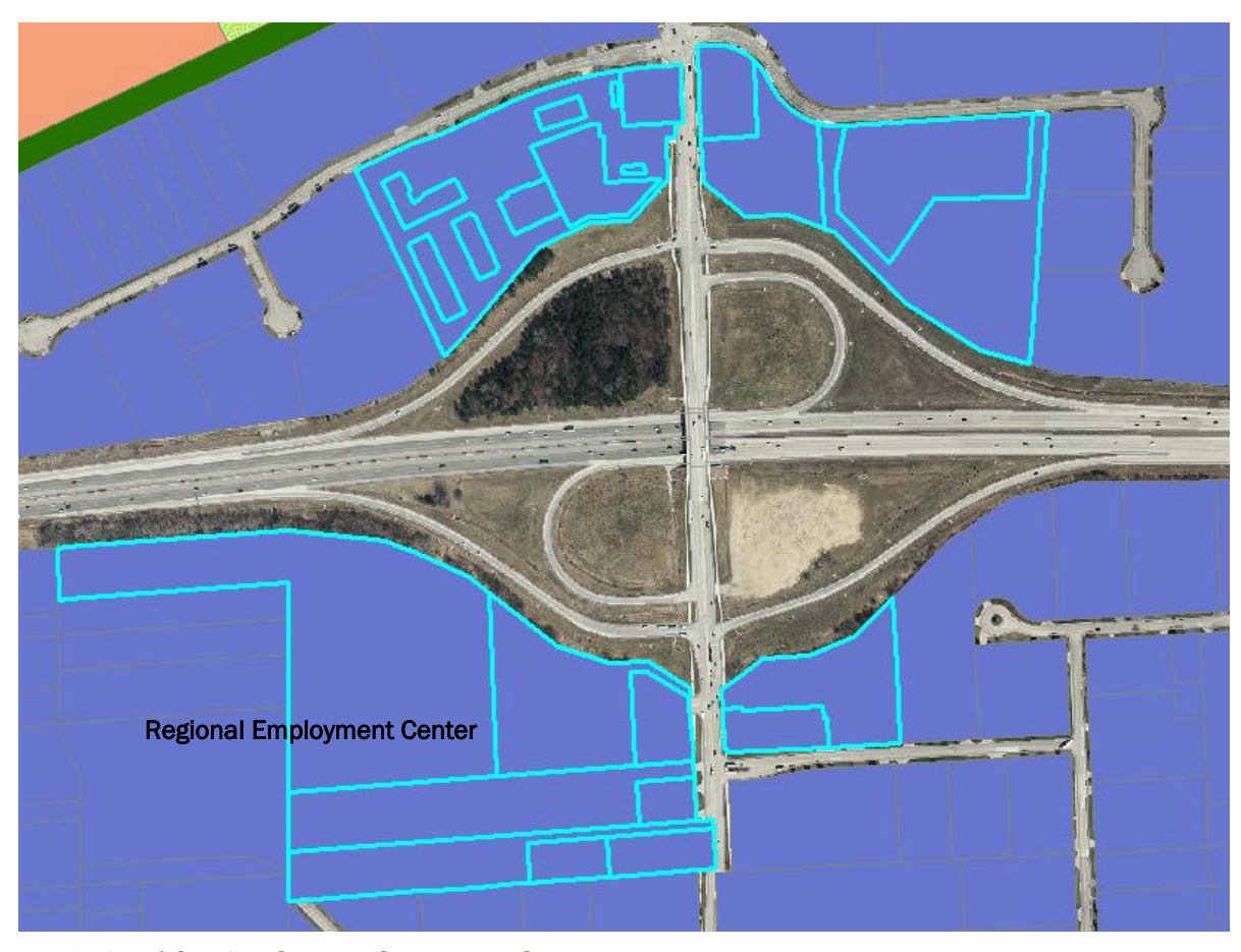
M-59 Corridor Study Development Plan