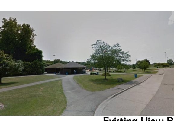
Existing View B