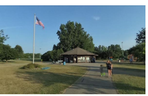
Existing View C