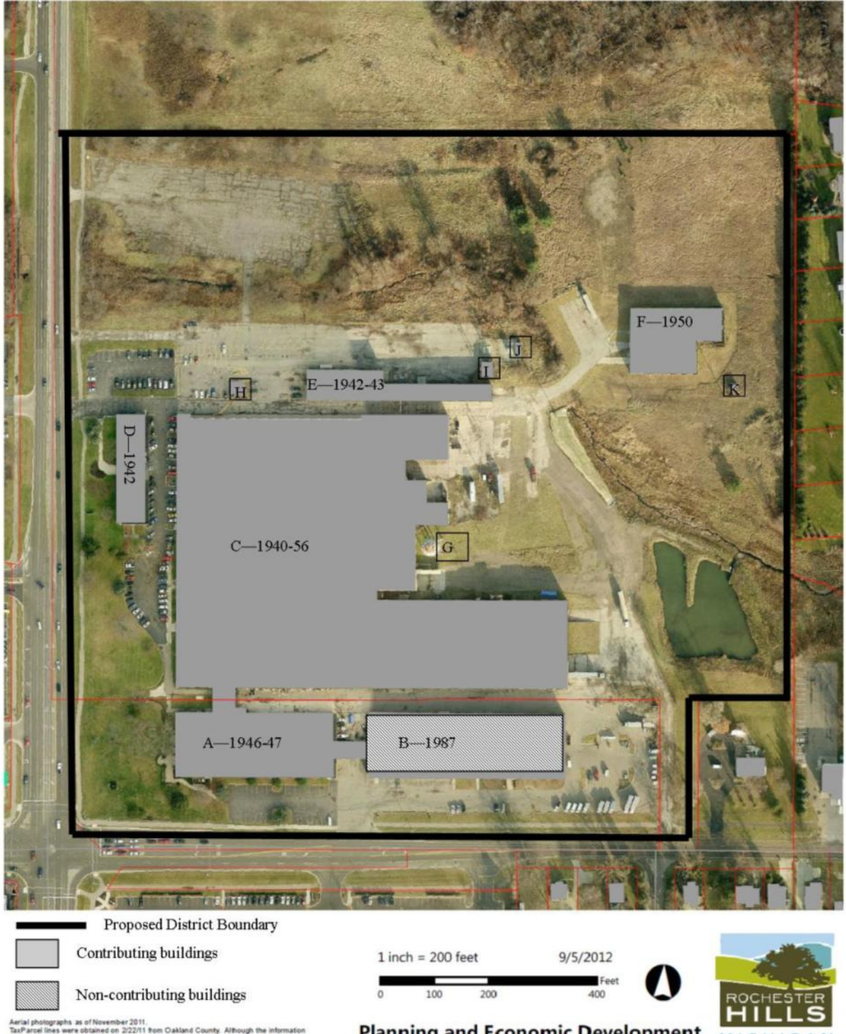
National Twist Drill Historic District 6825, 6841, and 6875 N. Rochester Road, Rochester Hills, Oakland County Proposed District Boundary Map

Planning and Economic Development MICHIGAN