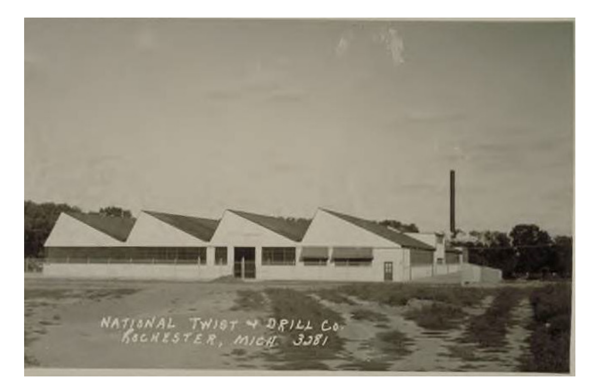
Figure 1. National Twist Drill & Tool Company factory, 1941.