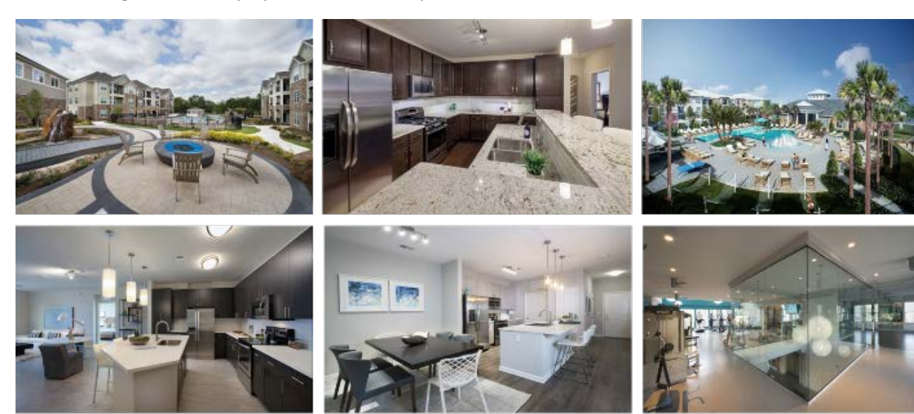
Goldberg Developments feature larger units with best-in-class finishes and amenities

The proposed development will provide Rochester Hills with its first modern, A+ apartment community. Goldberg is different than other developers since we are long-term owners that build nicer and larger units. We will attract well-educated millennials with solid jobs that are starting families, professors at nearby universities, and also serve a niche for current Rochester Hills residents who desire to downsize while keeping many housing luxuries. These residents often prefer larger apartments than what competitors offer, and high-end amenities, while not having to worry about maintenance and upkeep. Another retail/office site would not provide this element missing from the City's portfolio of developments.