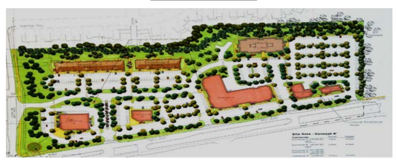
Retail & Commercial Site Plan

The northeast corner of Hamlin and Adams will undergo development in 2018. There was a Consent Judgment agreed upon in 2006 which specified that the property could be developed for retail and office use. A retail developer purchased the property in 2017, with the intent to develop the retail and commercial buildings. We approached that developer and have proposed to construct a multifamily residential development (called Legacy Rochester Hills) that will be more beneficial for the City and neighbors than was contemplated in the Consent Judgment.