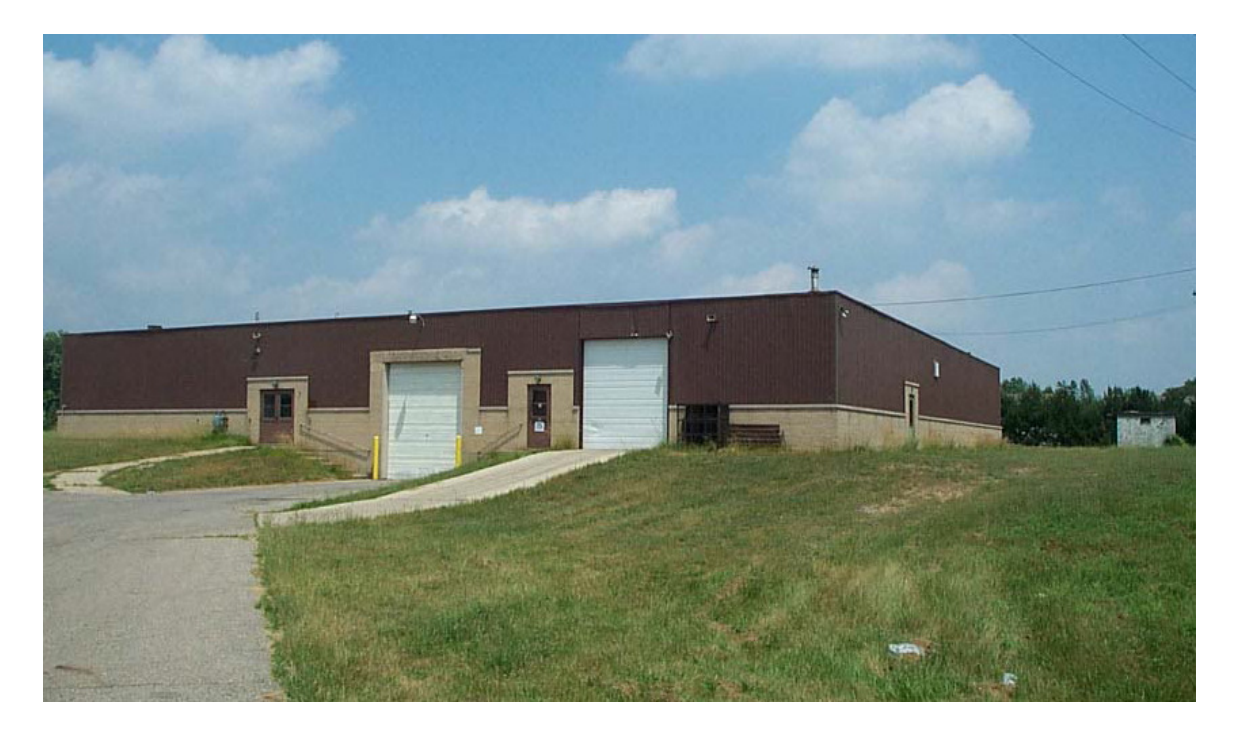
Photo 6. Factory building (F); utility structure (K) in background, looking northeast. Photo by Burke Jenkins, Hamilton Anderson Associates, May 2002.