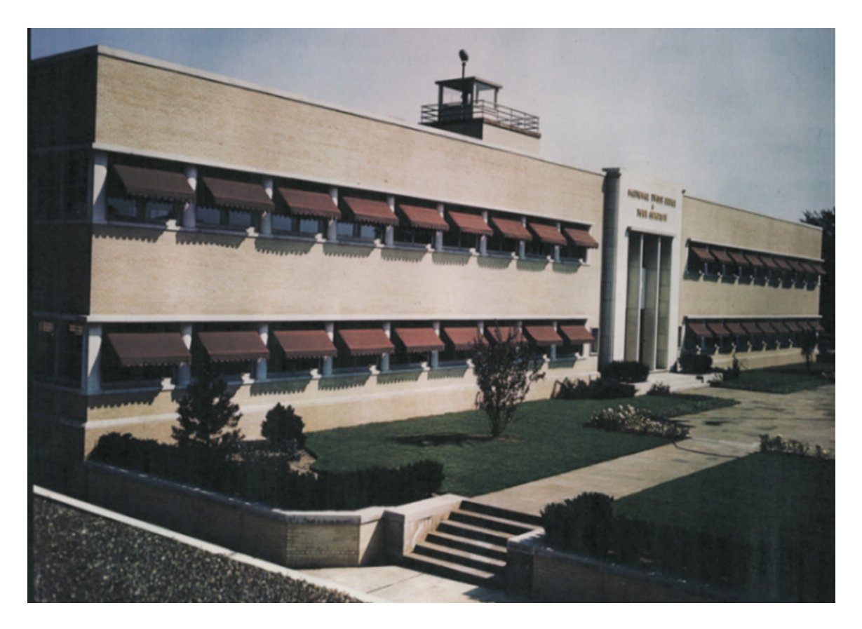
Figure 2. National Twist Drill & Tool Company office, ca. 1943.

Figure 1. National Twist Drill & Tool Company factory, 1941.