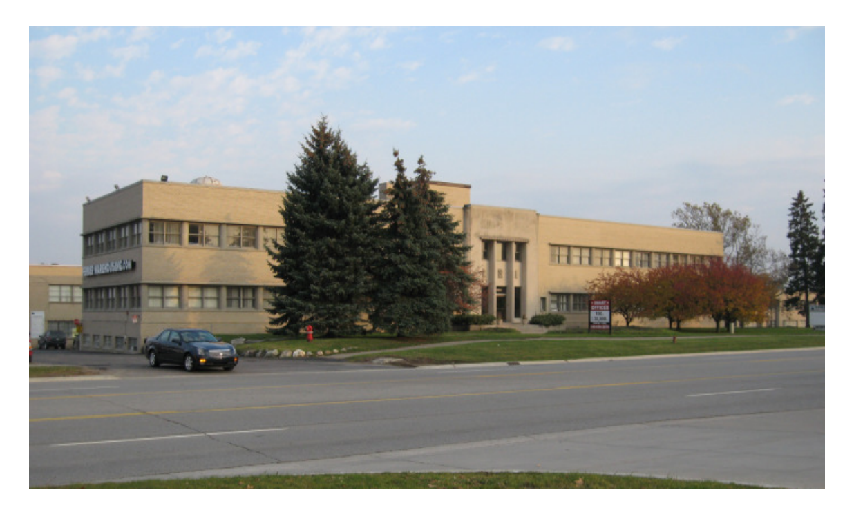
Photo 4. National office building, looking southeast (D). Photo by Jane Busch, November 2008.