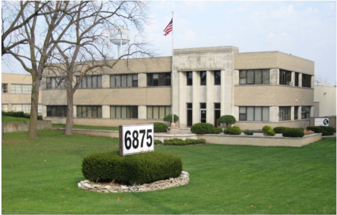
Photo 2. Winter Brothers building, looking northeast (A). Photo by Jane Busch, November 2008.