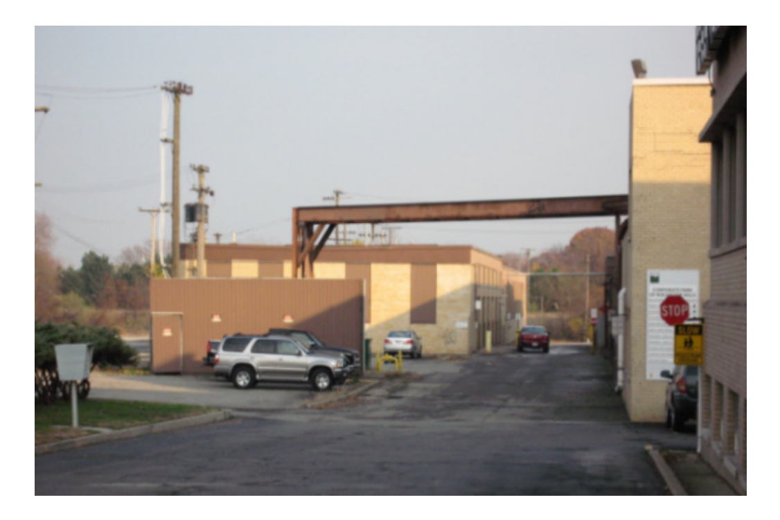
Photo 5. Utility structure (H) in front; factory building (E) in rear, looking northeast. Photo by Jane Busch, November 2008.

Photo 4. National office building, looking southeast (D). Photo by Jane Busch, November 2008.