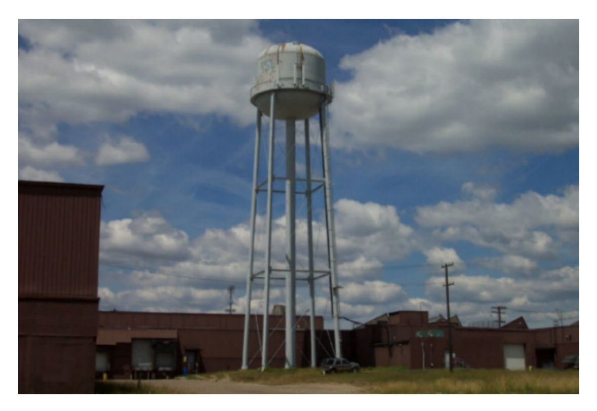
Photo 7. Water tower (G), looking northwest. Photo by Burke Jenkins, Hamilton Anderson Associates, May 2002.

Photo 6. Factory building (F); utility structure (K) in background, looking northeast. Photo by Burke Jenkins, Hamilton Anderson Associates, May 2002.