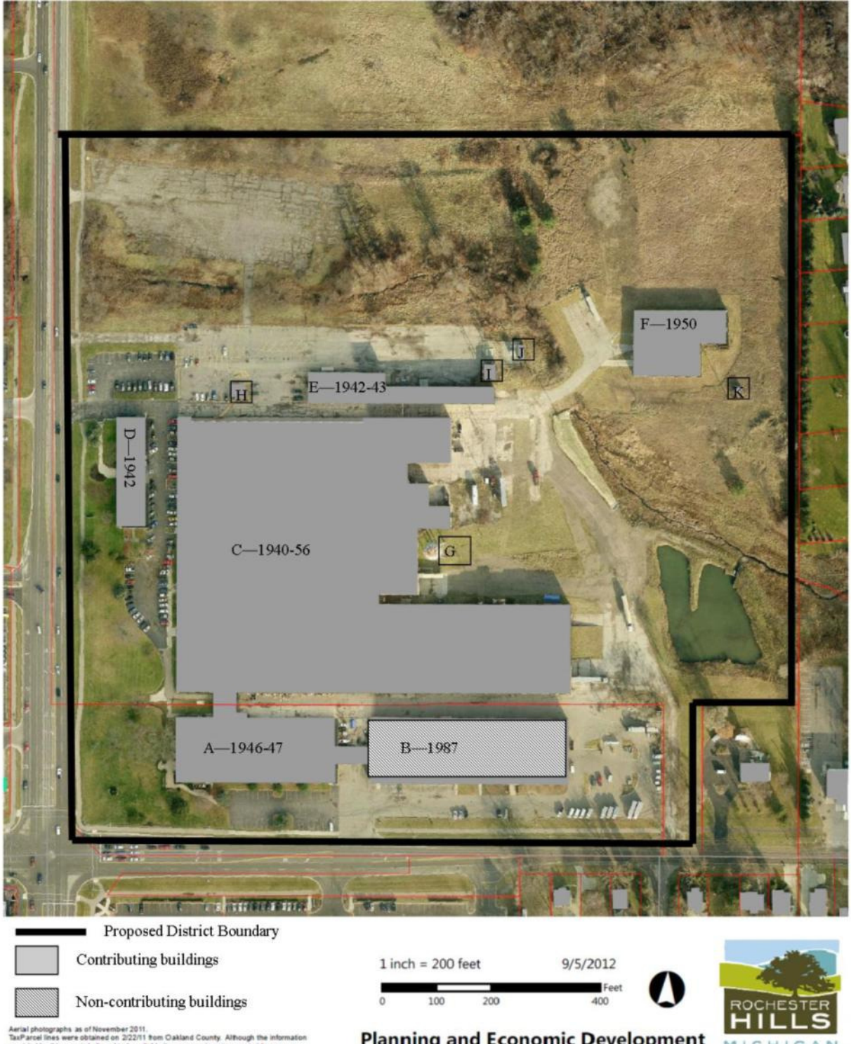
National Twist Drill Historic District 6825, 6841, and 6875 N. Rochester Road, Rochester Hills, Oakland County Proposed District Boundary Map

Planning and Economic Development MICHIGAN