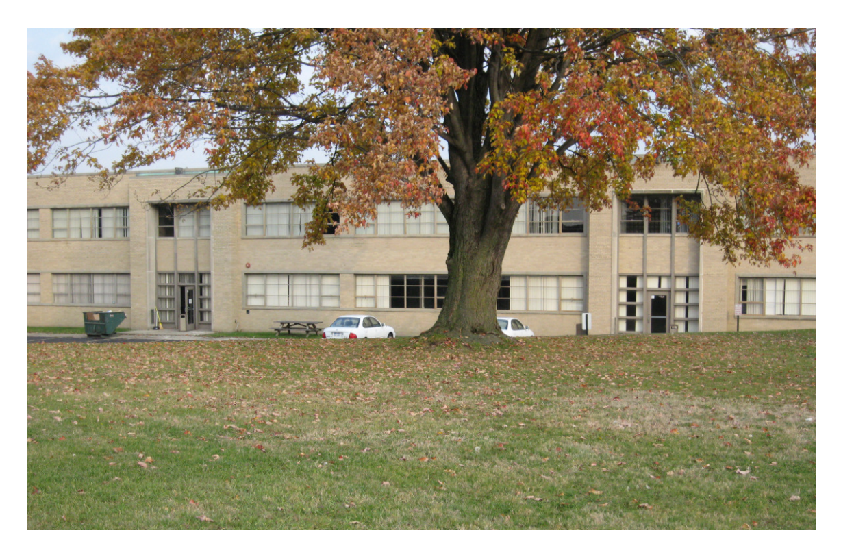
Photo 3. Main factory building, looking northeast (C). Photo by Jane Busch, November 2008.