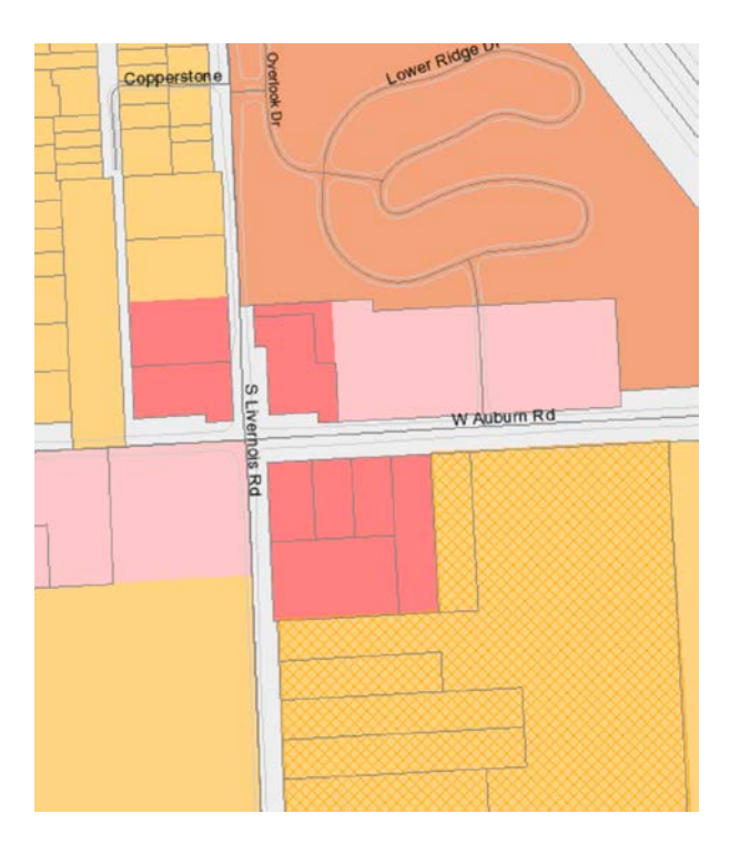
Future Land Use Map