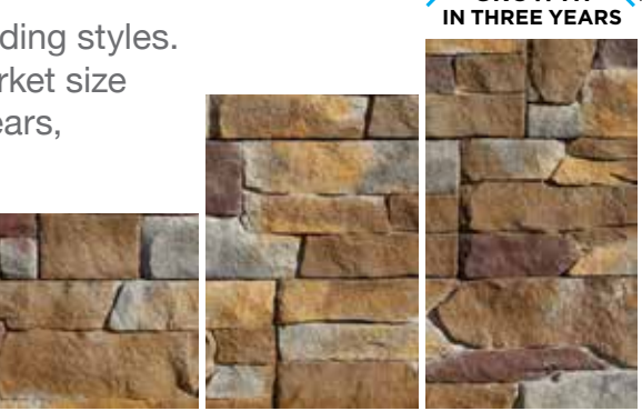
*According to recent statistics from the NAHB Home Innovation Research Labs.

CertainTeed STONEfaçade keeps you in the game, with a beautiful, high-performance stone veneer product designed for easy installation by siding contractors.