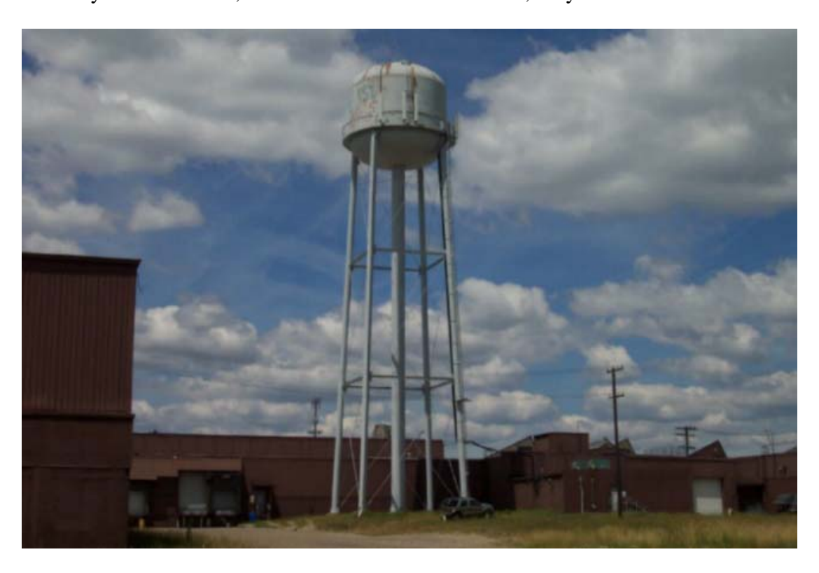
Photo 7. Water tower (G), looking northwest.