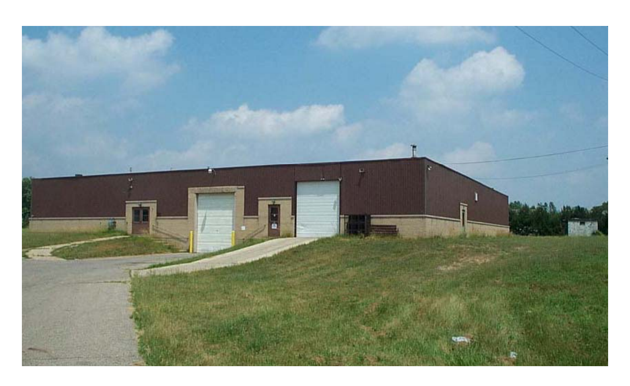
Photo 6. Factory building (F); utility structure (K) in background, looking northeast. Photo by Burke Jenkins, Hamilton Anderson Associates, May 2002.