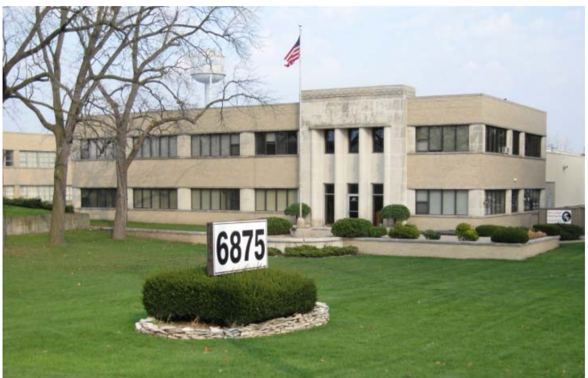
Photo 2. Winter Brothers building, looking northeast (A). Photo by Jane Busch, November 2008.