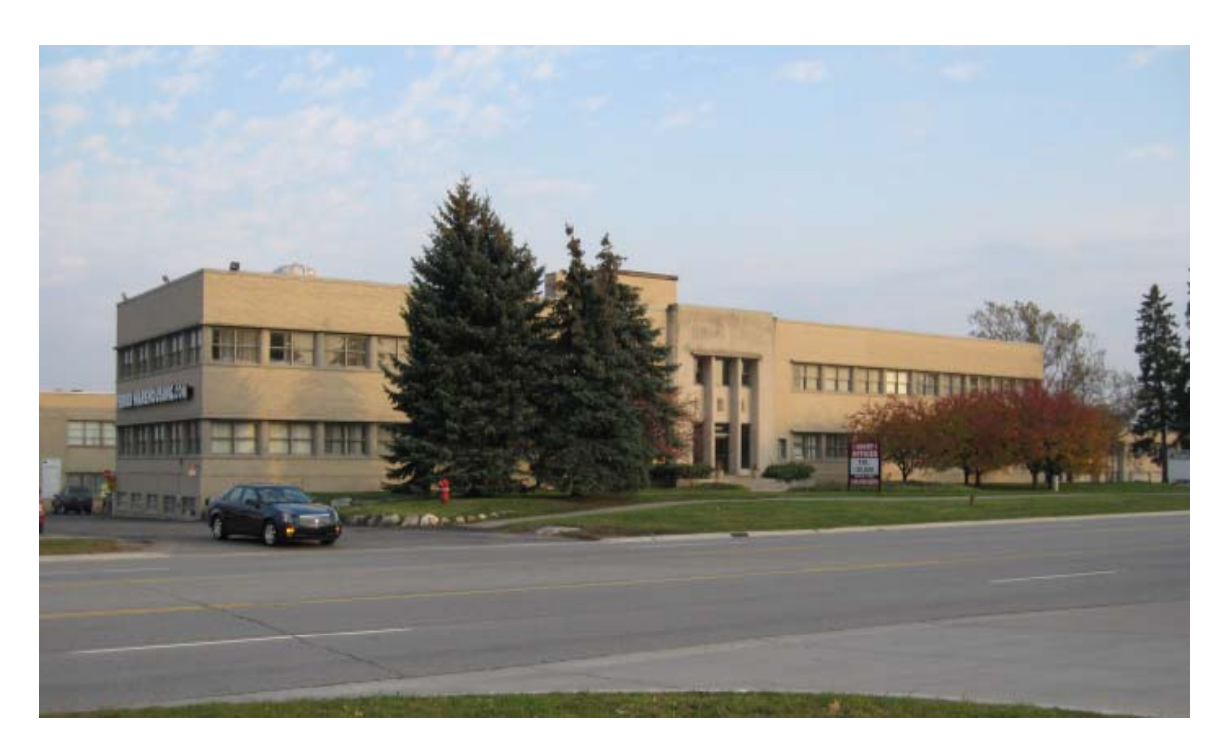
Photo 4. National office building, looking southeast (D). Photo by Jane Busch, November 2008.