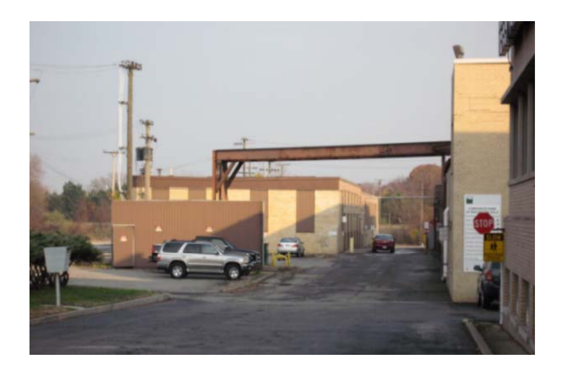
Photo 5. Utility structure (H) in front; factory building (E) in rear, looking northeast.