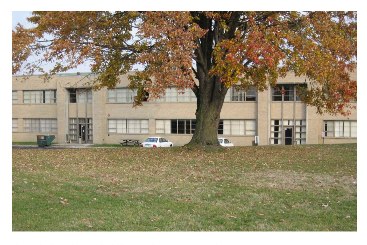
Photo 3. Main factory building, looking northeast (C). Photo by Jane Busch, November 2008.