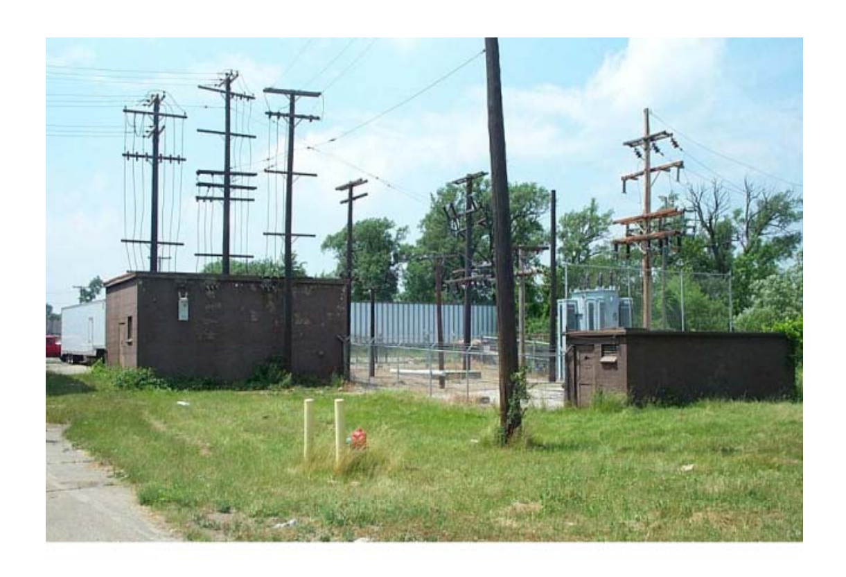
Photo 8. Utility structures I (left) & J, looking northwest.