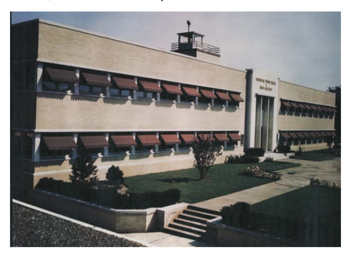
Figure 2. National Twist Drill & Tool Company office, ca. 1943.