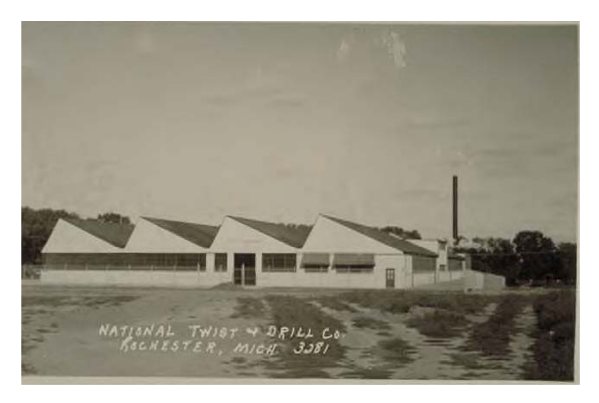
Figure 1. National Twist Drill & Tool Company factory, 1941.