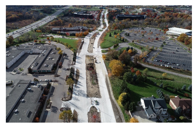
A corridor that's home to many North American headquarters, Hamlin Road, west of Adams Road was reconstructed in 2018