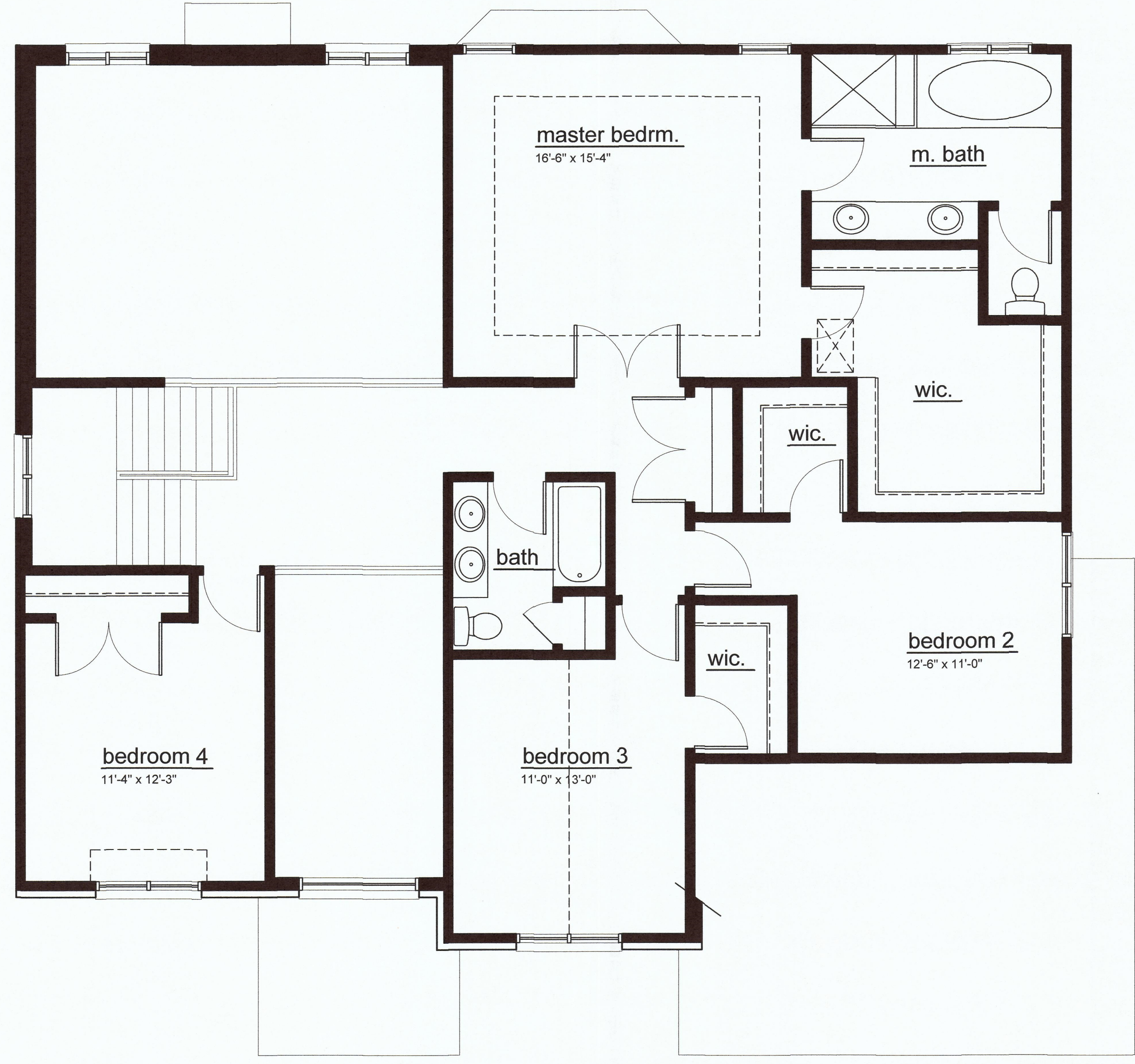
second floor plan