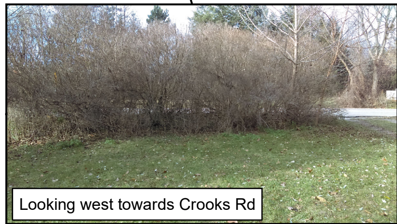
Looking west towards Crooks Rd