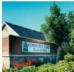
COMMERCE LAKE WOODS/ Commerce Twp. / Michigan / Commerce Lake Woods provided the much demanded starter homes in area.