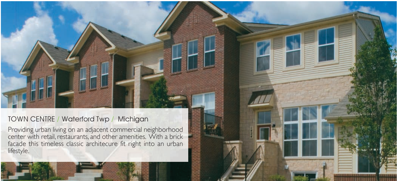
TOWN CENTRE / Waterford Twp / Michigan Providing urban living on an adjacent commercial neighborhood center with retail, restaurants, and other amenities. With a brick facade this timeless classic architecture fit right into an urban lifestyle.