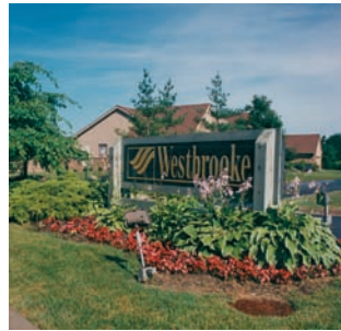
WESTBROOKE / West Bloomfield / Michigan /

Westbrooke is an infill community, nestled on a bluff in the heart of West Bloomfield. Community amenities include a pool, tennis courts and a pocket parks.