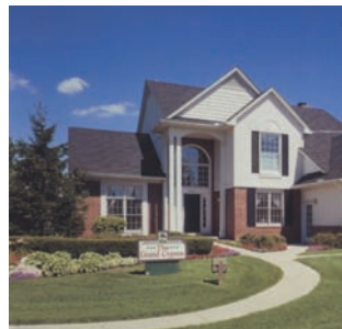
WOODBURY PARK / West Bloomfield / Michigan /

The acclaimed Torrey subdivision has received numerous accolades for its success in situating its homes while maintaining the wooded environment.