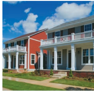
HARBOR VILLAGE / Keego / Michigan /

located in Keego Harbor, featuring Neo-Traditional community design a concept that reflects the characteristic of 20th century American neighborhood architecture.