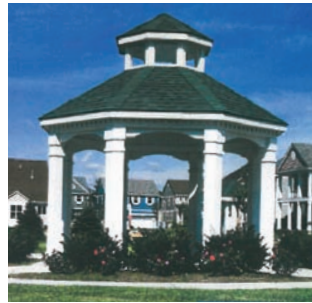
HARBOR VILLAGE/ Keego Harbor / Michigan /

Harbor Village very reminiscent of small town America, with several pocket parks, walking trails and a community gazebo, with shops and dining within walking distance of the neighborhood