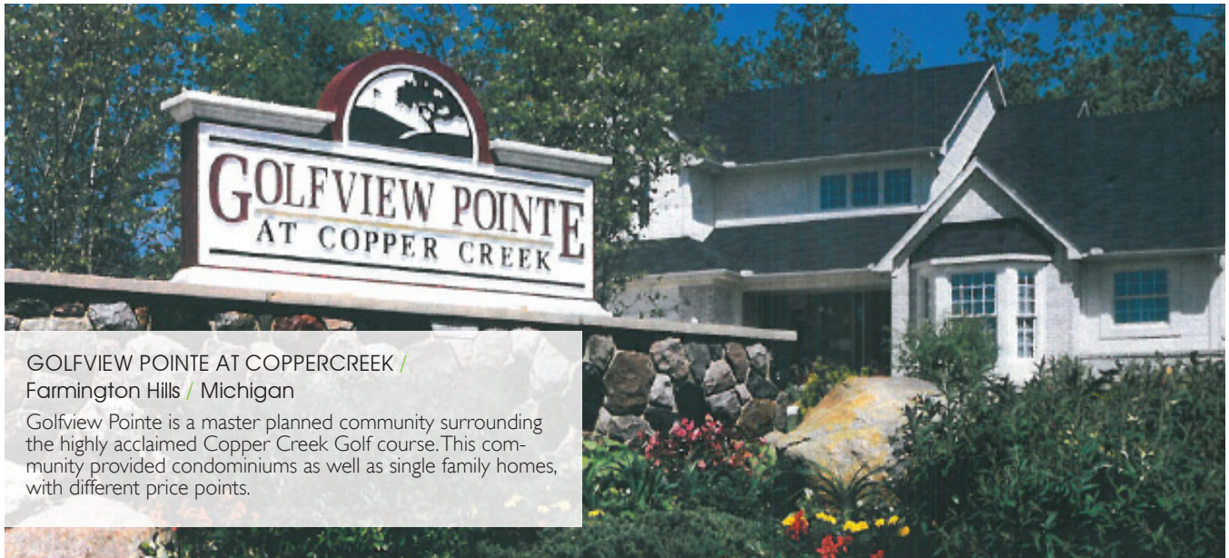
GOLFVIEW POINTE AT COPPERCREEK / Farmington Hills / Michigan

Golfview Pointe is a master planned community surrounding the highly acclaimed Copper Creek Golf course. This community provided condominiums as well as single family homes, with different price points.