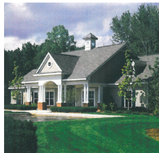
HARRISON COVE/ Harrison Twp. / Michigan /

A prestigious golf course community Oakhurst boasts successful variation of architecture and landscaping designs