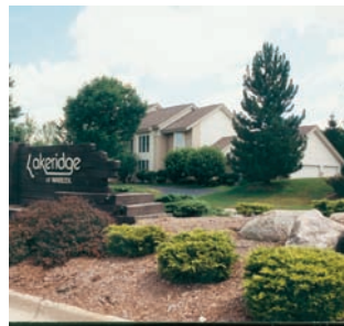
LAKERIDGE OF WABEEK AND CAMEO LAKE OF WABEEK/ West Bloomfield / Michigan / One of numerous enclaves within the Wabek master planned community. The majority of the homes backed up to the golf course, woods or ponds.