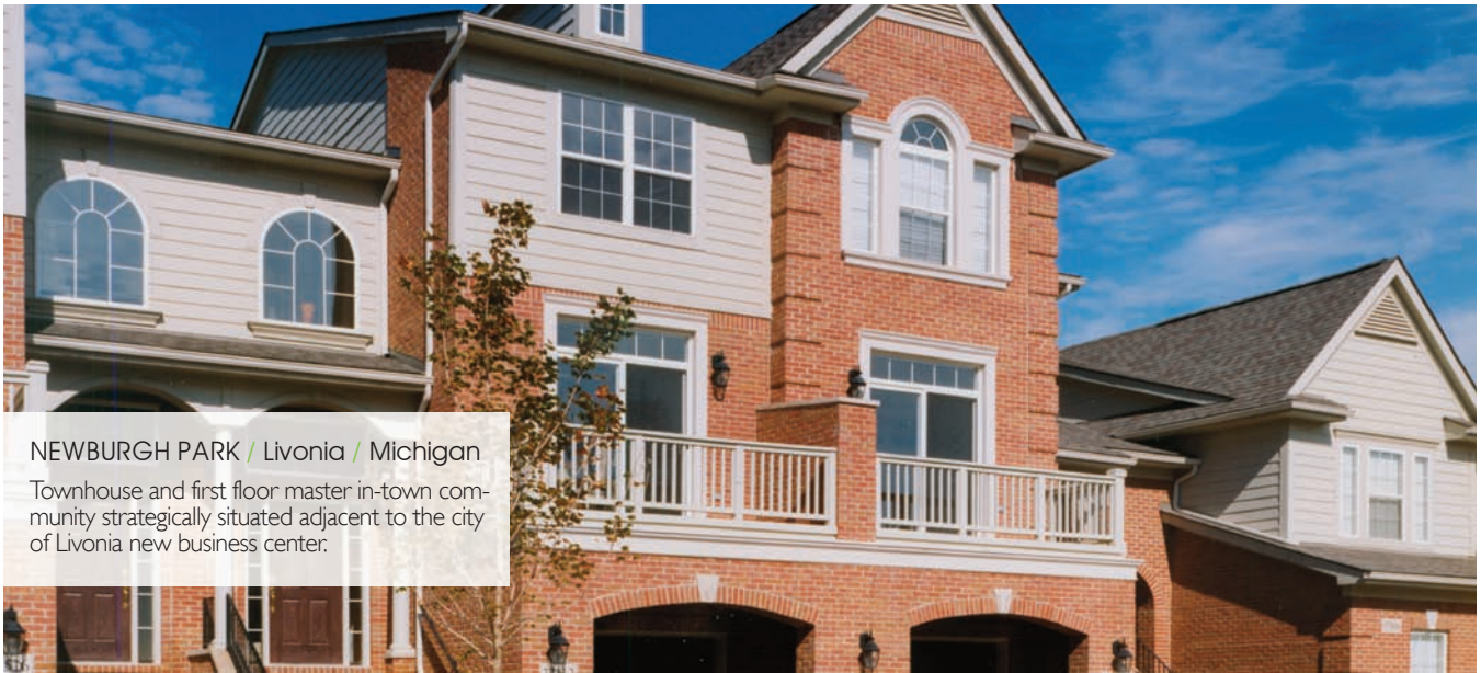
NEWBURGH PARK / Livonia / Michigan Townhouse and first floor master in-town community strategically situated adjacent to the city of Livonia new business center.