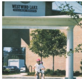
WESTWIND LAKE / West Bloomfield / Michigan /

located in Keego Harbor, featuring Neo-Traditional community design a concept that reflects the characteristic of 20th century American neighborhood architecture.