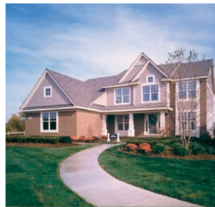
SPRING MEADOW BIRCHWOOD PARK / West Bloomfield / Michigan /

Commercial residential, single family master planned community. Five distinctive house price points pedestrian and vehicle access to shopping, dining and