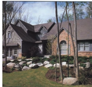
TORREY RIDGE / West Bloomfield / Michigan /

Westbrooke is an infill community, nestled on a bluff in the heart of West Bloomfield. Community amenities include a pool, tennis courts and a pocket parks.