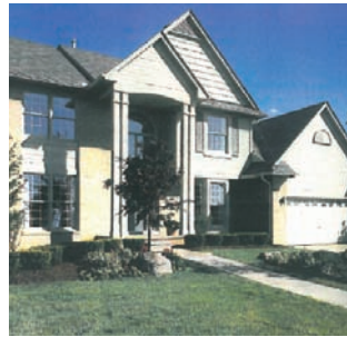
CARRINGTON PARK/ West Bloomfield / Michigan / Estate sized homes located adjacent to and with pedestrian access to the new state-of-the-art Henry Ford Medical Center