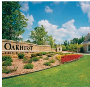
OAKHURST / Clarkston / Michigan /

Harbor Village very reminiscent of small town America, with several pocket parks, walking trails and a community gazebo, with shops and dining within walking distance of the neighborhood